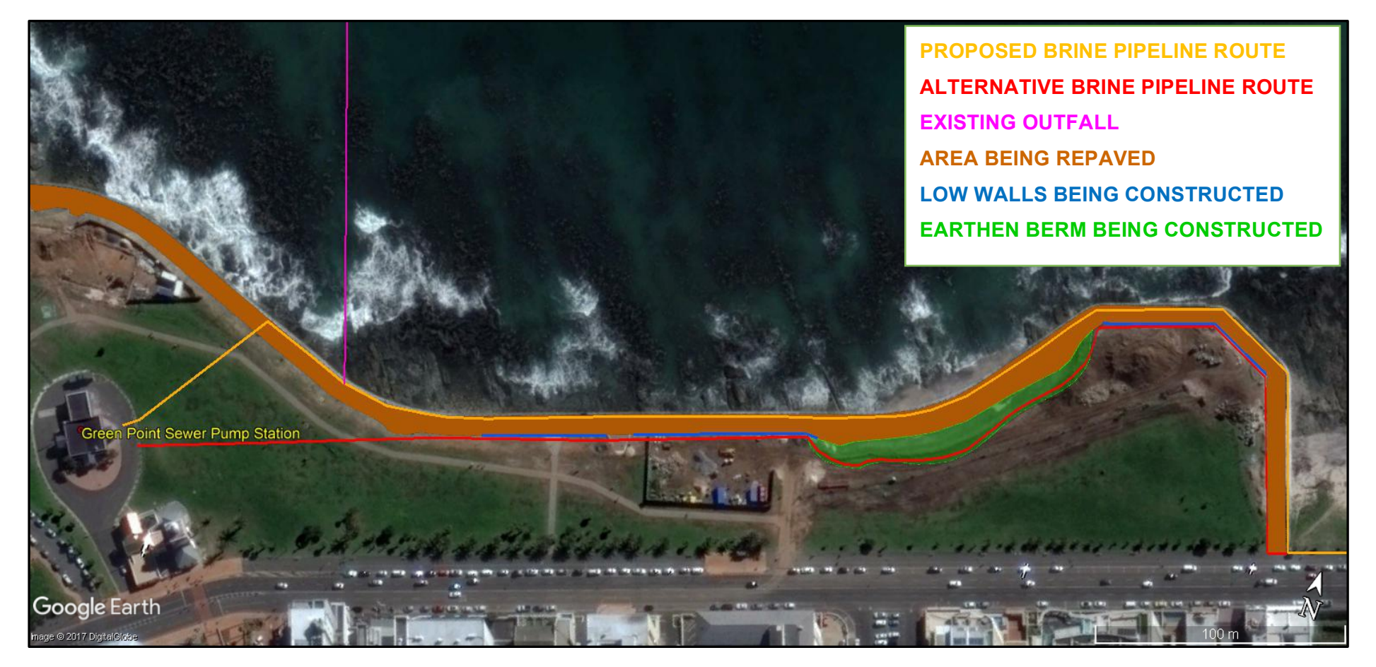
Figure 8.2. Proposed Alternative (Mitigation) Brine Discharge Pipeline route in relation to proposed route (Project) and landscaping upgrades currently being undertaken along this portion of the Promenade.

The exact proposed Alternative pipeline route to be confirmed by City of Cape Town Landscape Architect Sonette Smit. (Source: base data Google Earth 2017-08-26 imagery).