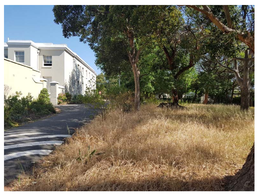
Photo 6: View up north-south linkage route with a sylvan setting to the right and the Main Building to the left