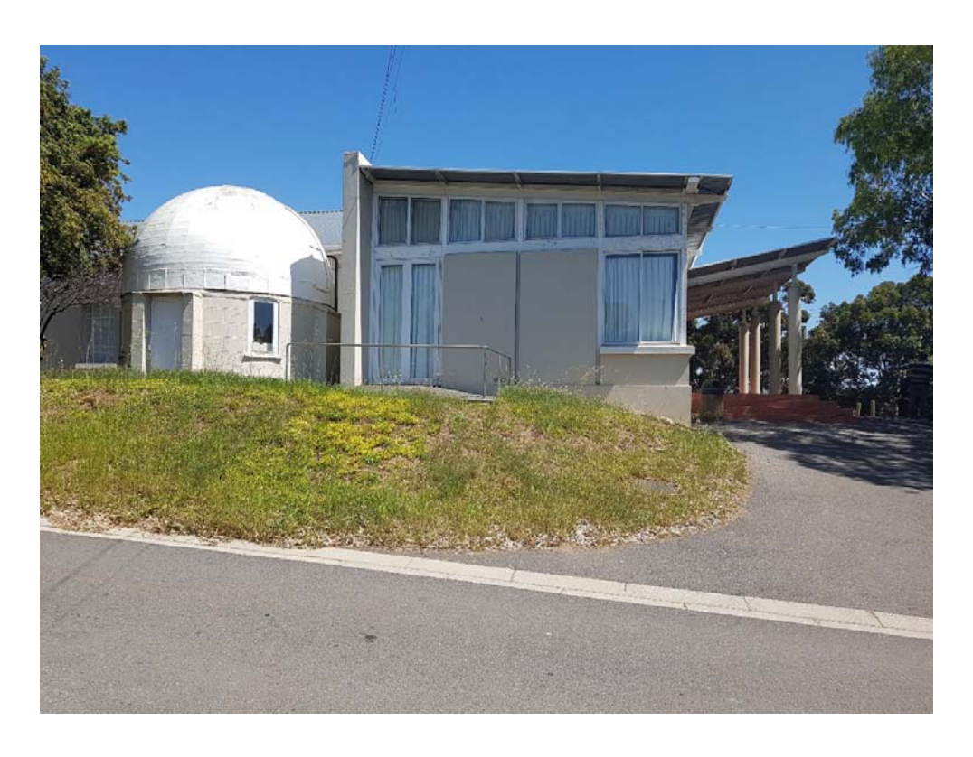
Photo 5: Close up view of Auditorium and Heliograph (east facing elevation)