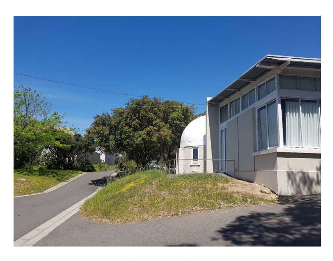
Photo 3: View towards corner for the location of ramp 2 with the Auditorium and Heliograph to the right of the north-south linkage road and Main to the left of the road in the distance