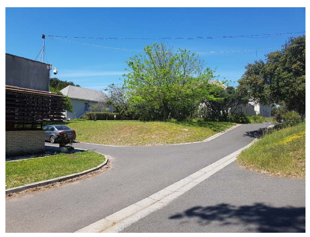
Photo 7: View up north-south linkage road with corner location of ramp 2 in the centre and the corner of the Technical Building to the left