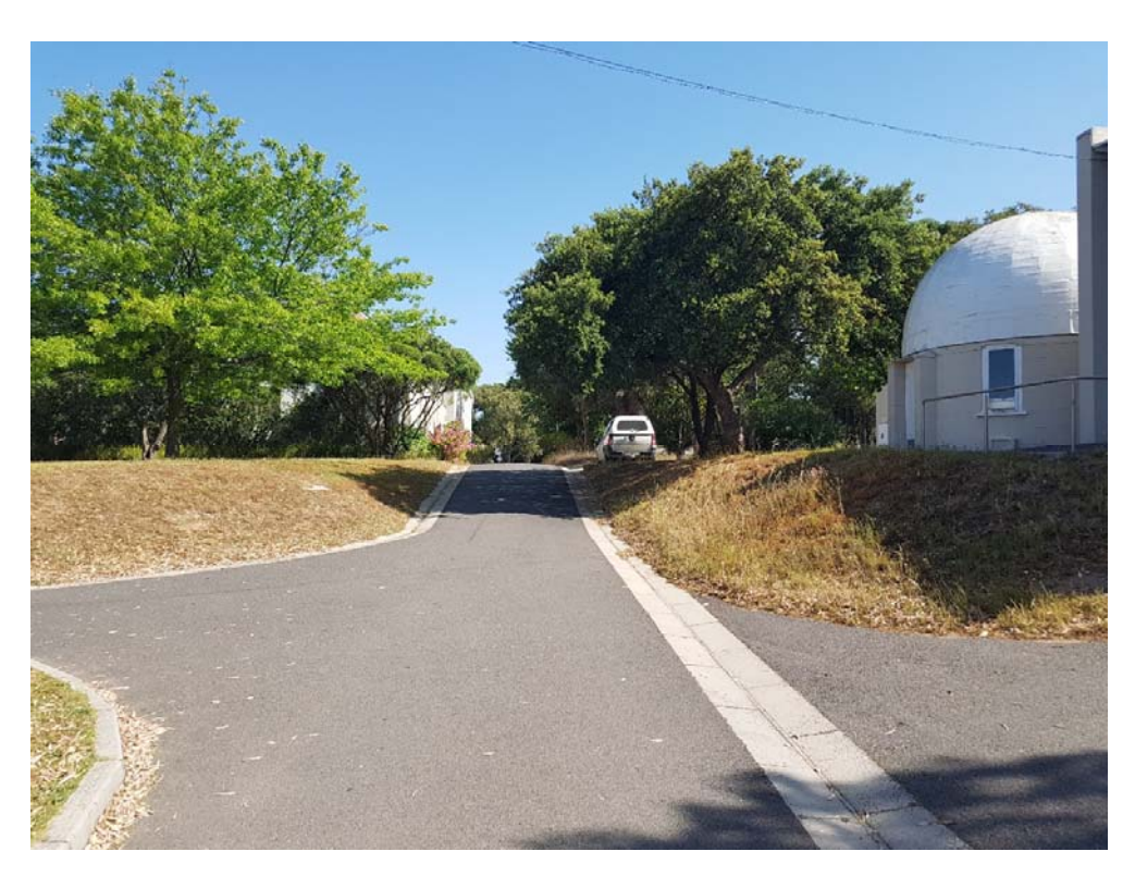
Photo1: View up north-south linkage route showing the location of two ramps; ramp 1 to the left and ramp 2 to the right