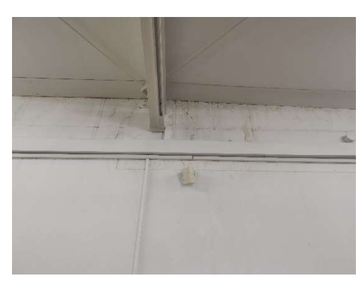
RECOMMENDATIONS FOR UPPER ROOF

I would recommend that this roof replaced shortly as there are signs of water ingress below roof head and along gutter above windows.