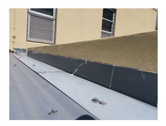
RECOMMENDATIONS Roof appears sound with no sign of water ingress.