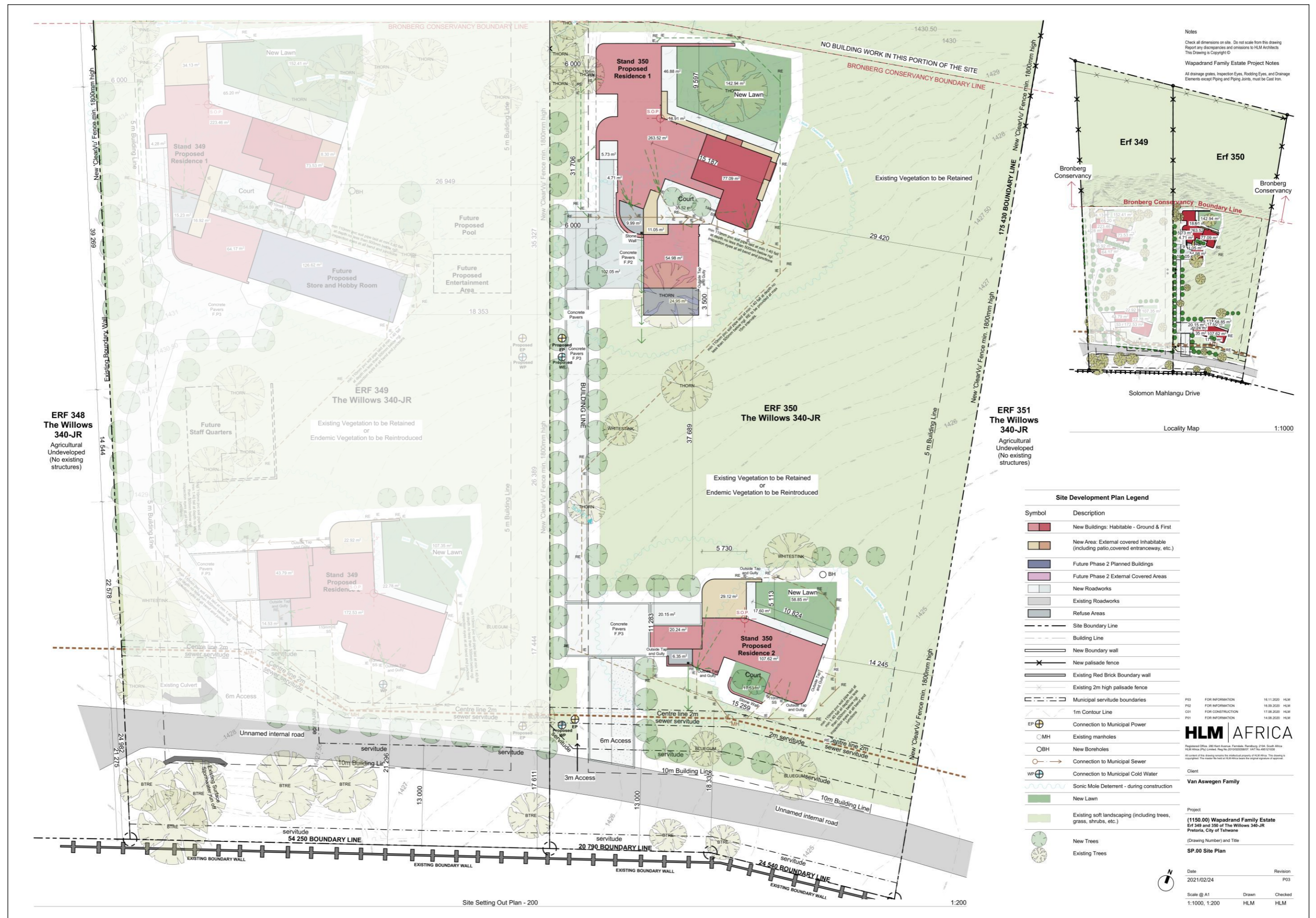
FIGURE 1: PROPOSAL: PREFERRED SITE LAYOUT PLAN of the PROPOSED RESIDENCES to be situated on Portion 350 of the FARM THE WILLOWS 340-JR (City of Tshwane Metropolitan Municipality, Gauteng).