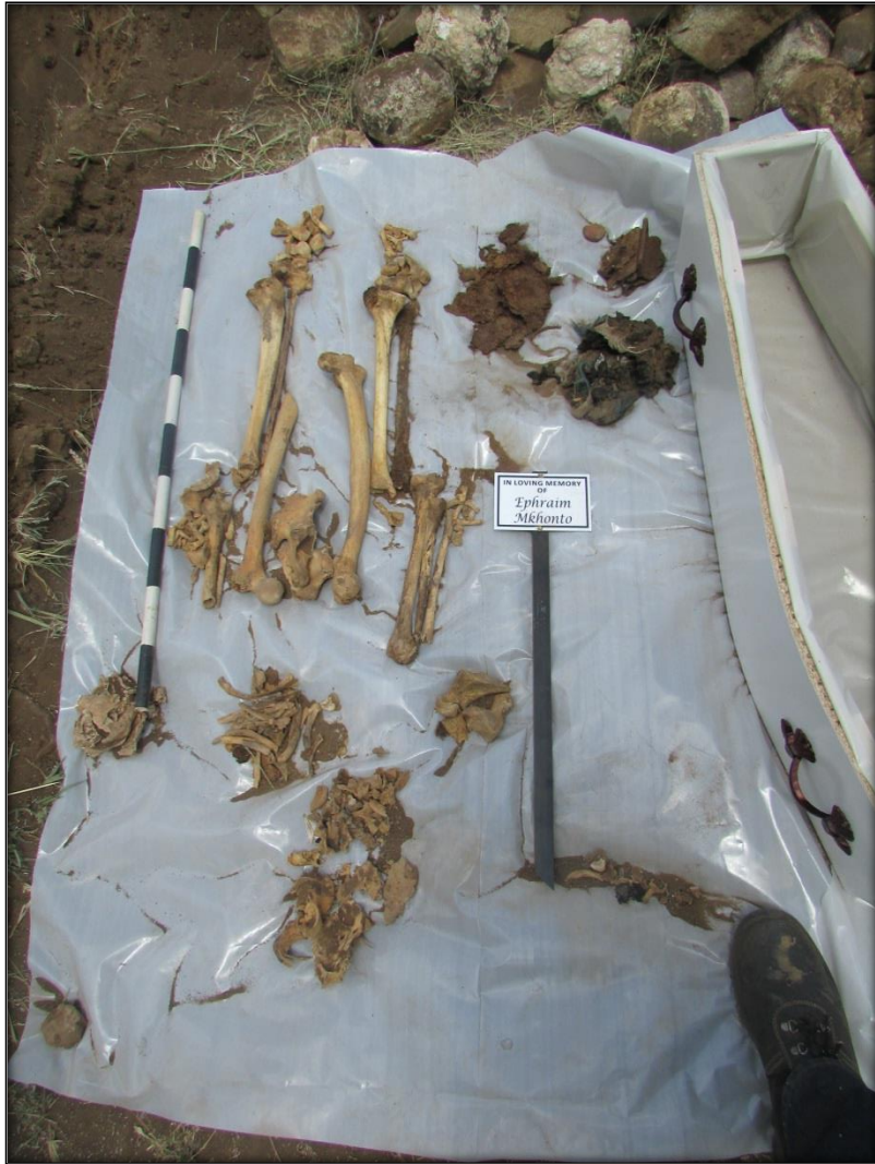
Figure 7: The remains of Mr. Ephraim Mkhonto before being placed in a new coffin.