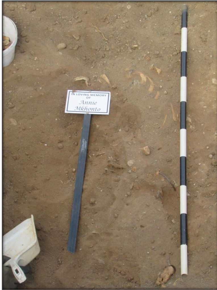
Figure 6: The remains of Me. Annie Mkhonto in situ.