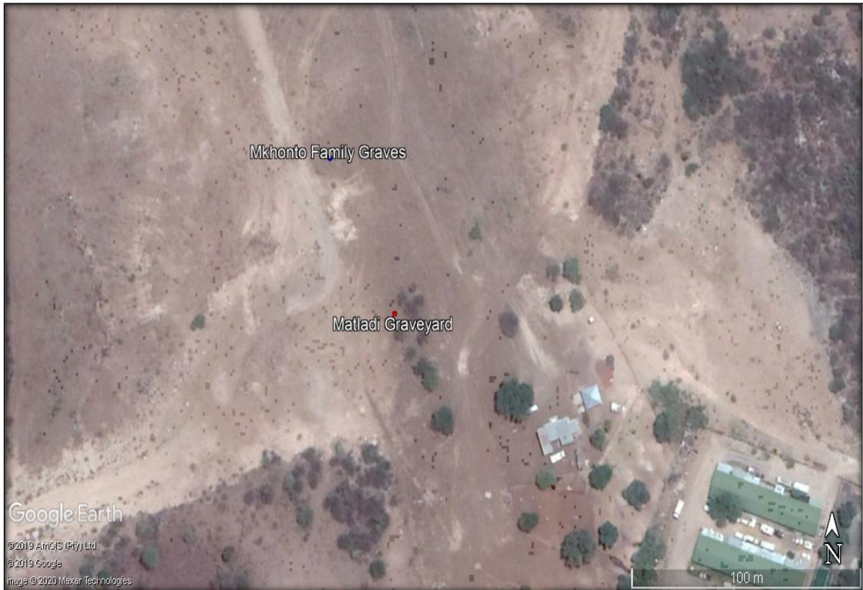
Figure 2: Closer view of the location of the 2 Mkhonto family graves as well as the New Location (Matladi Family Graveyard) where the remains were relocated to (Google Earth 2020).