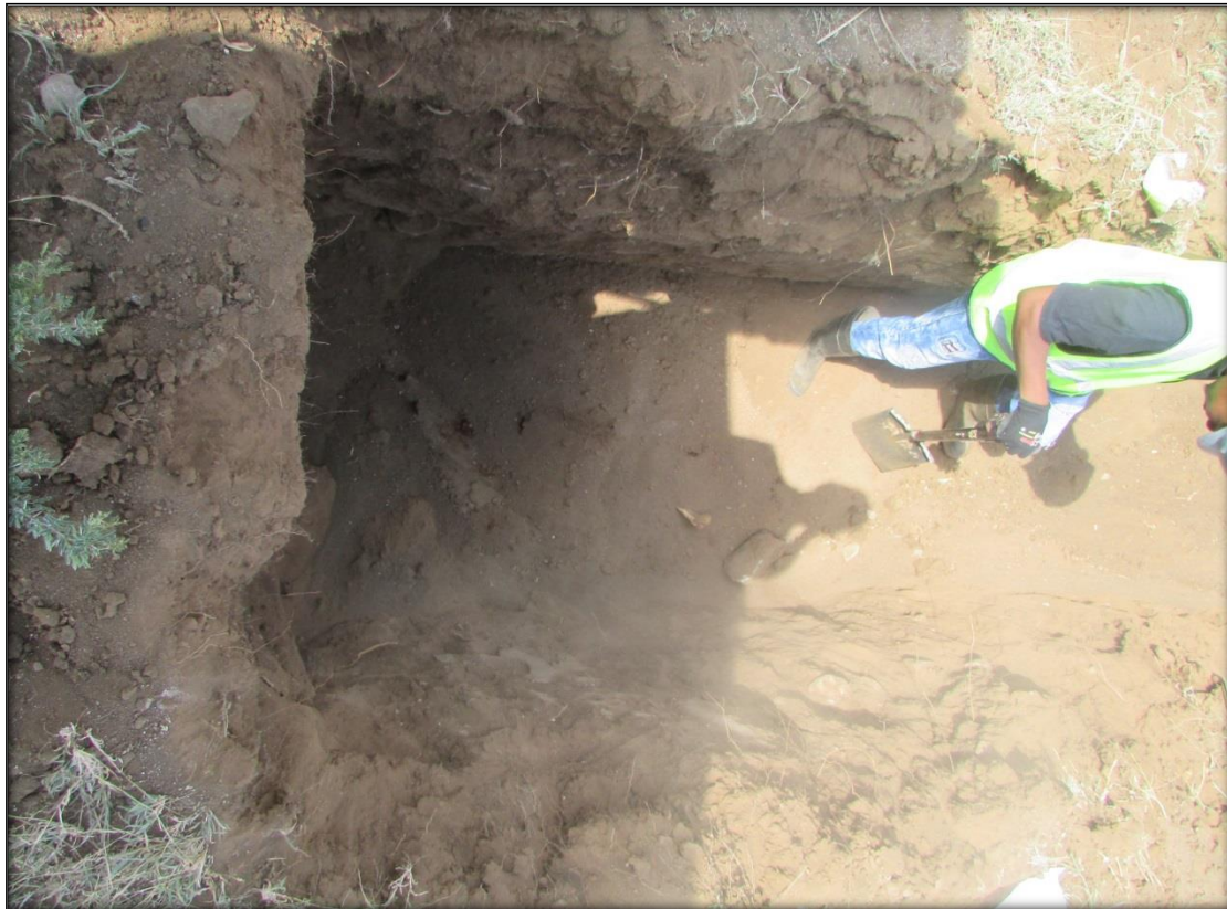
Figure 5: The burial pit of Mr. Ephraim Mkhonto.

As indicated earlier the remains from the two burials were relocated to the Matladi Family Cemetery. New coffins were used for both and the placed in new graves dug for this purpose. Each new grave was packed with stones from the area and new name plaques placed at the head as requested by Mr. Satiene Freddy Mkhawana.