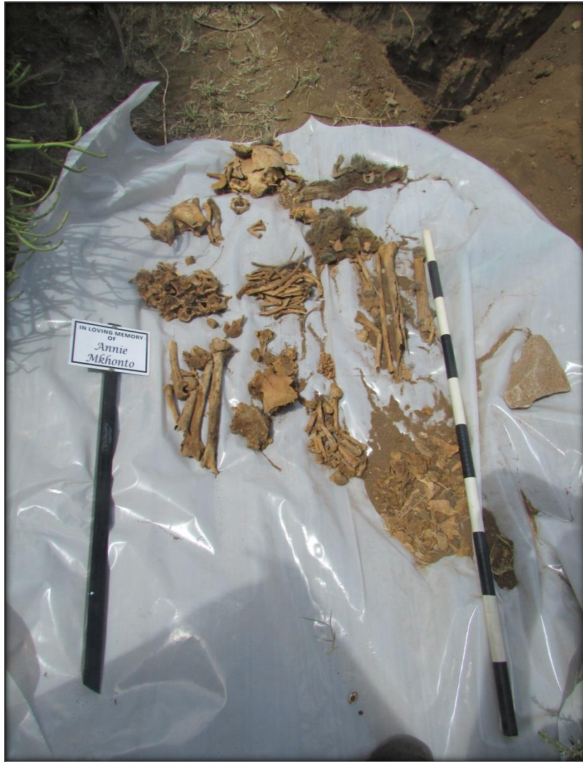
Figure 8: The fragmented remains of Me. Annie Mkhonto.