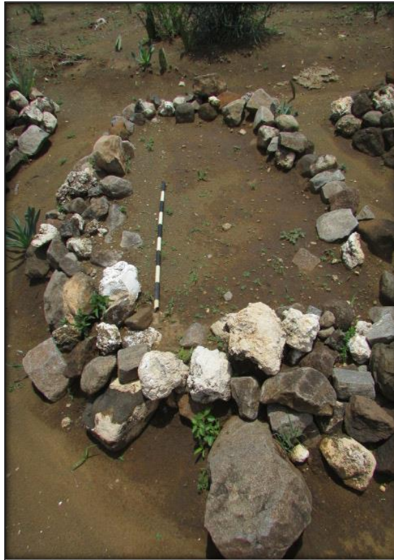
Figure 4: The grave of Me. Annie Mkhonto.