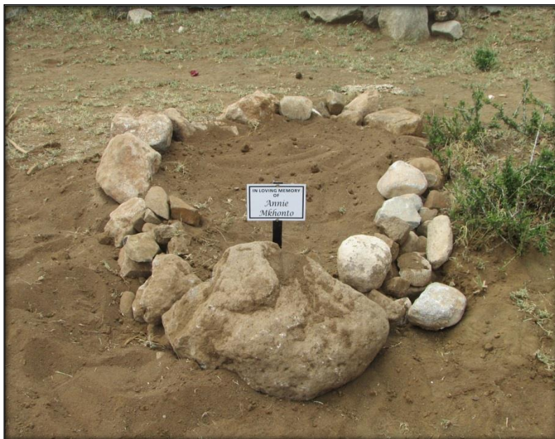
Figure 11: Me. Annie Mkhonto's new grave complete.