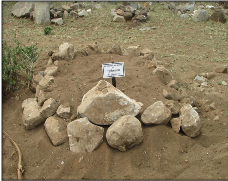
Figure 12: Mr. Ephraim Mkhonto's new grave complete.