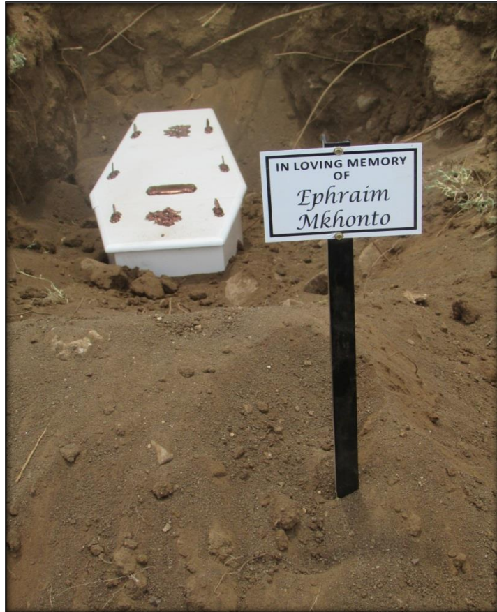
Figure 10: The new grave of Mr. Ephraim Mkhonto.