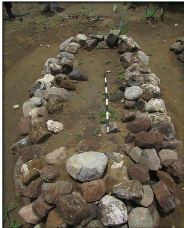
Figure 3: The grave of Mr. Ephraim Mkhonto.