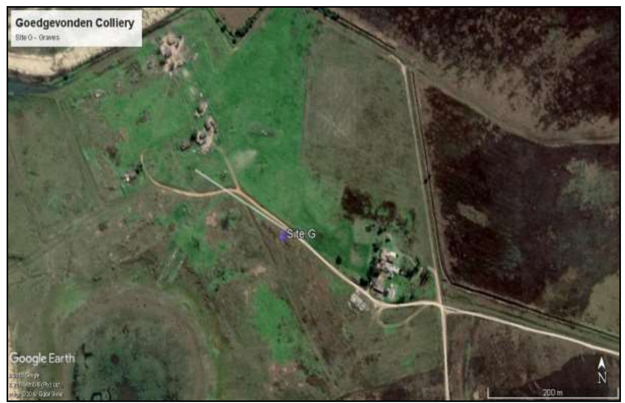
Figure 2: Closer view of the location of Site G Graves (Google Earth 2019).