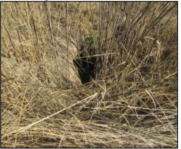
Figure 10: An unknown and sunken-in grave.