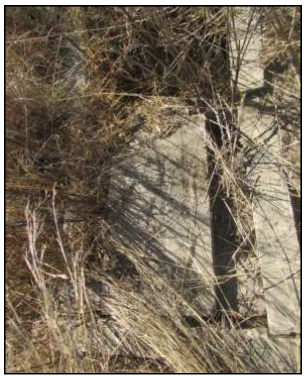
Figure 9: Grave with headstone.