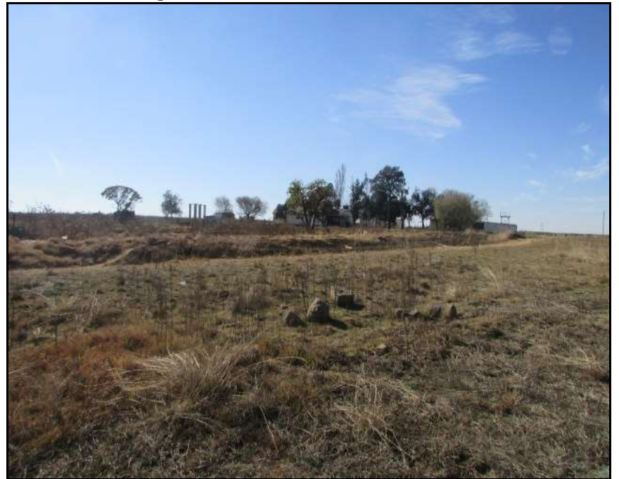
Figure 4: Another view of Site G.