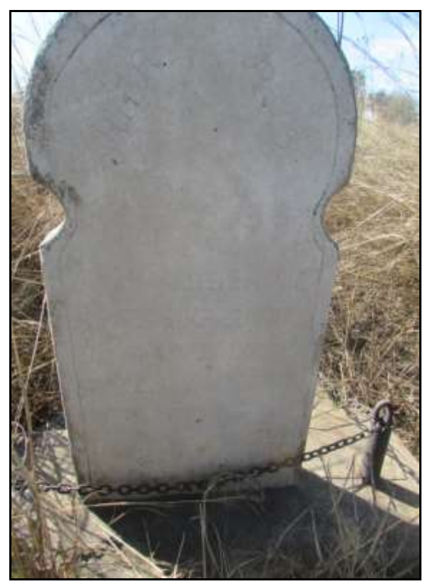
Figure 8: Another grave with headstone on Site G.