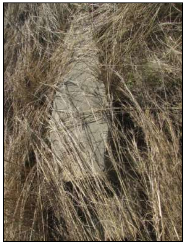
Figure 11: Another grave with fallen over headstone.

APelser Archaeological Consulting cc (APAC), in conjunction with Selala Funerals in Witbank, was approached by Glencore in 2017 already to assess the site for the possibility of exhuming and relocating the graves, but due to external factors out of the mine's control, the physical work did not take place. APAC (together with Selala) has now been appointed finally by Glencore Operations to undertake the required work in terms of the Site G graves.