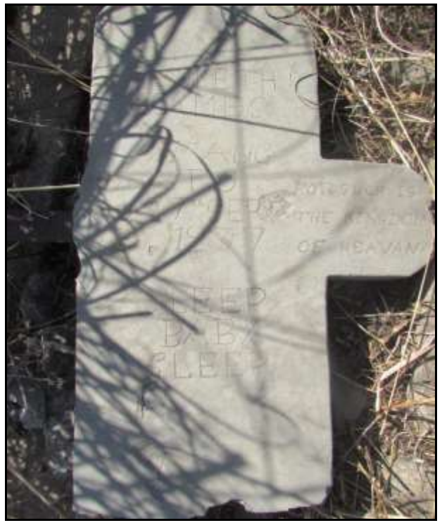
Figure 5: One of the graves on Site G.