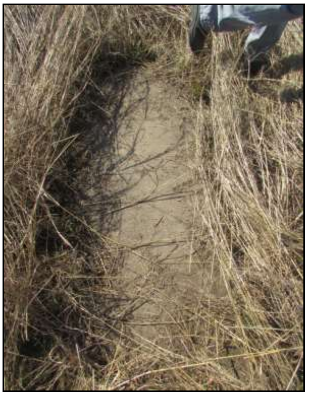
Figure 7: Another grave on the site.