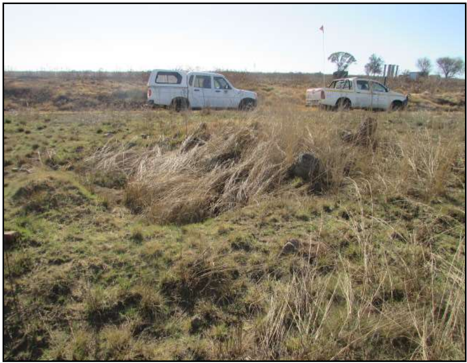
Figure 3: A view of a section of Site G.