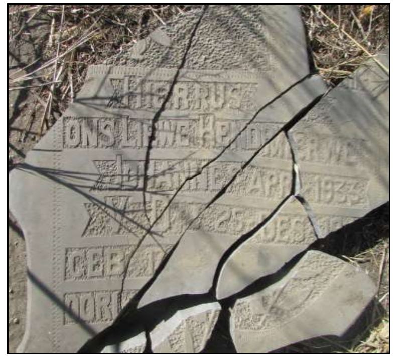
Figure 6: Close-up of another grave's headstone.