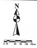
Fig 1 Rivertide Shareblock on Kromme River