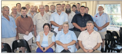
Sommige van die boere en ander rolspelers wat Donderdagnmiddag 'n baie suksesvolle vergadering by die Hangeklub buite Hoedspruit bygewoon het. Die doel van die vergadering was verdere beplanning om 'n formele boerevereniging vir Hoedspruit en omgewing te stig.