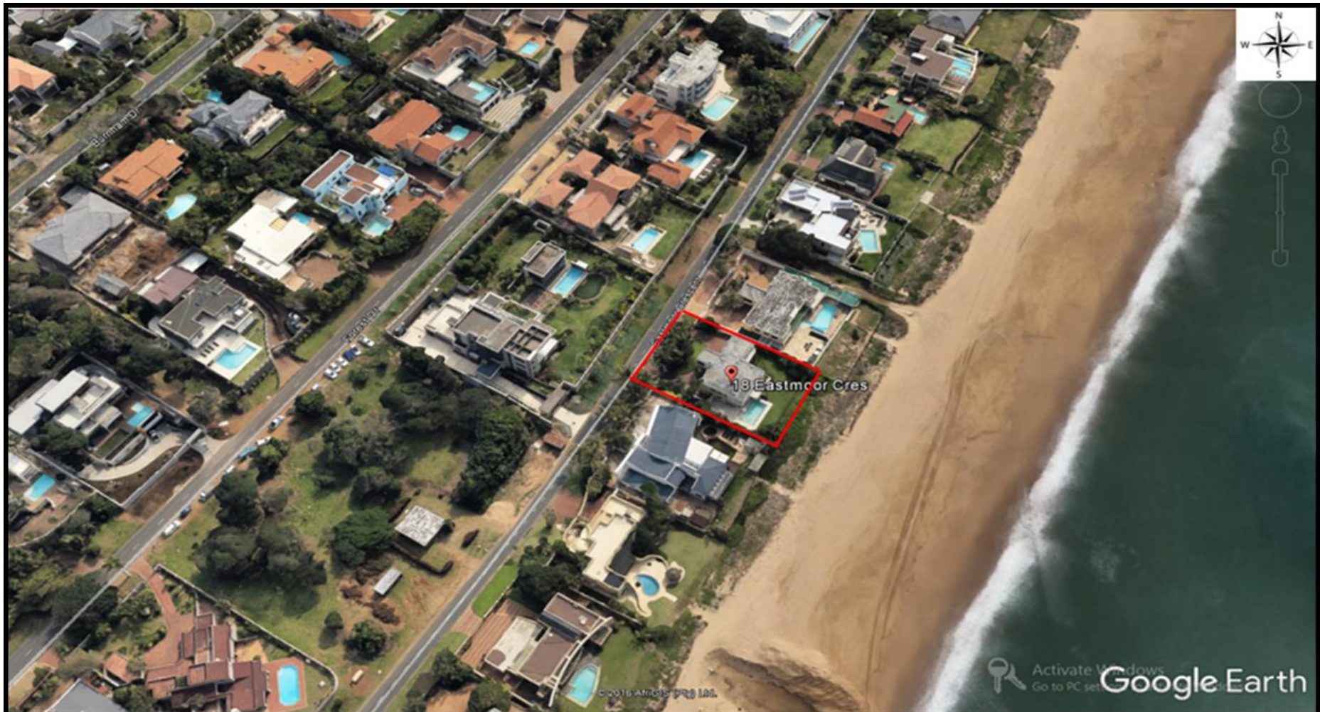
MAP 1: GENERAL LOCALITY MAP OF THE RESIDENTIAL DWELLING SITUATED AT 18 EASTMOOR CRESCENT, LA LUCIA, WITHIN THE ETHEKWINI MUNICIPALITY