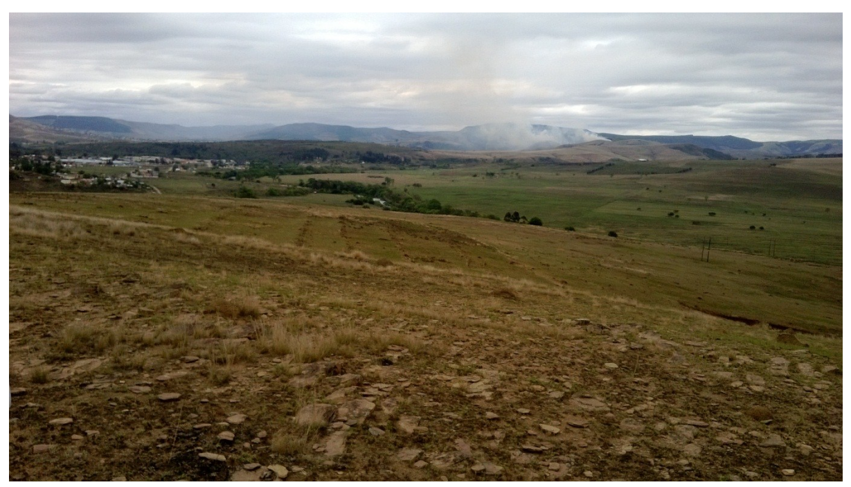
Photo 4: The above photo is showing the North-Easterly direction of Site 8 with a lot of loose shale rock.