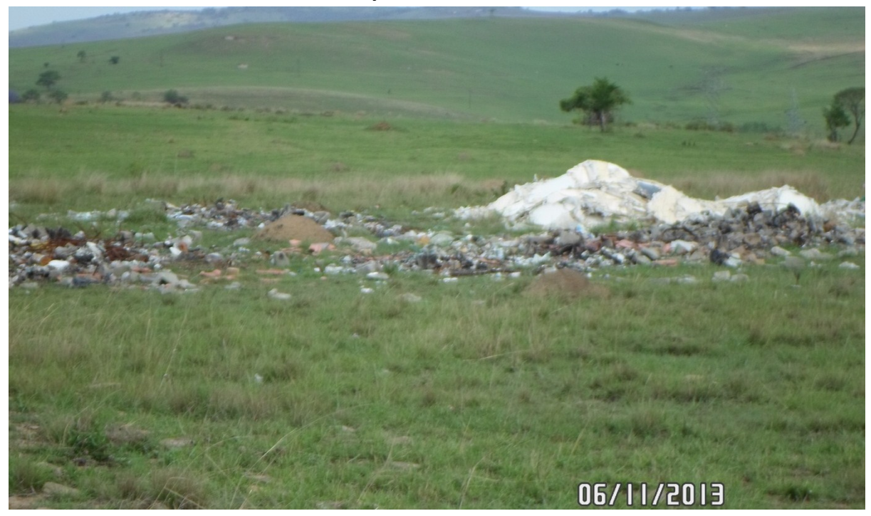
Photo 6: Due to the lack of a proper landfill site there is sporadic illegal dumping within and around Umzimkhulu as shown above.