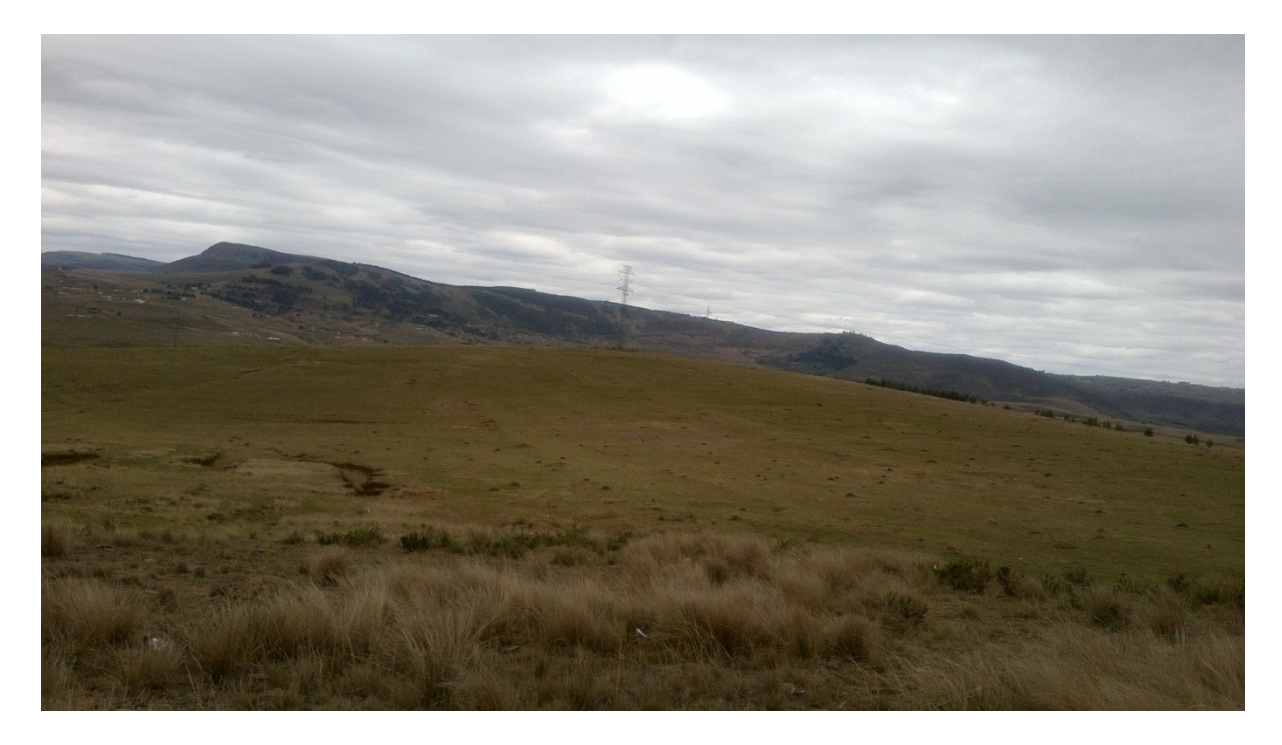
Photo 3: The above photo is showing the Easterly direction of the site. It shows the overview of Site 9 which has Eskom power lines running above it.