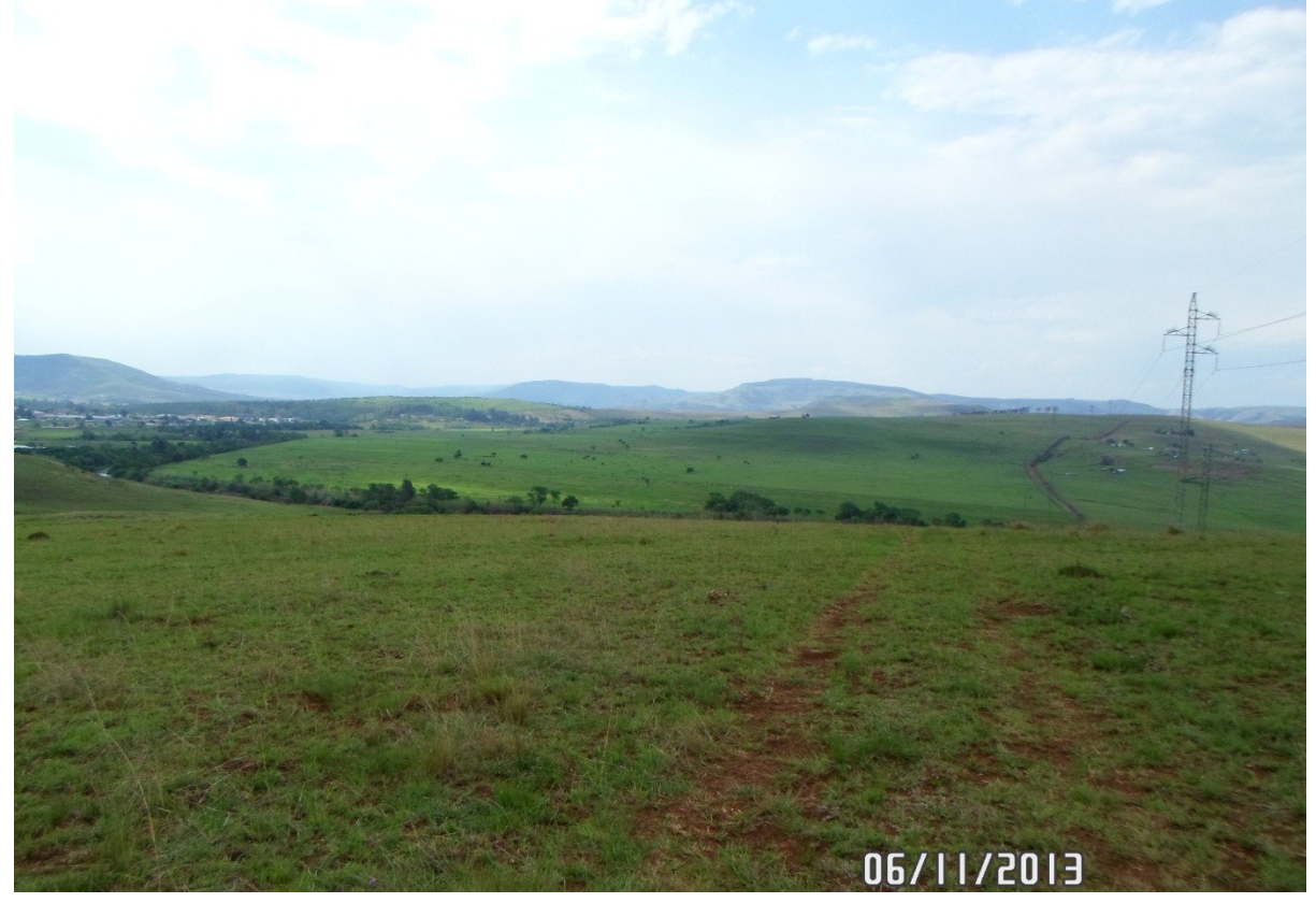
Photo 1: The proposed landfill site will be located in undisturbed open veld as shown above