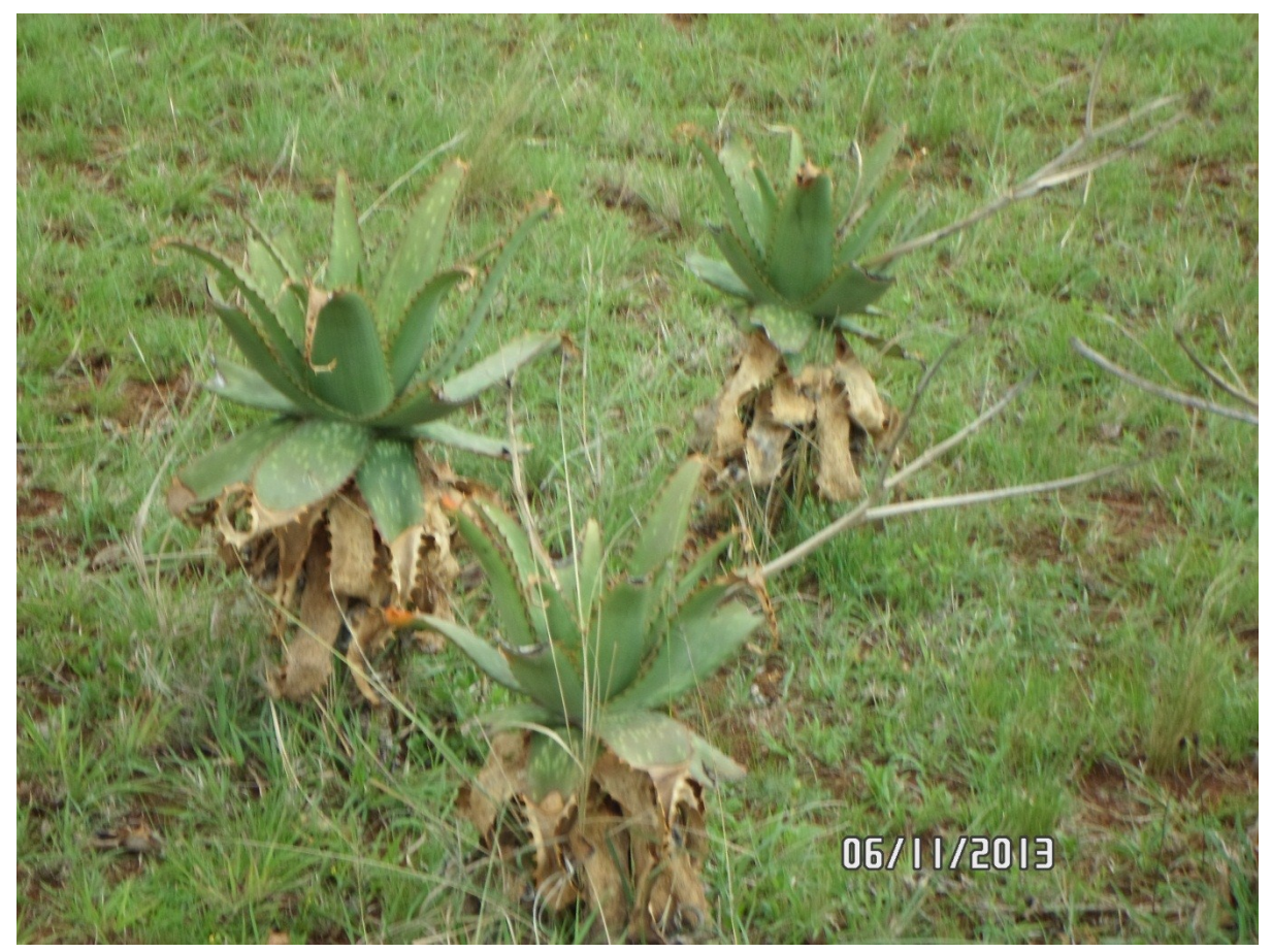
Photo 5: Although the sites are clear in terms of shrubs and tree however there were some Aloe identified within the vicinity of the sites.