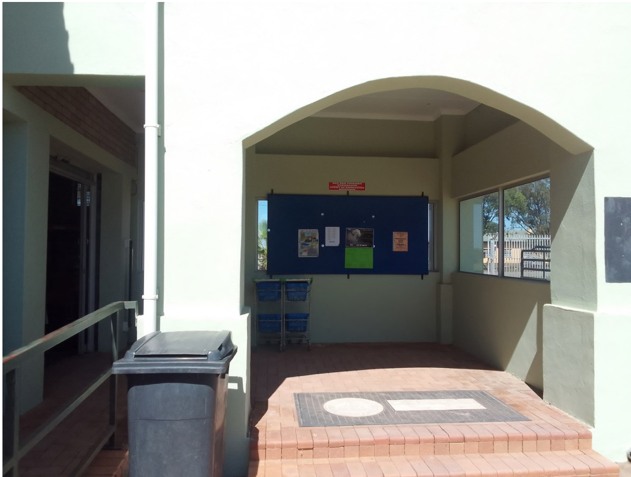
SSK Agriland Notice Board, Hoop Street, Aberdeen