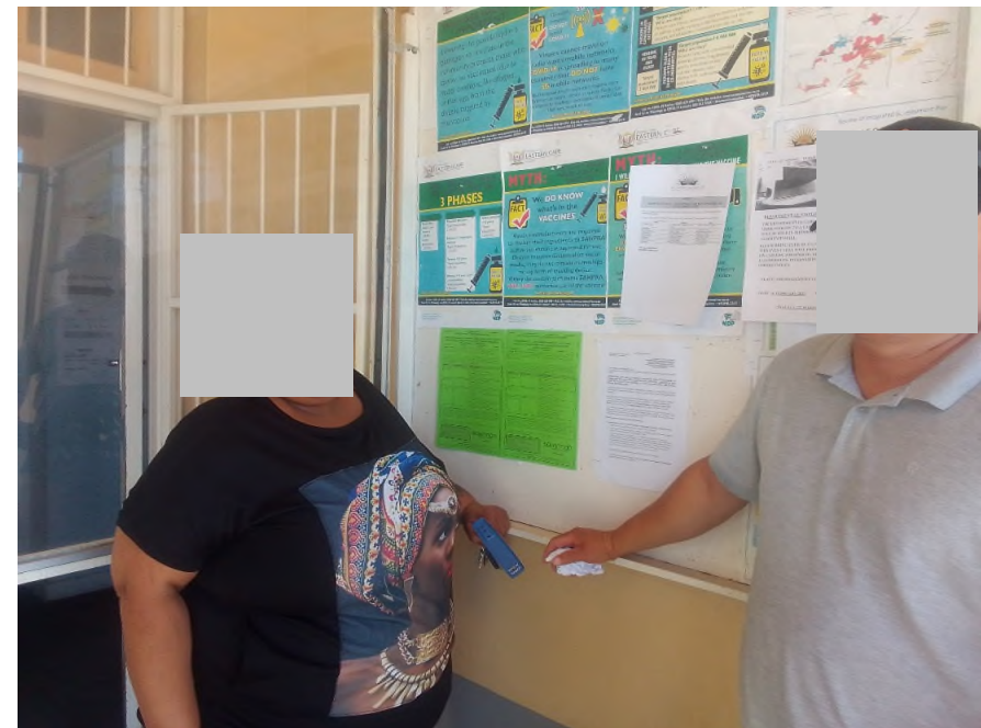
Satellite Offices of Dr Beyers Naudé Local Municipality, C/o Meintjies & Voortrekker Streets, Aberdeen