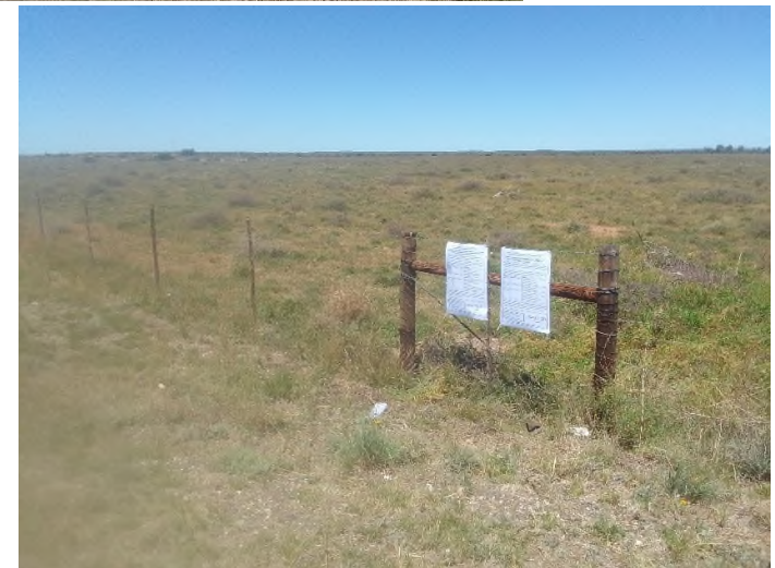
Site Notice 1: Entrance to the northern portions of Aberdeen Wind Farm 1, Aberdeen Wind Farm 2 and Aberdeen Wind Farm 3 off the R61 Co-ordinates: 32°29'24.35"S / 23°43'35.68"E