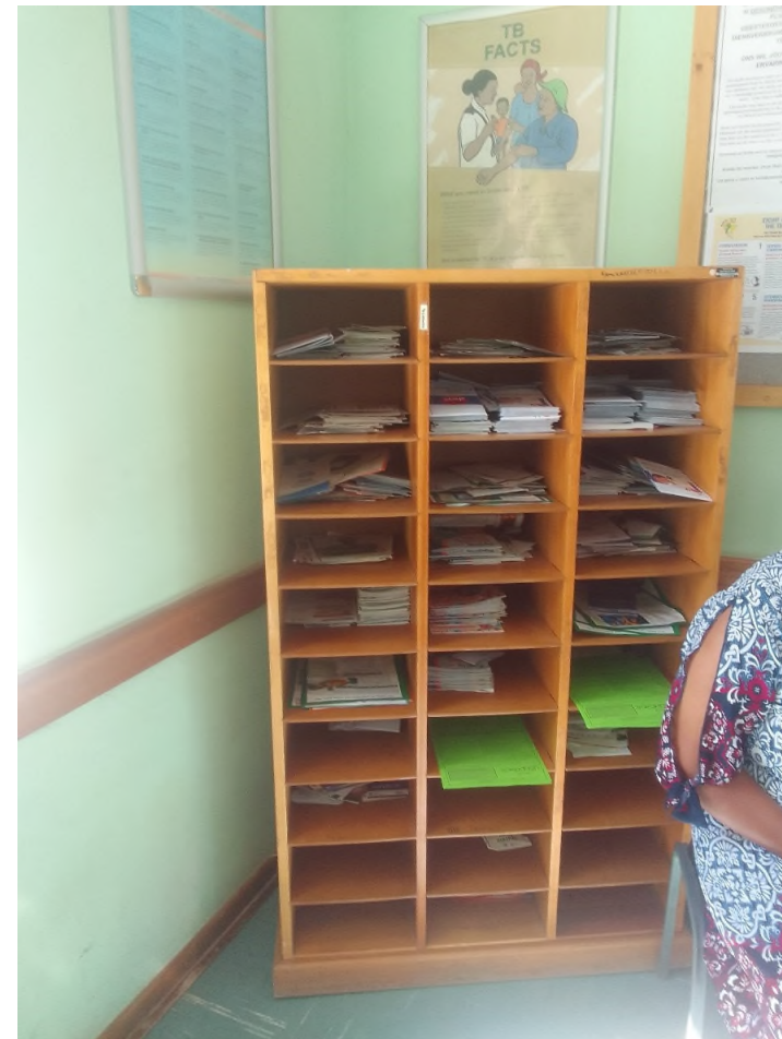
Masakhane Municipality Clinic