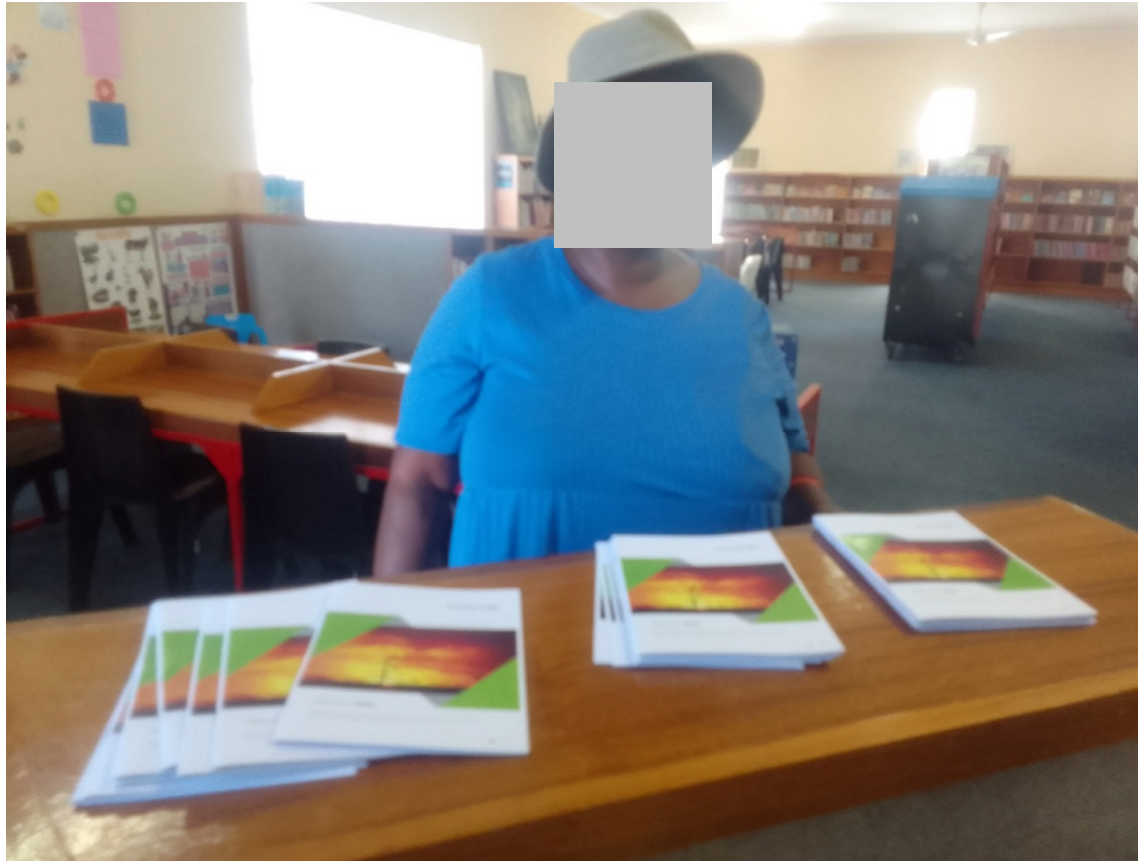
Aberdeen Public Library, Voortrekker Street, Aberdeen