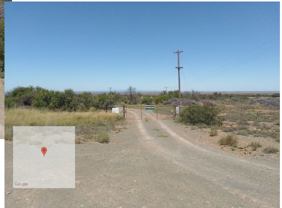
Site Notice 4: Entrance to the southern portions of Aberdeen Wind Farm 1, Aberdeen Wind Farm 2 and Aberdeen Wind Farm 3 off the N9 Co-ordinates: 32°24'52.83"S / 23°48'34.42"E