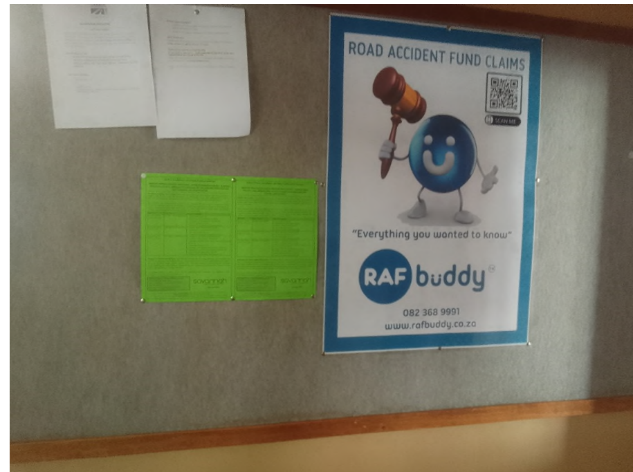
Notice Board, Aberdeen Public Library