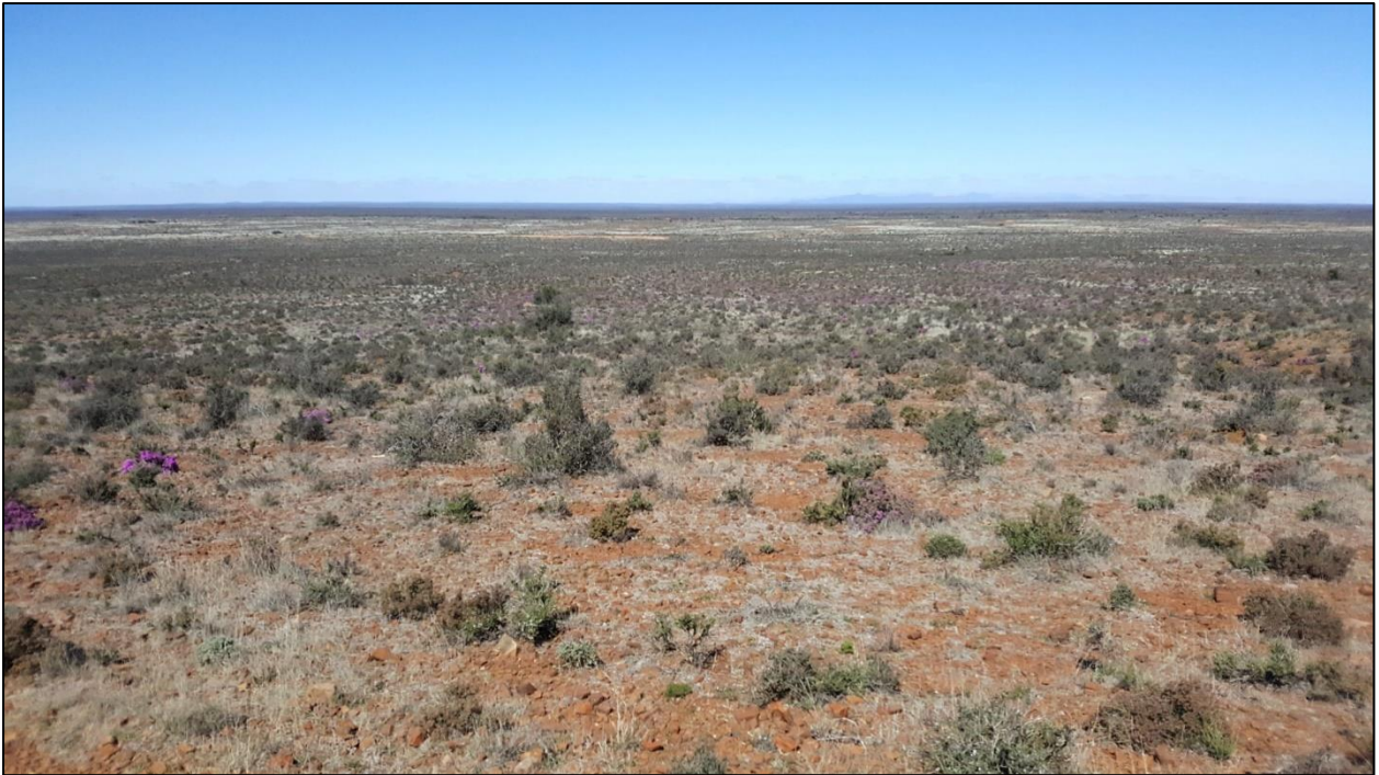
Figure 3. Looking out over the Aberdeen Wind Facility 1 site from one of the low ridges that occur within the site, showing the overall homogenous nature of the site.