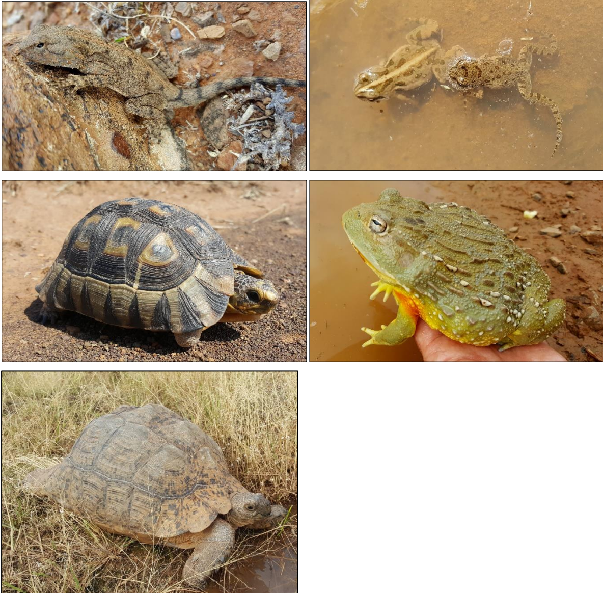
Figure 4. Reptiles and amphibians observed at the site include from top right, Cammon Caco, Southern Rock Agama, Giant Bullfrog, Angulate Tortoise, Leopard Tortoise.