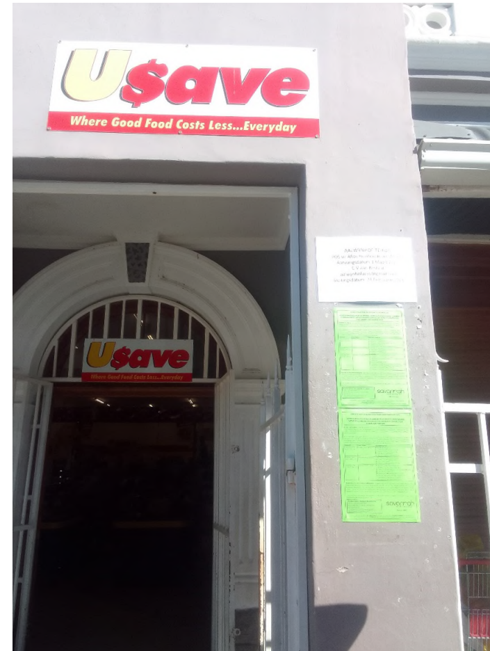
U Save Supermarket, 11 Voortrekker Street, Aberdeen