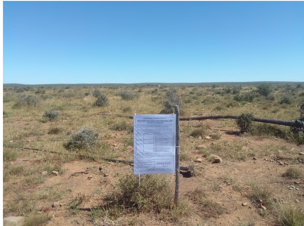
Site Notice 2: Placed at the fence of Portion 0 of the farm Doorn Poort 93 Co-ordinates: 32°30'28.66"S / 23°51'37.04"E