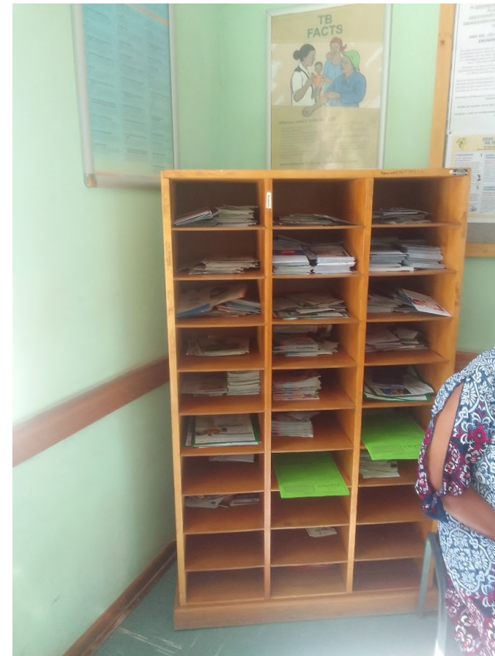
Masakhane Municipality Clinic