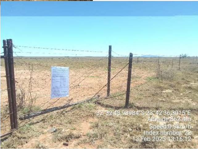
Site Notice 3: Placed at eastern entrance gate to Koppieskraal 157