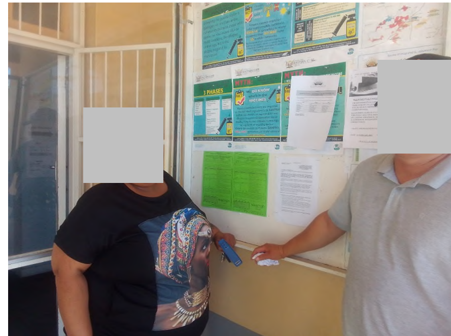
Satellite Offices of Dr Beyers Naudé Local Municipality, C/o Meintjies & Voortrekker Streets, Aberdeen