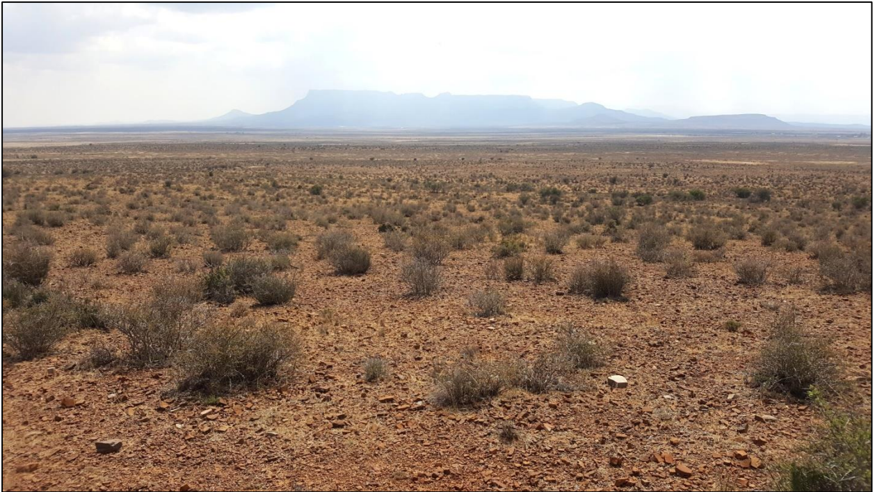
Figure 3. Looking north out over the Aberdeen Wind Facility 3 site from the low ridges that occurs in the north of the site, showing the overall homogenous nature of the project area.