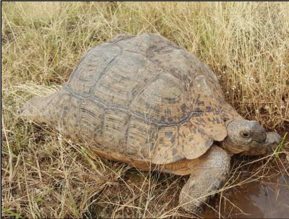
Figure 4. Reptiles and amphibians observed at the site include from top right, Cammon Caco, Southern Rock Agama, Giant Bullfrog, Angulate Tortoise, Leopard Tortoise.