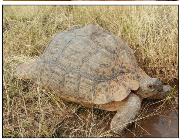
Figure 4. Reptiles and amphibians observed at the site include from top right, Cammon Caco, Southern Rock Agama, Giant Bullfrog, Angulate Tortoise, Leopard Tortoise.