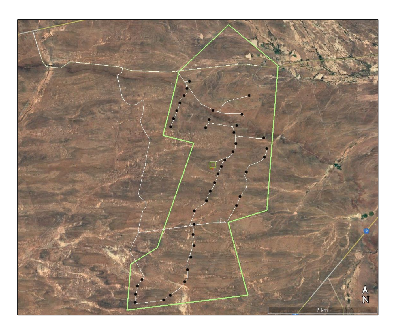
Figure 1. Satellite image showing the location and layout of the proposed Aberdeen Wind Facility 3, with turbine locations, turbine access roads, substation, battery storage area and laydown area.