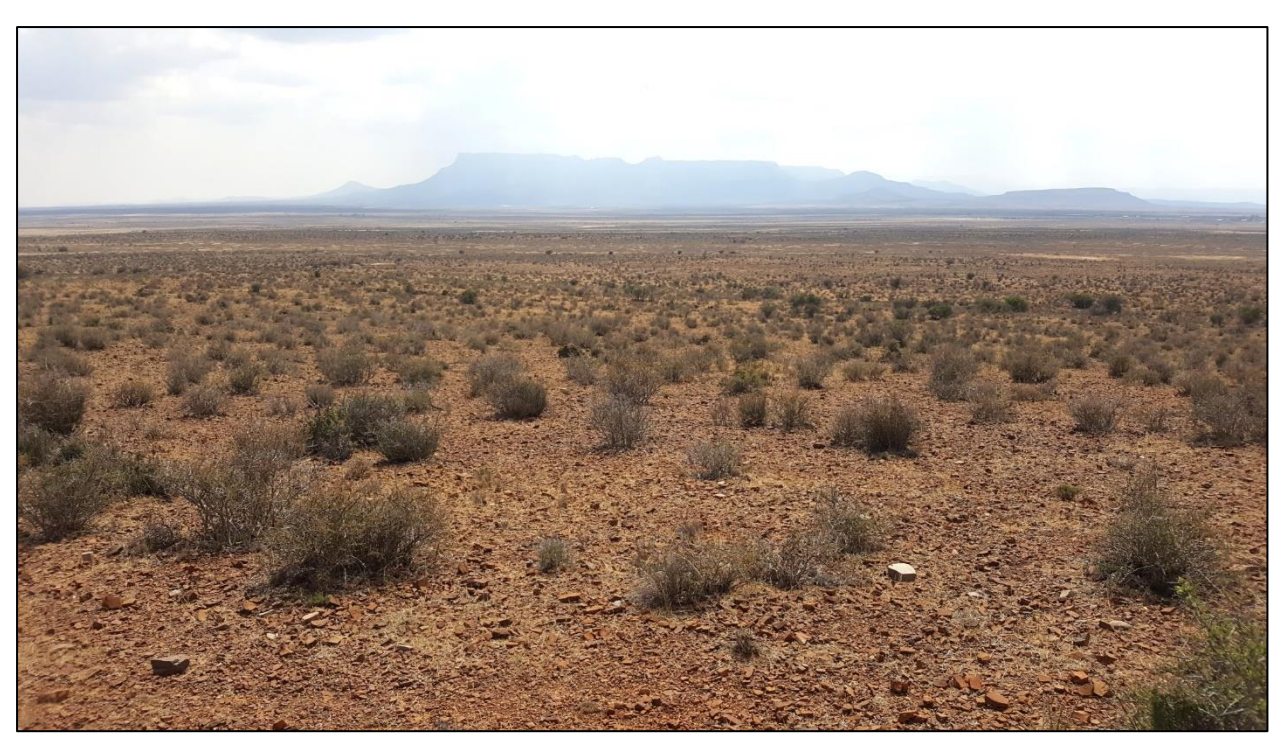
Figure 3. Looking north out over the Aberdeen Wind Facility 3 site from the low ridges that occurs in the north of the site, showing the overall homogenous nature of the project area.