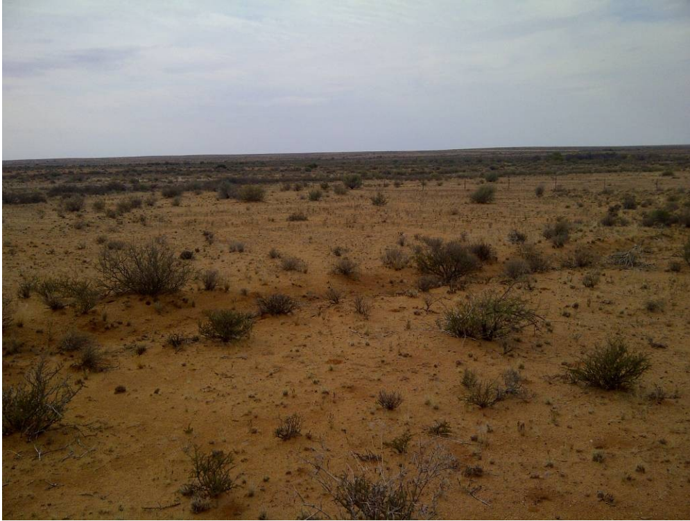
Photo 7: Southwest corner of proposed development area. Facing south at 29° 26' 52"S and 20° 49' 01"E.