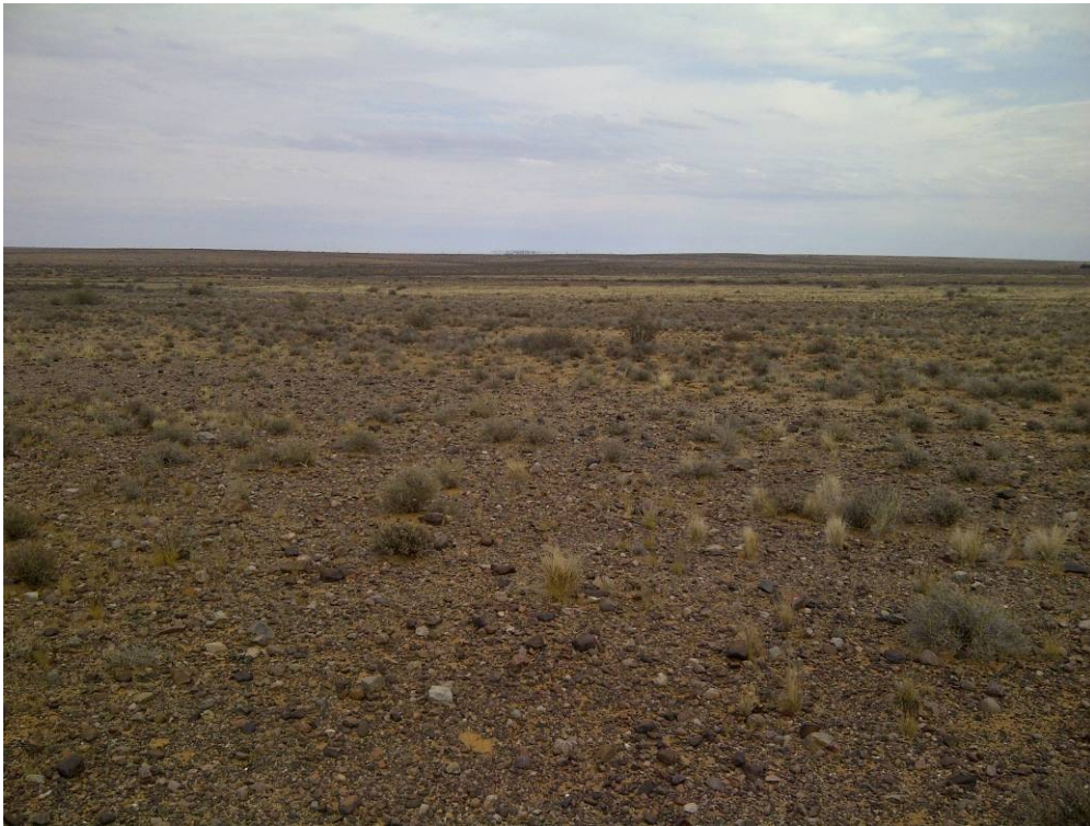
Photo 8: Southwest corner of proposed development area. Facing west at 29° 26' 52"S and 20° 49' 01"E.