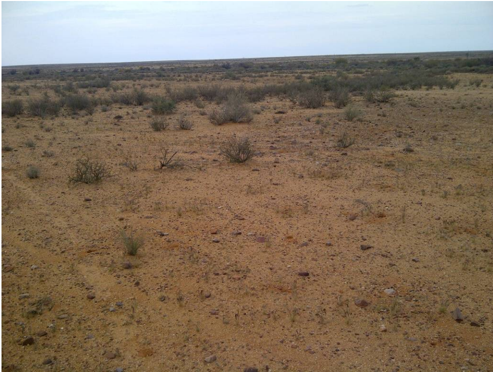
Photo 3: Southeast corner of proposed development area. Facing east at 29° 27' 00"S and 20° 50' 24"E.