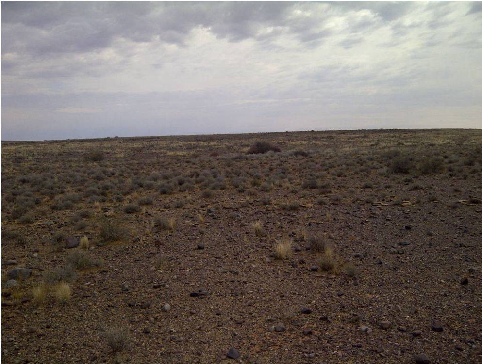
Photo 9: Centre of development area. Facing west northwest at 29° 26' 44"S and 20° 50' 19"E