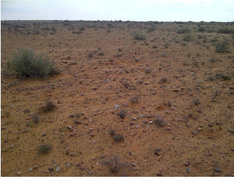
Photo 1: Southeast corner of proposed development area. Facing north at 29° 27' 00"S and 20° 50' 24"E.