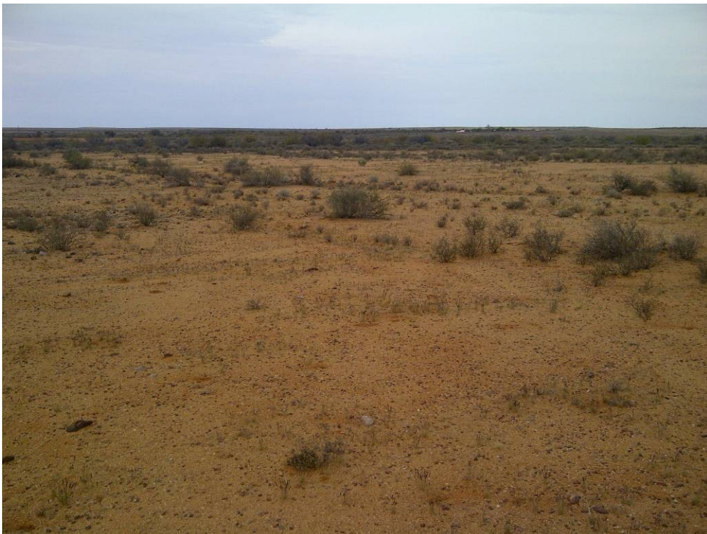
Photo 4: Southeast corner of proposed development area. Facing southeast at 29° 27' 00"S and 20° 50' 24"E.