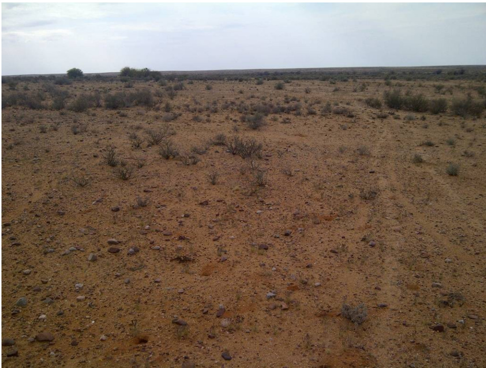
Photo 2: Southeast corner of proposed development area. Facing northeast at 29° 27' 00"S and 20° 50' 24"E.