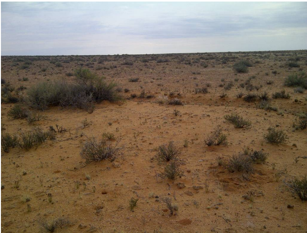
Photo 10: Centre of development area. Facing east northeast at 29° 26' 44"S and 20° 50' 19"E