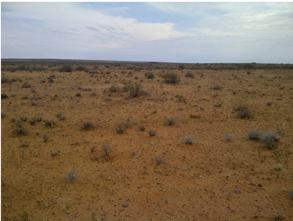
Photo 6: Southeast corner of proposed development area. Facing west at 29° 27' 00"S and 20° 50' 24"E.