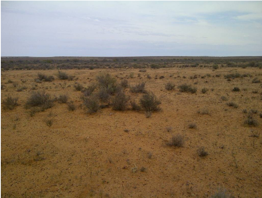
Photo 5: Southeast corner of proposed development area. Facing south at 29° 27' 00"S and 20° 50' 24"E.