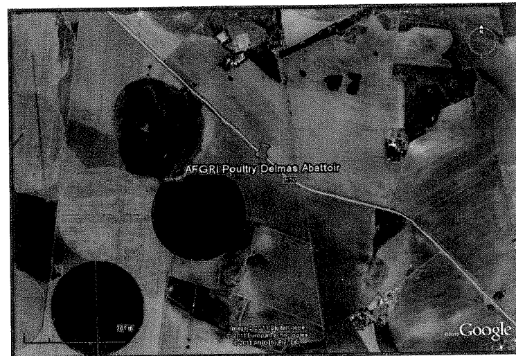
Figure 2: Location of the proposed expansion project.