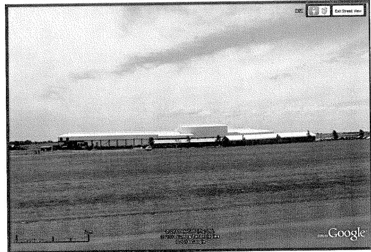
Figure 1: The AFGRI Poultry Delmas Abattoir.

The development will add approximately 1 500m 2 to the current development footprint of the abattoir facility.