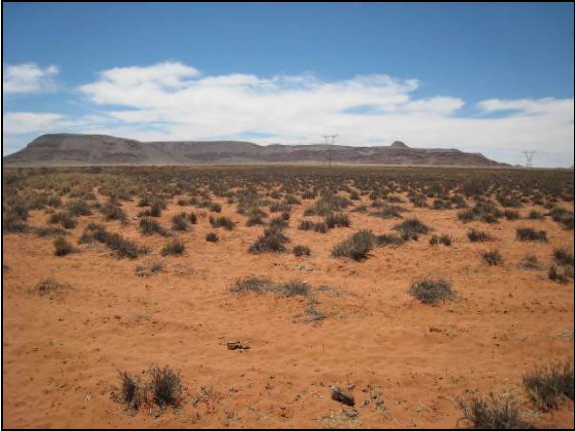
Figure 2 Natural vegetation in study area