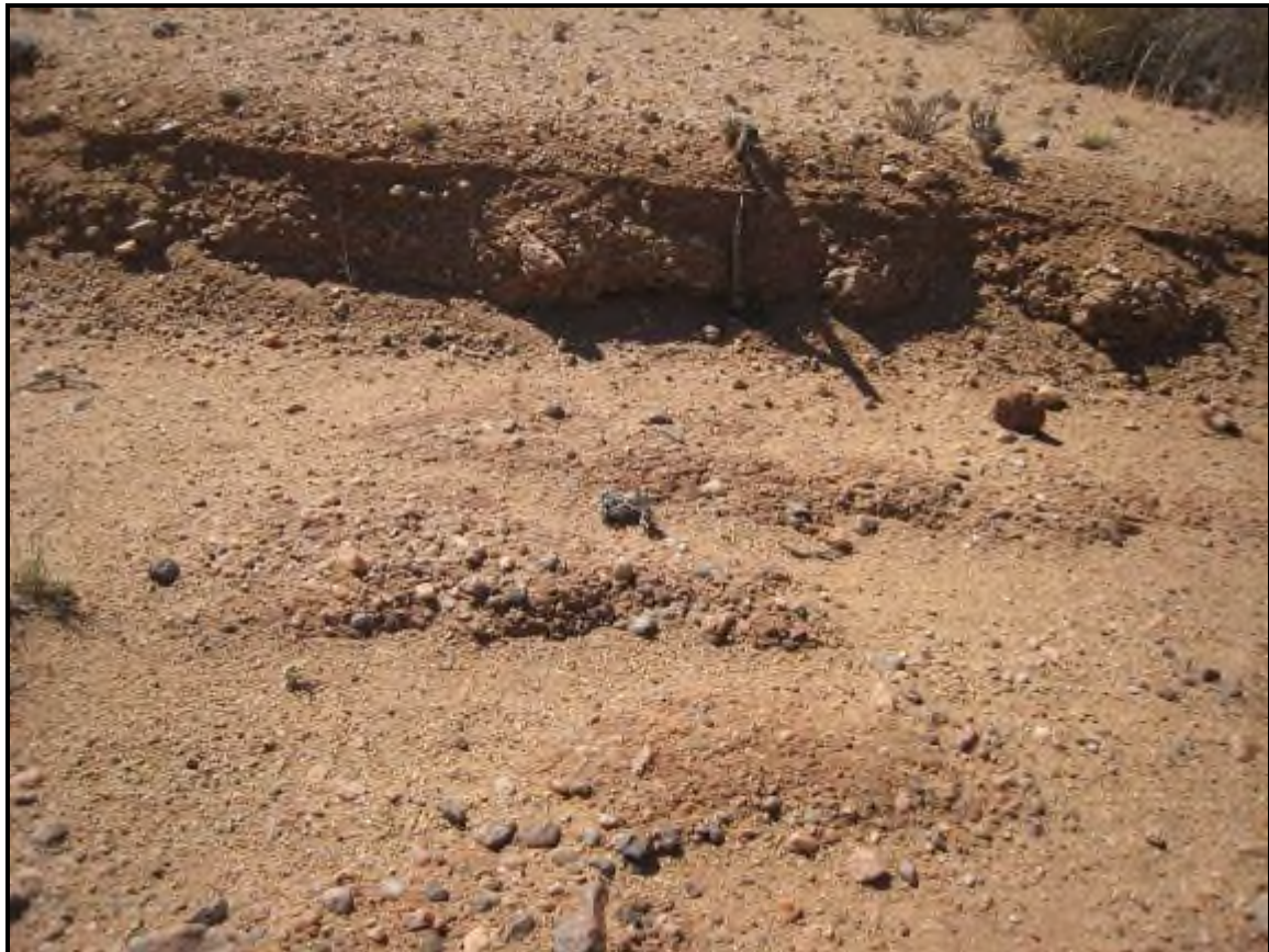
Figure 5 Cemented dorbank layer exposed in soil profile

As evident from Figure 4, Aggeneys 2 lies within land type Af26, which consists largely of deep, sandy soils. However, possibly due to the location at the foot of the rocky hills to the north, the field investigation confirmed the presence of much shallower soils on the site in question, with soils classified as belonging to the Garies (orthic topsoil on red apedal subsoil on cemented dorbank) and Knersvlakte (orthic topsoil on cemented dorbank) forms, with depths of less than 450 mm. Some outcrops of gravel and dorbank were also observed at the surface, as shown in Figure 5.