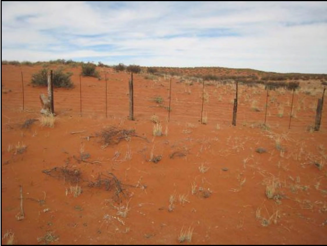
Figure 3 Dune landscape in study area