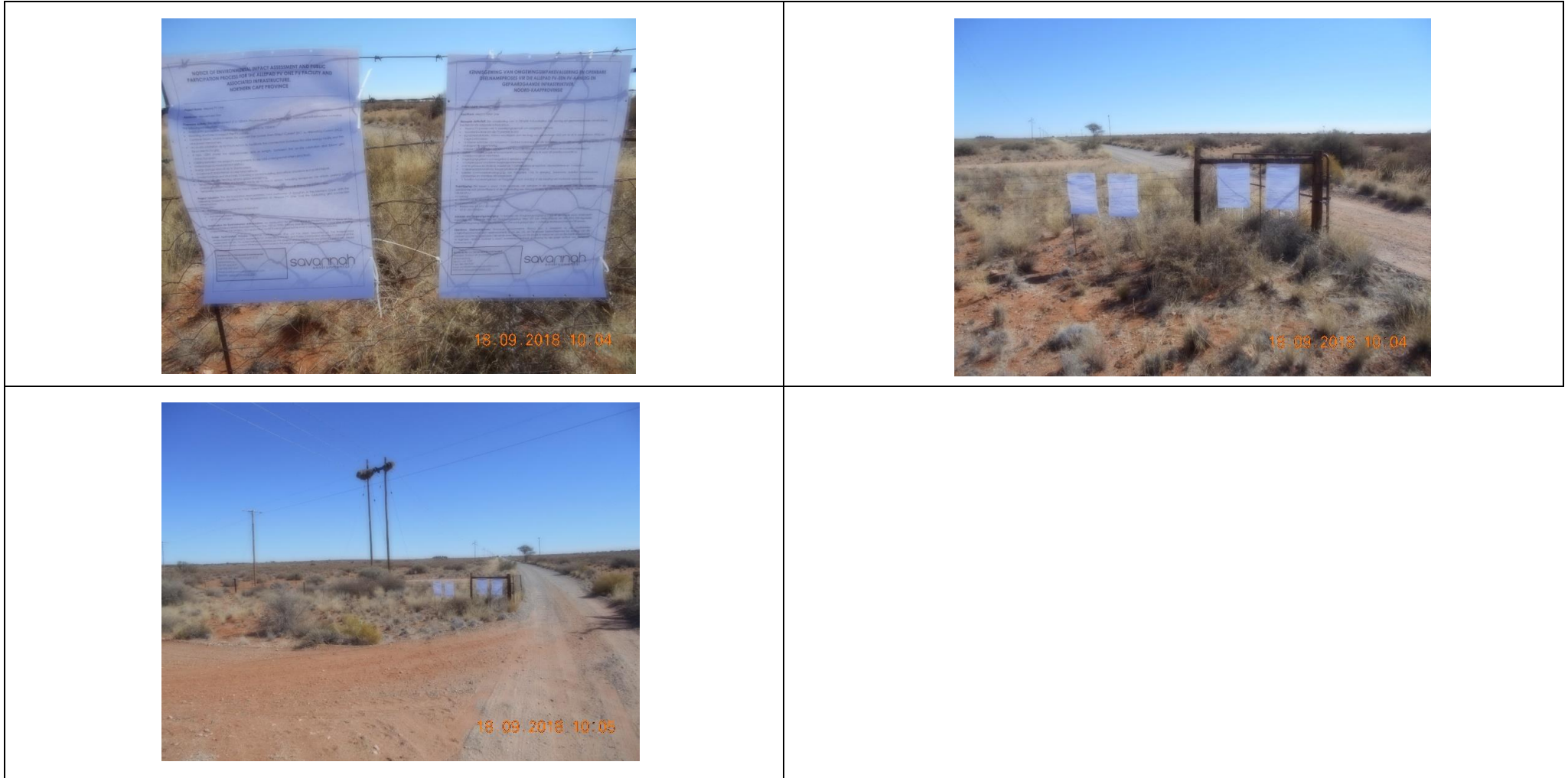
Figure 1: Photos of site notices on the boundary of the Remaining Extent of Erf 5315 Upington (28° 24' 19.58" S and 21° 08' 07.85" E).

Remaining Extent of Erf 5315 Upington – Allepad PV One and Grid Connection Infrastructure