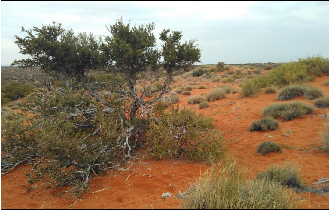
Figure 2. Linear dune crest of the Gordonia Duneveld, within the western half of the study area, with a Boscia foetida tree in the foreground.