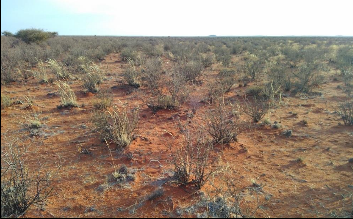
Figure 5. Sandy plains of the Gordonia Duneveld along the southern boundary of the study area, showing stands of Rhigozum trichotomum shrubs.