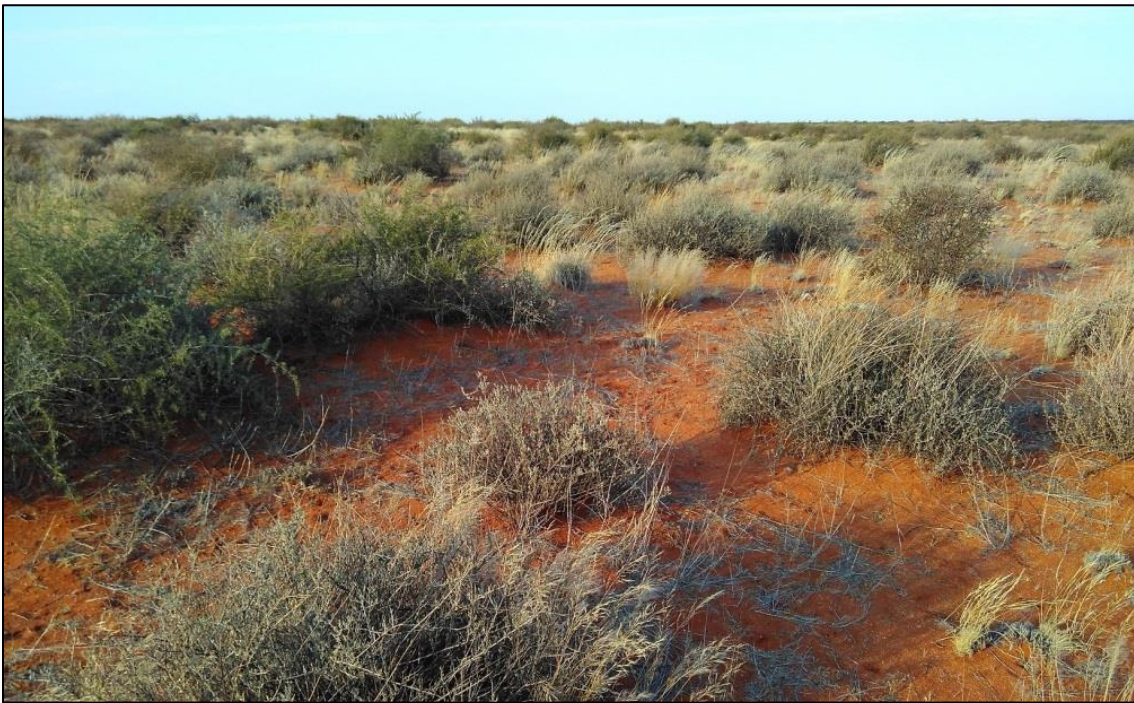
Figure 6. Sandy plains of the Gordonia Duneveld dominated by a mix of shrubs and grasses.