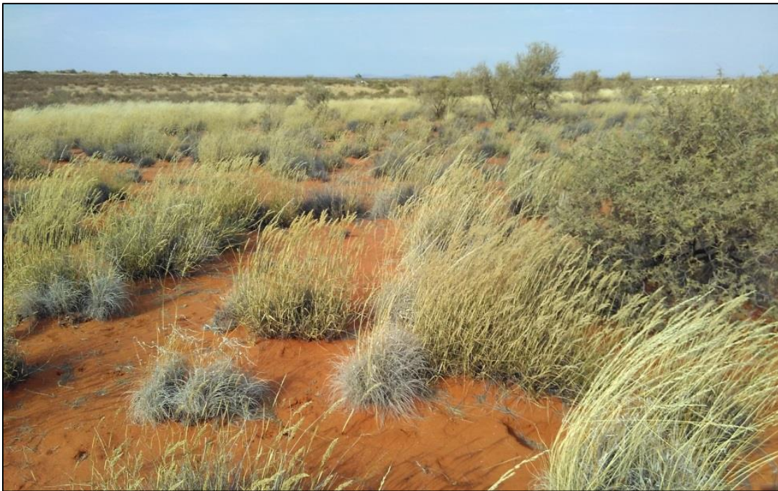
Figure 4. Linear dune crest of the Gordonia Duneveld, within the western half of the study area, with Acacia haematoxylon trees.