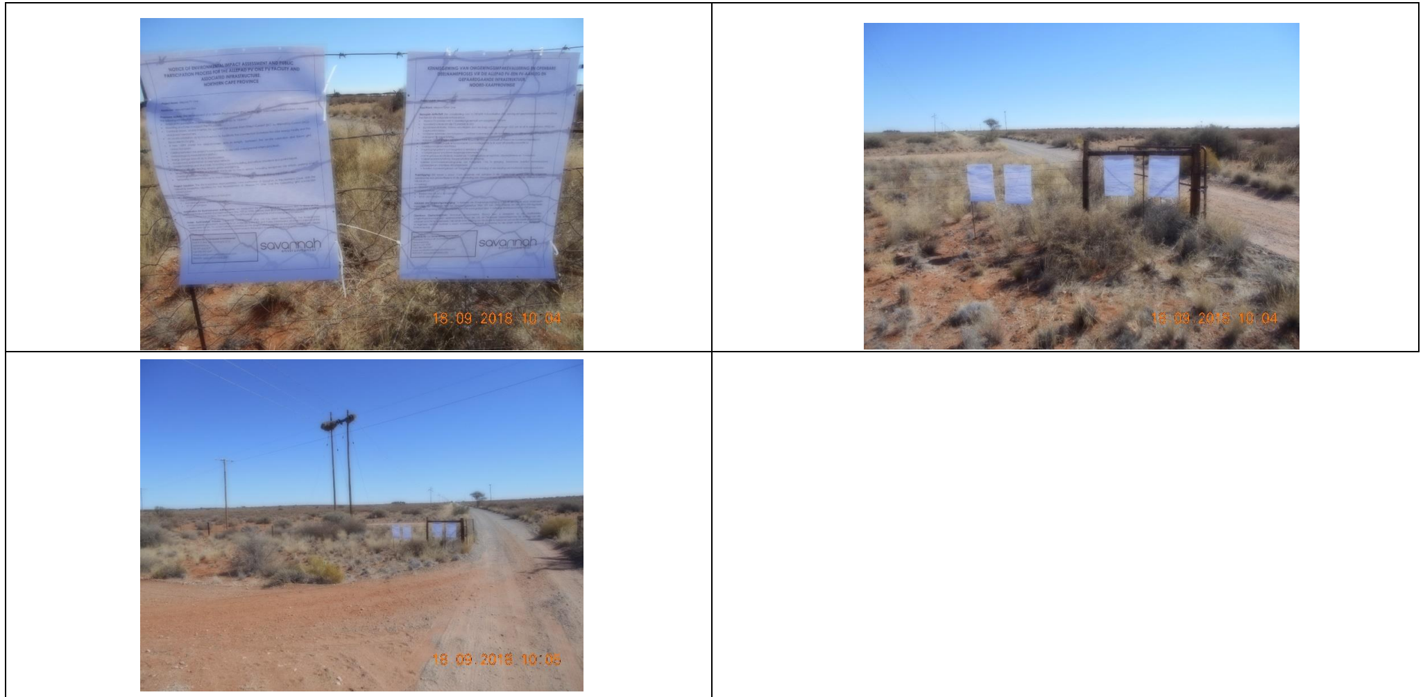
Figure 1: Photos of site notices on the boundary of the Remaining Extent of Erf 5315 Uppington (28° 24' 19.58" S and 21° 08' 07.85" E).

Remaining Extent of Erf 5315 Uppington – Allepad PV One and Grid Connection Infrastructure