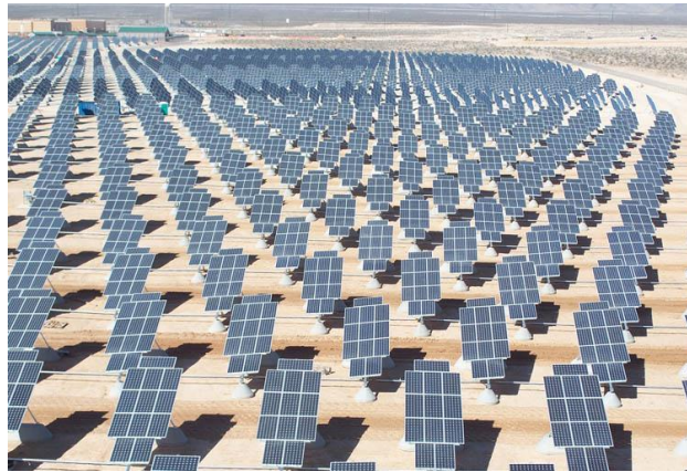
Figure 1: Photovoltaic (PV) solar farm showing typical arrangement of photovoltaic panels.