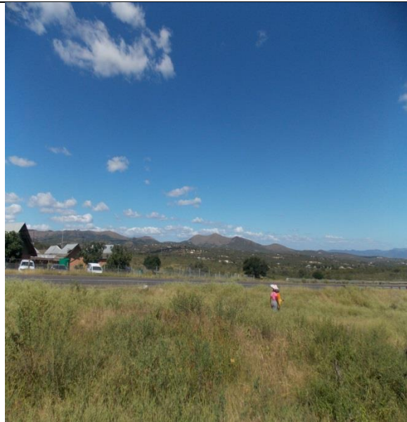
FIGURE 3: EASTERLY DIRECTION OF THE SITE