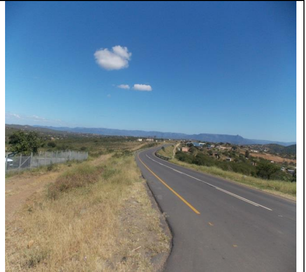
FIGURE 2: SOUTHERLY DIRECTION OF THE SITE