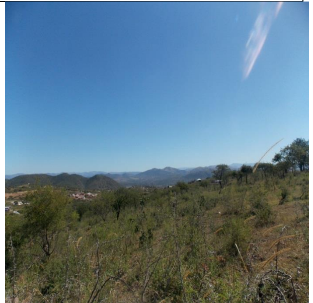
FIGURE 4: WESTERLY DIRECTION OF THE SITE