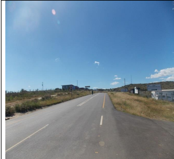
FIGURE 1: NORTHERLY DIRECTION OF THE SITE.