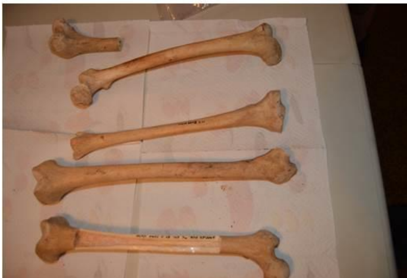
Object 002: Ac # 1241; human remains; skull, mandible, bones; Matjes River (surface ash layer), Western Cape, C14 age ~2970 bp. Samples: 3 x drilled powder