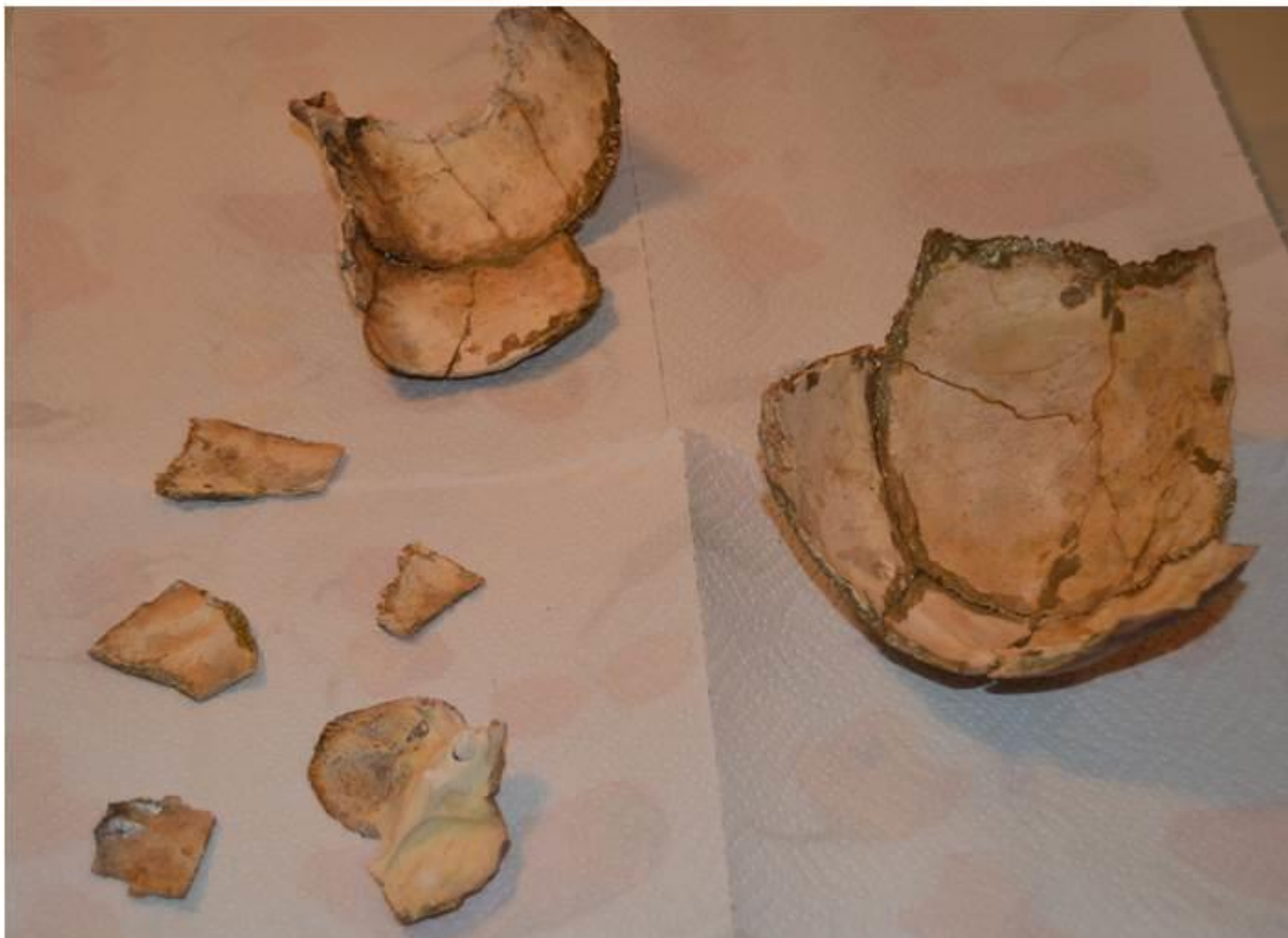
Object 001: Ac # 006; human remains; skull cap, mandible jaw; Matjes River (burnt layer), Western Cape, not dated. Samples: 3 x drilled powder; 1 x bone fragment