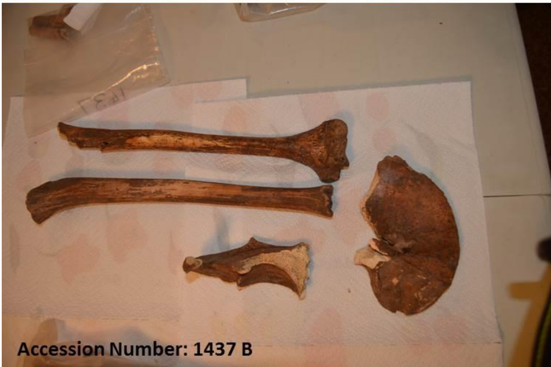
Object 008: Ac # 1437; human remains; skeletal fragments; Matjes River (Wilton), Western Cape; C14 age ~4940 bp. Samples: 3 x drilled powder