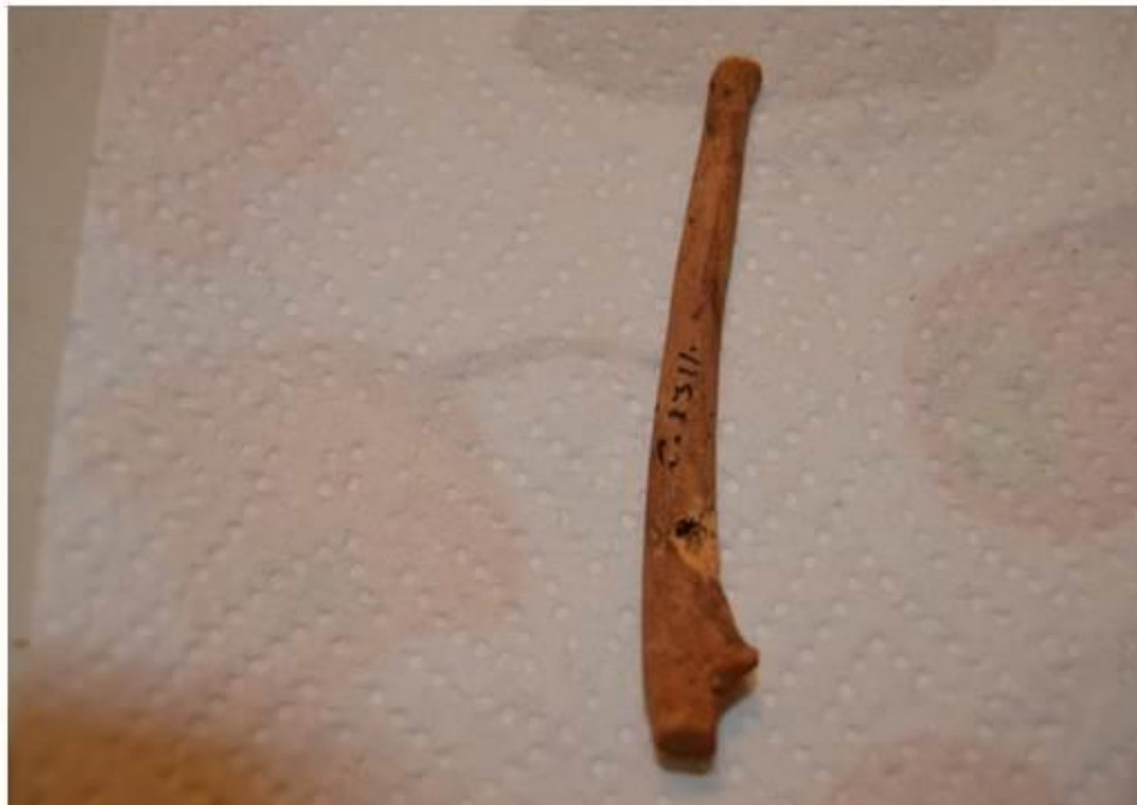
Object 006: Ac # 1311; human remains; skull, skeleton; Matjes River (base of Mossel Bay), Western Cape, no date Samples: 3 x drilled powder; 1 x bone fragment