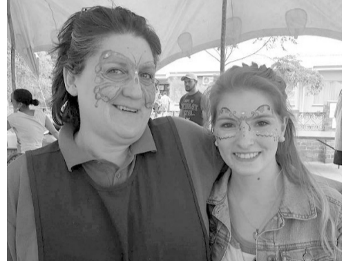
Die grootmense het ook nie terug gestaan nie en deel uitgemaak van die pret.