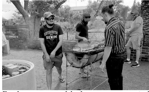
Reeds vroegoggend is daar vuur aangesteek wat gesorg het vir 'n heerlike atmosfeer.