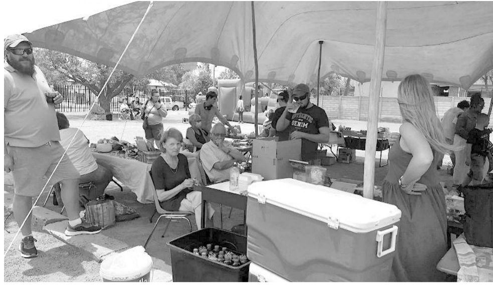
Daar is weereens heerlik saamgekuier by die AGS Kerk se Saamstaan Kontrei winkel.