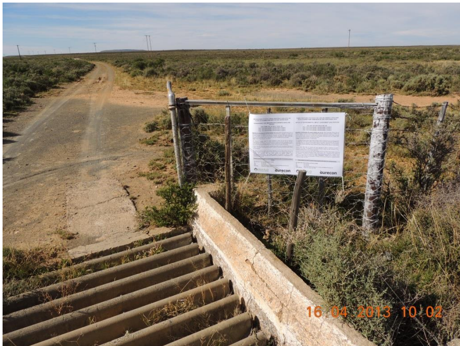
Site notice placed on the gate (30°35'56.32"S; 24° 2'32.58"E)