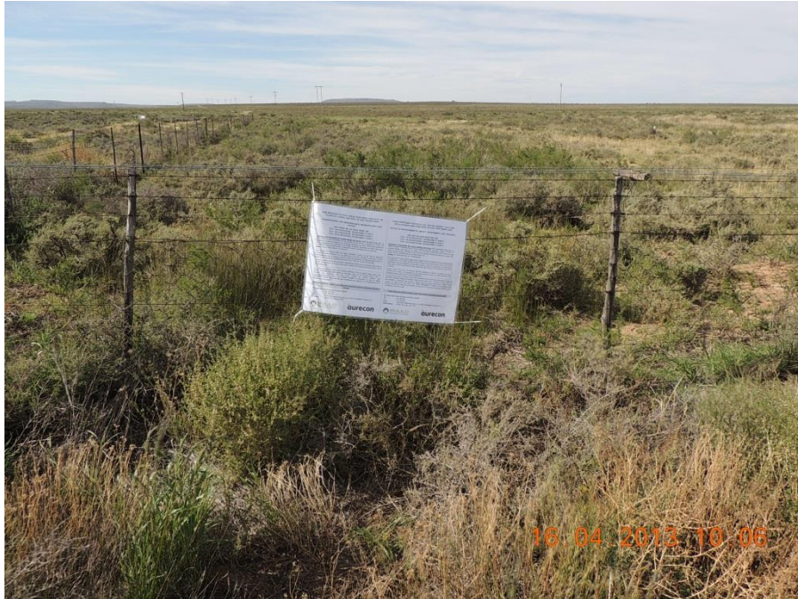
Site notice placed on the boundary fence (30°35'56.63"S; 24° 2'32.12"E)