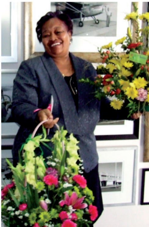
Sylvia Lucas, Premier van die Noord-Kaap was Maandagoggend baie besig. Sy het die "rebirth" van die pragtige Protea Hotel geopen (meer daarvoor in volgende week se Gembok), het verjaar en 'n kleinkind ryker geword. Hier staan sy met blomme wat sy van die hotelgroep ontvang het.