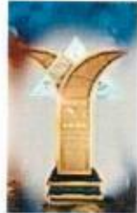
Winner of Century Quality International ERA Award

Sedibeng Water will be able to supply water for the project for its planned construction and operation phases. The connection point will be provided along the bulk pipeline between Horseshoe reservoir and the Black Mountain take off point in Aggeneys. The cost of water connection supply point will be provided once the approval has been granted and water consumption shall be billed according to the approved tariff for Pelladrikt Regional Water Scheme.