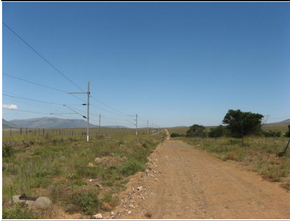
Figure 1.2 View of the site looking in a south easterly, showing the existing Transnet railway line and adjacent service road that transect the site