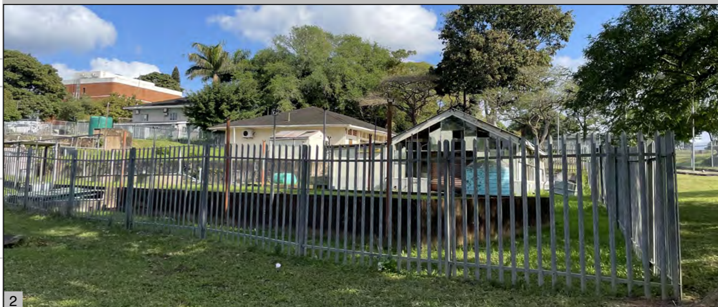
IMAGES: 1 - Agricultural building 2 - Outbuilding