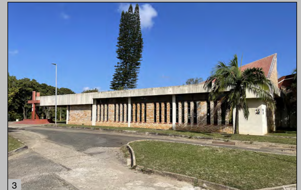
IMAGES: 1 - Northern facade 2 - Southern facade 3 - Eastern facade