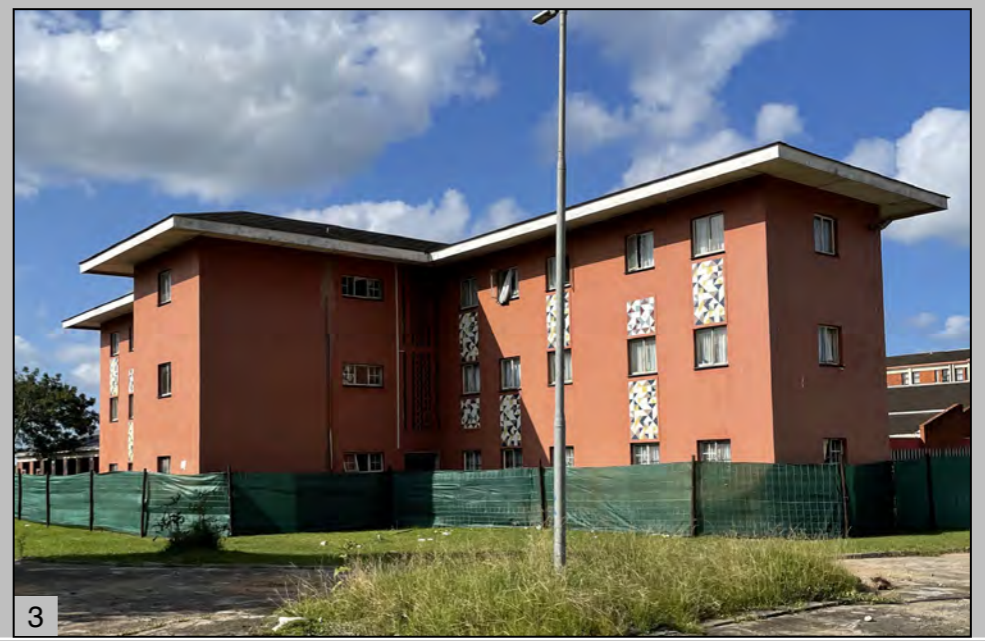
IMAGES: 1 - Southern facade of Khethomthandayo House 2 - Western facade of other residential building 3 - Northern facade of Khethomthandayo House