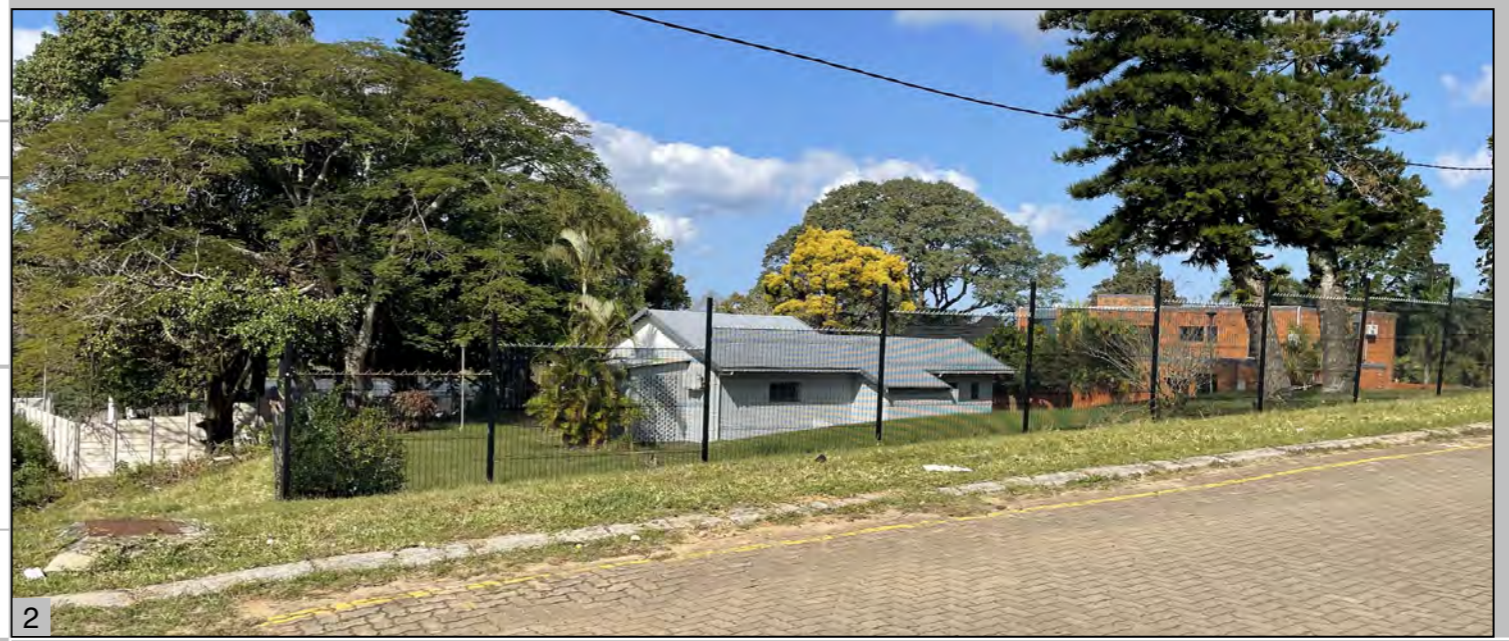
IMAGES: 1 & 2 - Buildings amongst the trees, as seen from university road