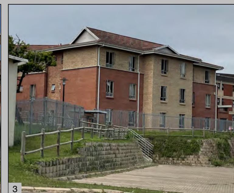
IMAGES: 1 - Southern view towards buildings 2 - Western view towards building 3 - Northern view towards buildings