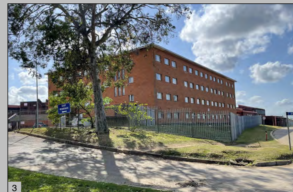
IMAGES: 1 - Eastern facade 2 - Eastern facade showing perforated brick detail at the top of the stairwell 3 - Southern facade