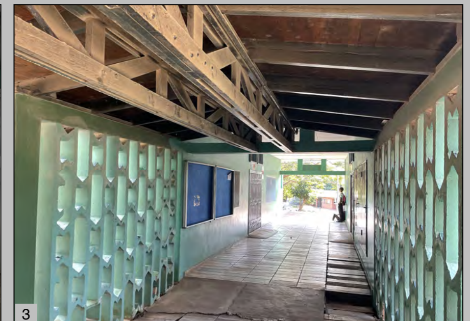
IMAGES: 1 - Botany building with front addition. Green expanse and mature trees between building and avenue. 2 - Internal passage leading from front of building to back exit 3 - Brise-soleil with laminated wooden beams