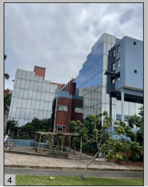
IMAGES: 1 - Western facade 2 - Northern side of building, with pedestrian avenue located between Arts Lecture Halls and Arts Block 3 & 4 - Southern facade along the southern avenue