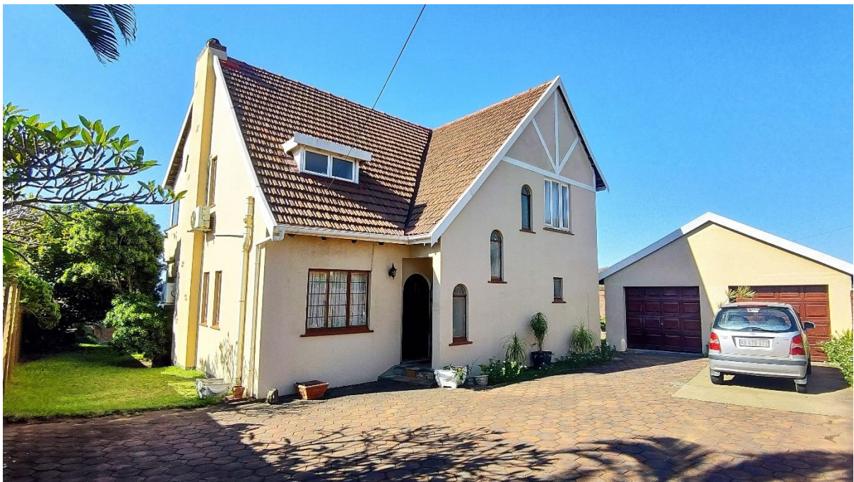
Figure 2. Front elevation view of house and double garage from driveway entrance