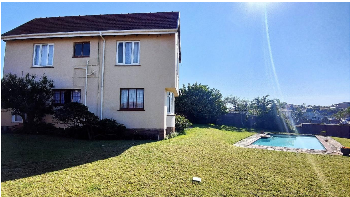
Figure 4. Side elevation view of house from garden