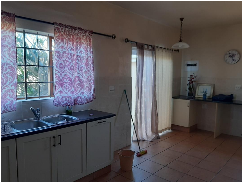
Figure 12. View of kitchen