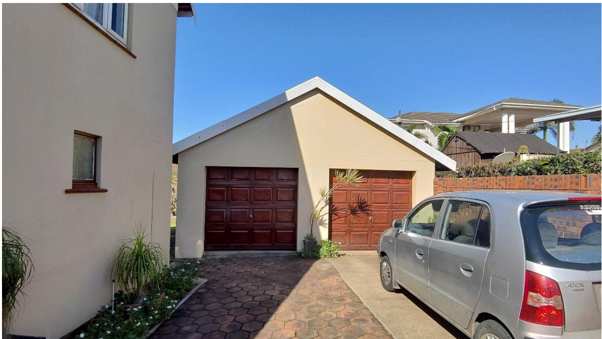
Figure 6. Elevation view of double garage