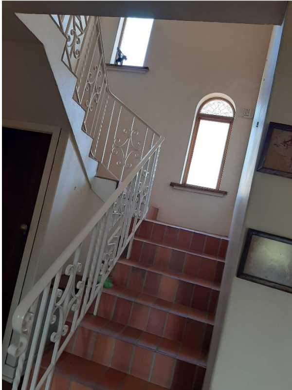
Figure 11. View of stair case