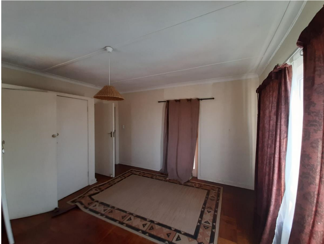
Figure 13. View of ex bedroom 2