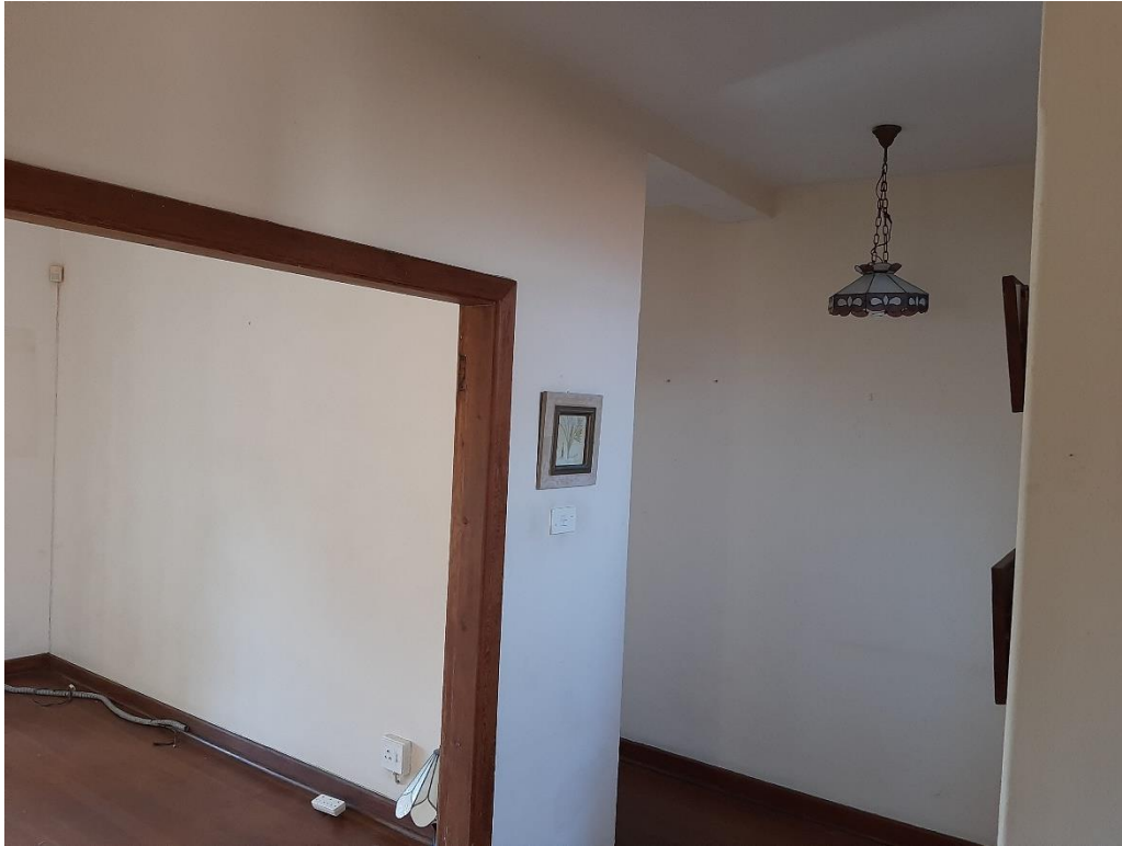
Figure 9. View of entrance passage