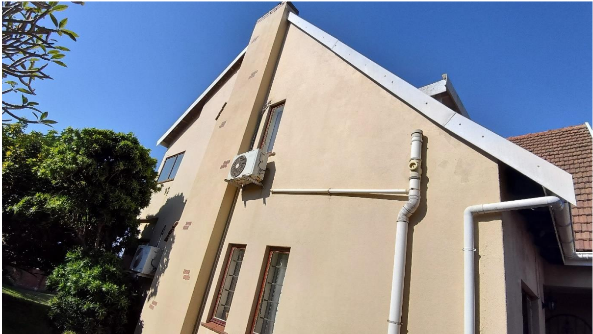
Figure 5. Side elevation view of house from driveway entrance