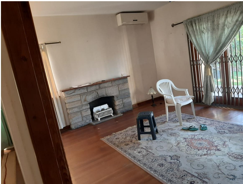
Figure 10. View of lounge and fire place