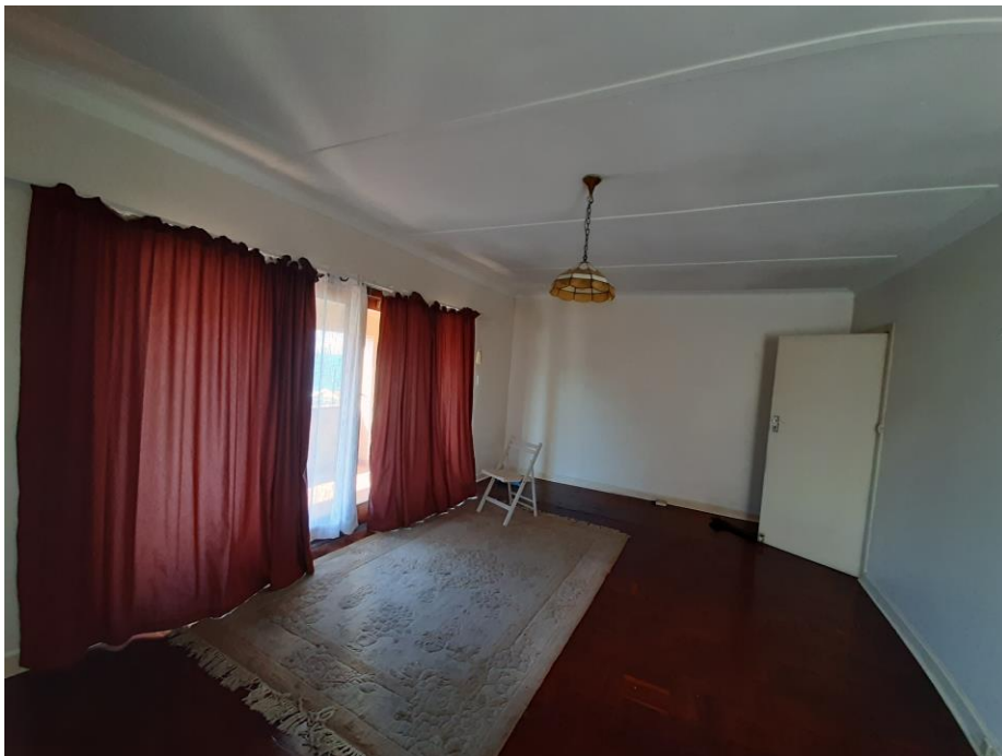
Figure 14. View of ex bedroom 1