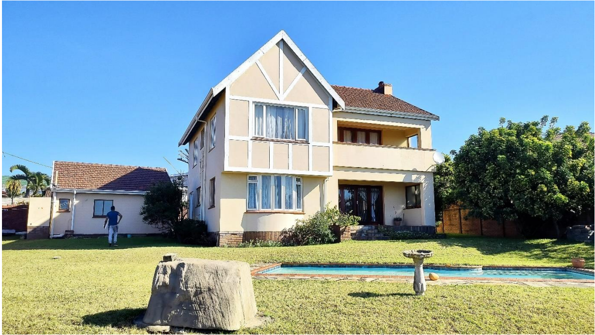
Figure 3. Rear view of house from garden