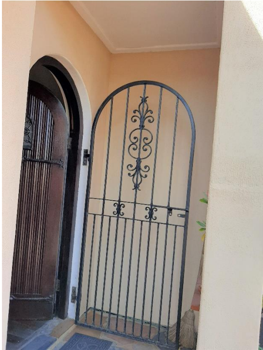
Figure 7. View of front door