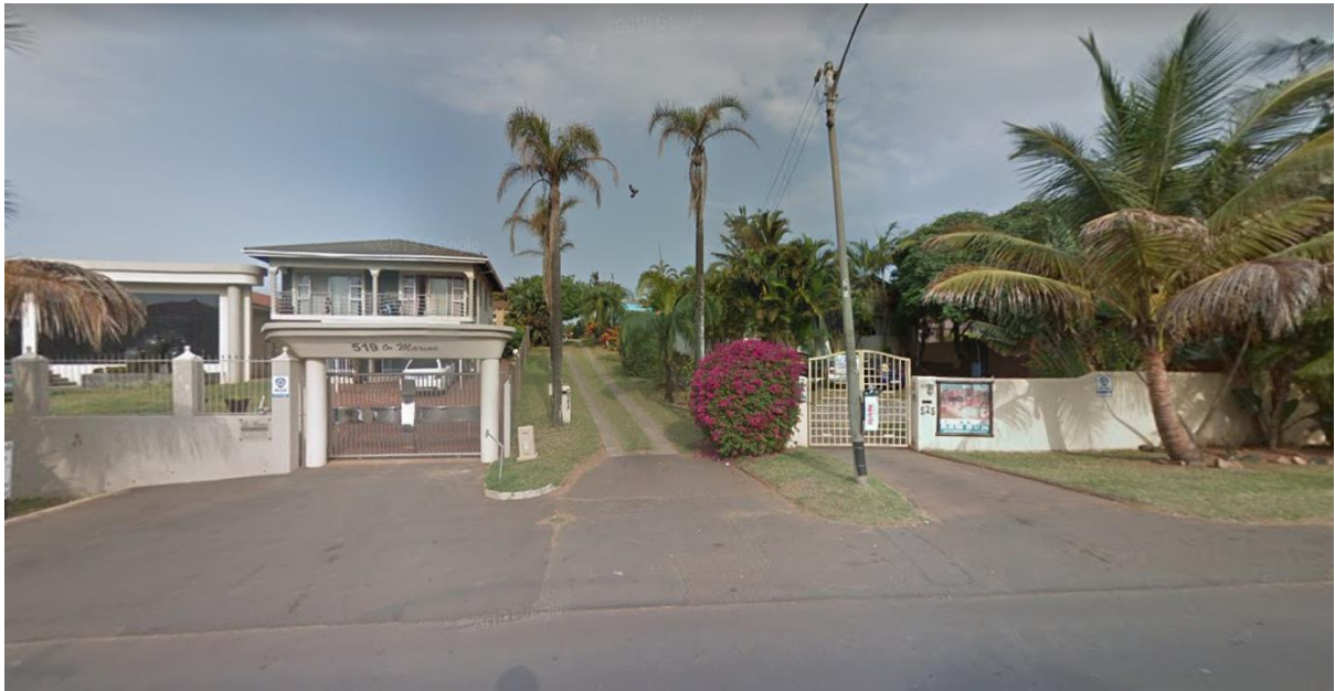
Figure 1. Street View (Marine Drive)