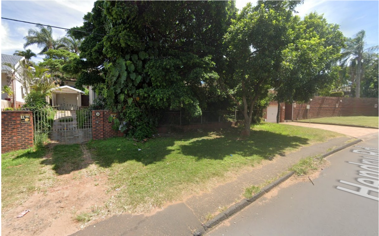
Figure 9. 24 Hendry Road – Existing House

REF: 2023-07-ANNEX03 – URBAN SETTING ANALYSIS