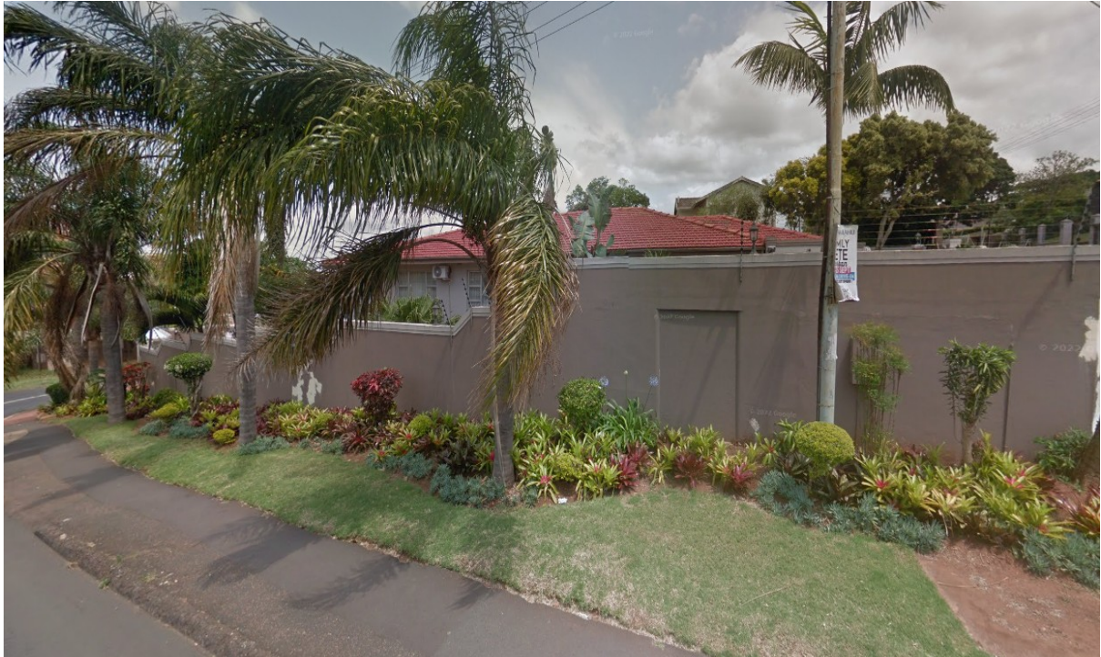
Figure 13. 36 Hendry Road – Existing House

REF: 2023-07-ANNEX03 – URBAN SETTING ANALYSIS