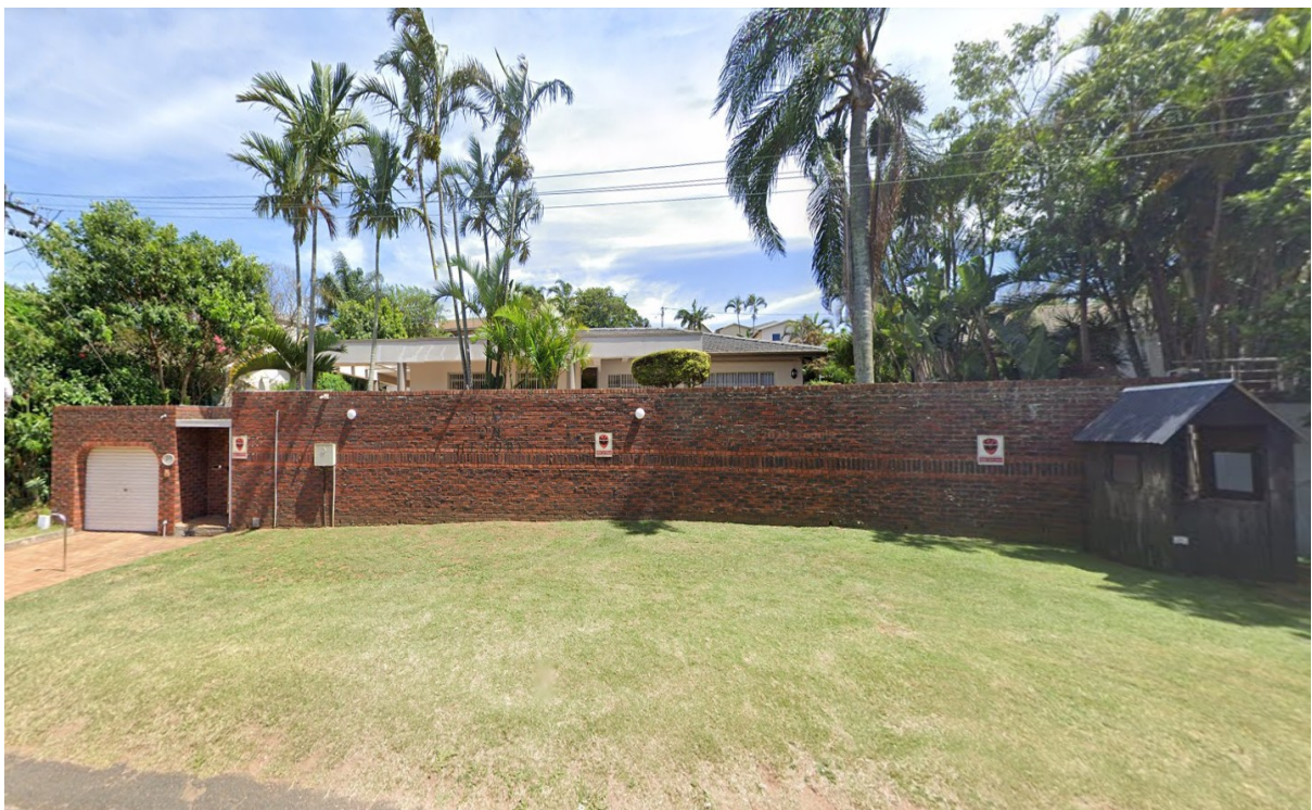
Figure 8. 20 Hendry Road – Existing House

AHMED OLLA ARCHITECTS (PTY) LTD | REG NO: 2015/175154/07