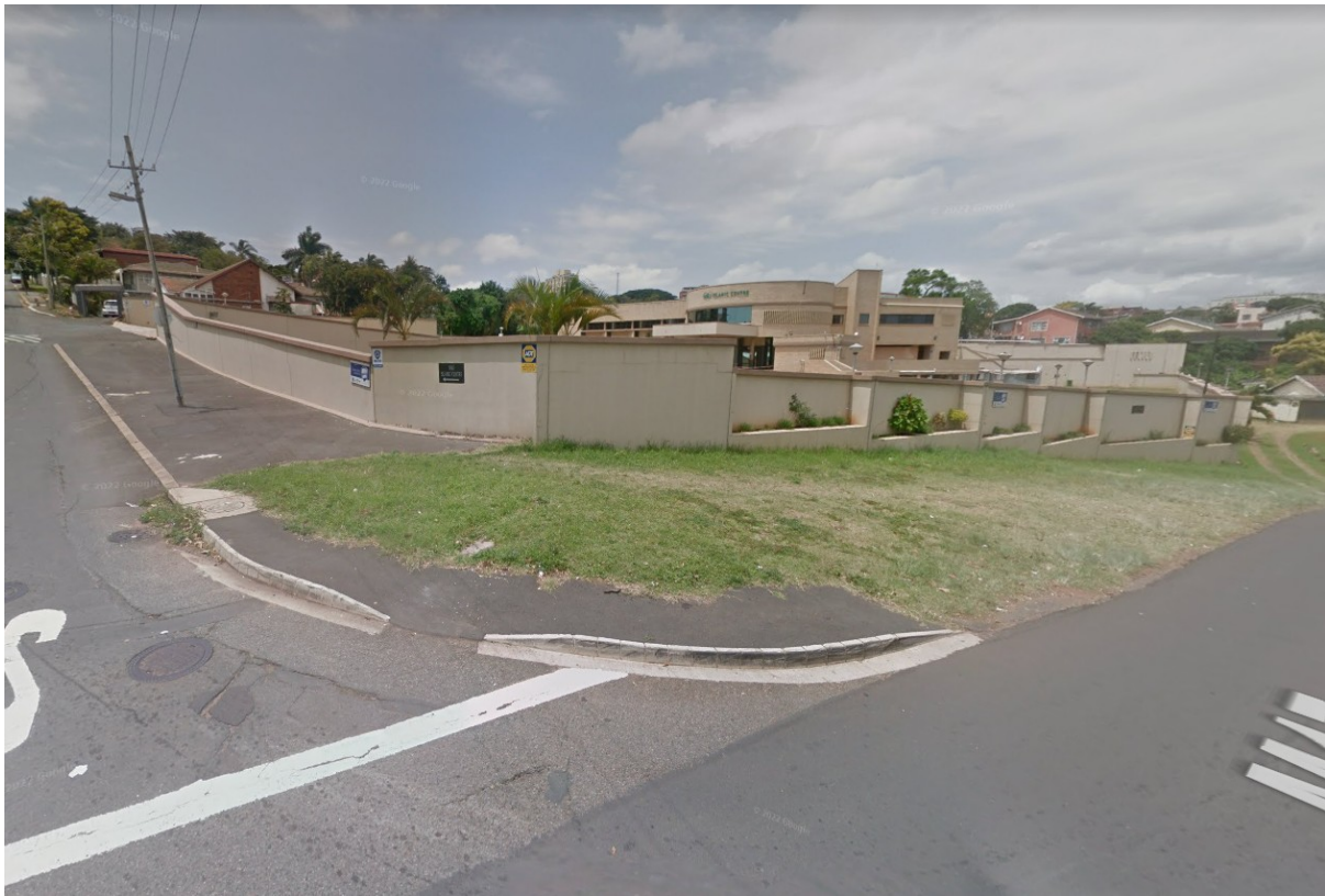
Figure 3. 37 Mountain View Avenue – N.M.J. Hall

REF: 2023-07-ANNEX03 – URBAN SETTING ANALYSIS