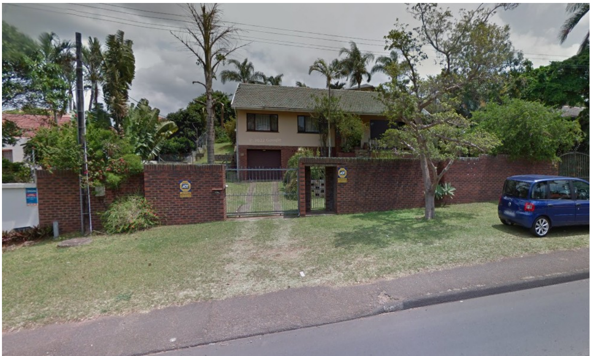
Figure 10. 28 Hendry Road – Existing House

AHMED OLLA ARCHITECTS (PTY) LTD | REG NO: 2015/175154/07