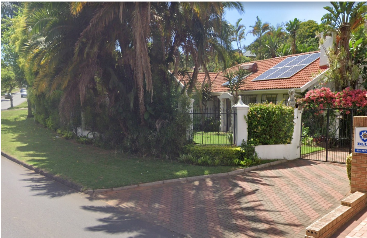
Figure 4. 27 Hendry Road – Existing House

AHMED OLLA ARCHITECTS (PTY) LTD | REG NO: 2015/175154/07