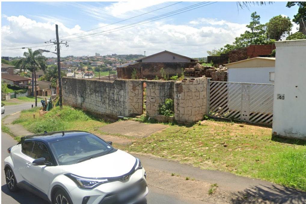
Figure 14. 40 Hendry Road – Existing House

AHMED OLLA ARCHITECTS (PTY) LTD | REG NO: 2015/175154/07