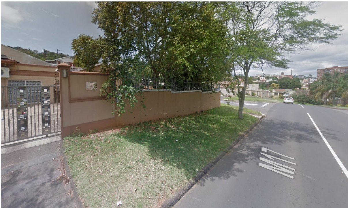
Figure 2. 37 Hendry Road – Existing House

AHMED OLLA ARCHITECTS (PTY) LTD | REG NO: 2015/175154/07