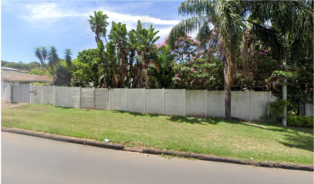
Figure 5. 23 Hendry Road – Existing House

REF: 2023-07-ANNEX03 – URBAN SETTING ANALYSIS