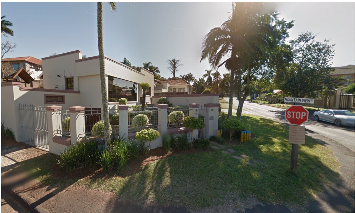
Figure 12. 32 Hendry Road – Existing House

AHMED OLLA ARCHITECTS (PTY) LTD | REG NO: 2015/175154/07