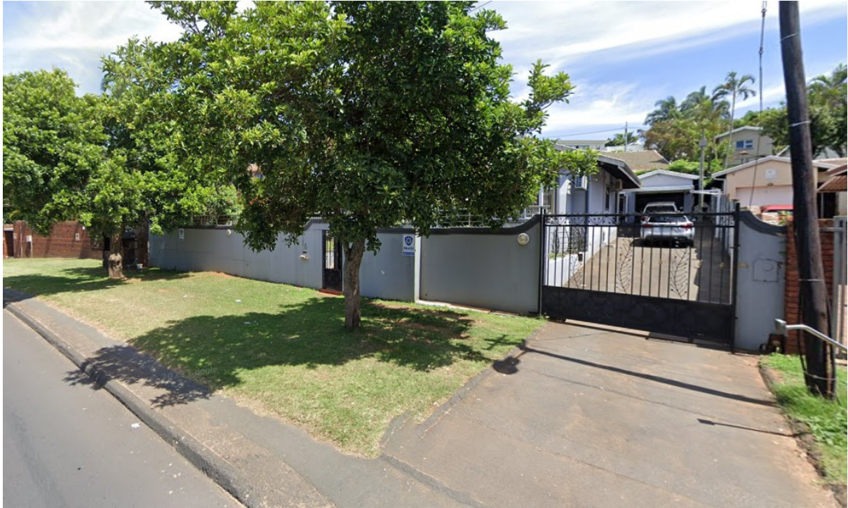
Figure 7. 16 Hendry Road – Existing House

REF: 2023-07-ANNEX03 – URBAN SETTING ANALYSIS