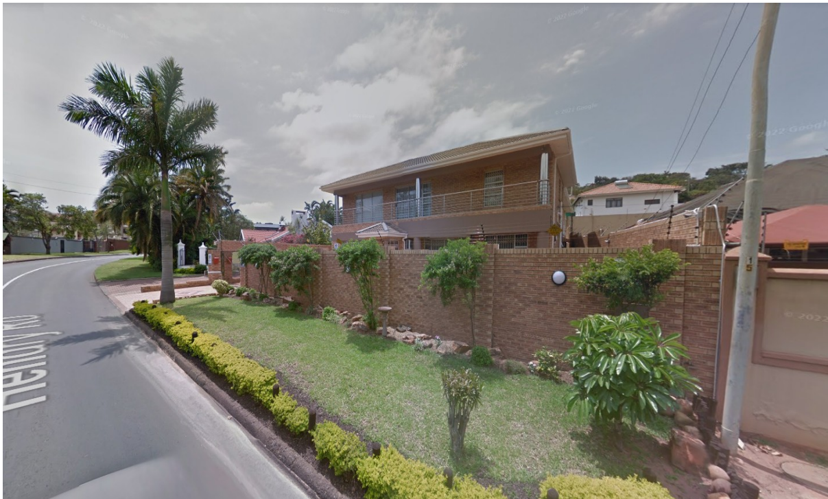
Figure 1. 31 Hendry road – Existing House

REF: 2023-07-ANNEX03 – URBAN SETTING ANALYSIS