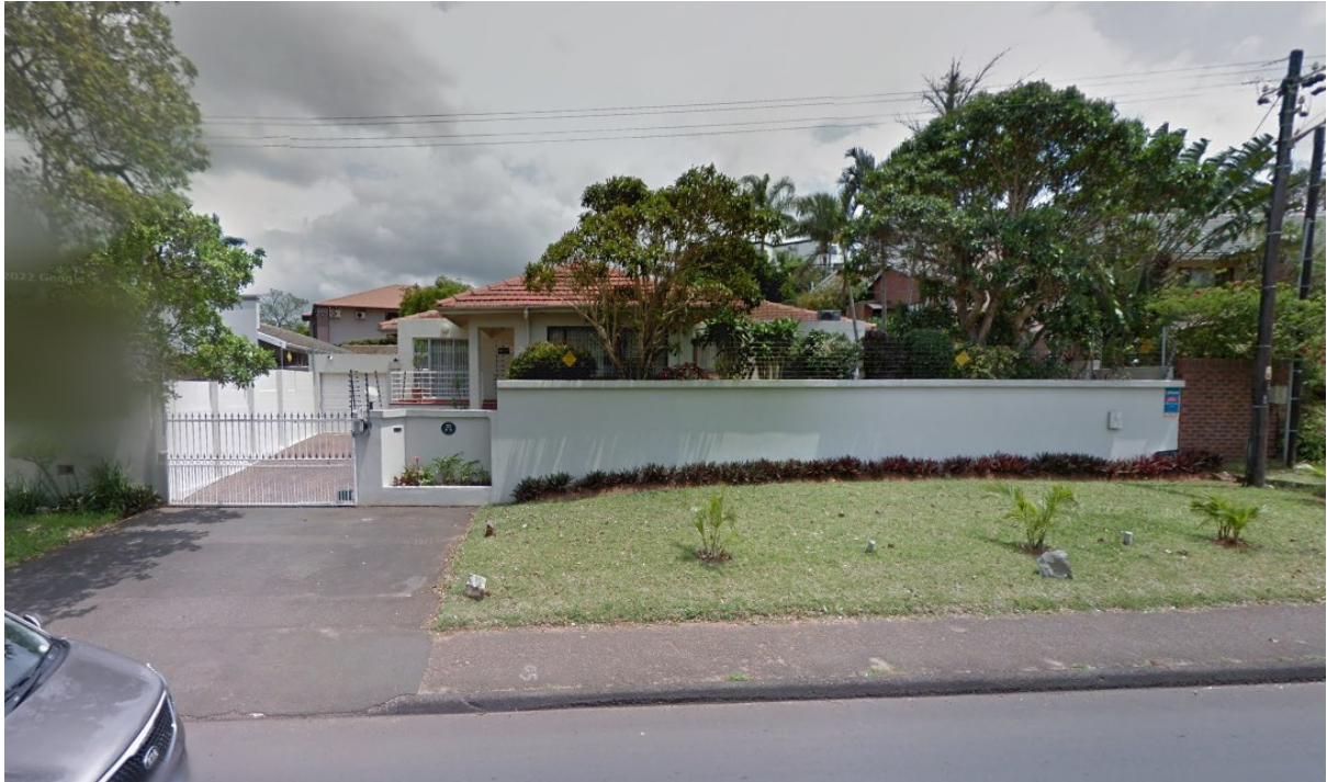
Figure 11. 32 Hendry Road – Existing House

REF: 2023-07-ANNEX03 – URBAN SETTING ANALYSIS