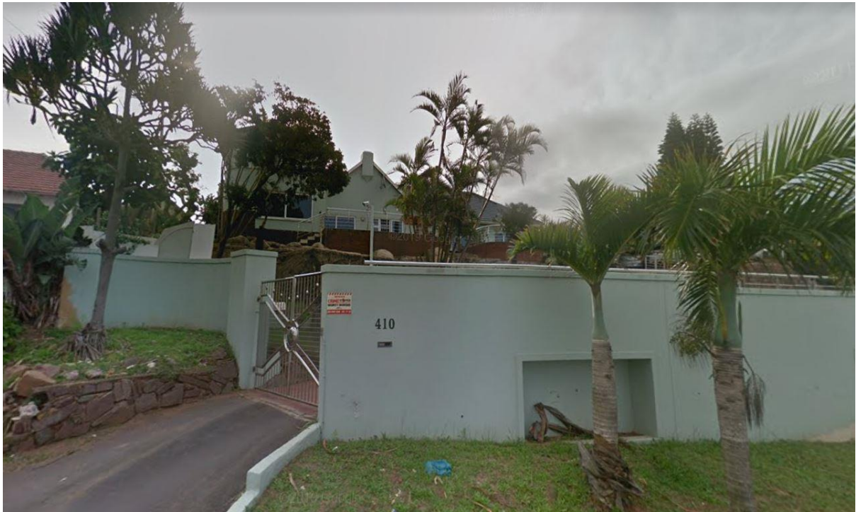
Figure 13. 410 Marine Drive – Existing Dwelling