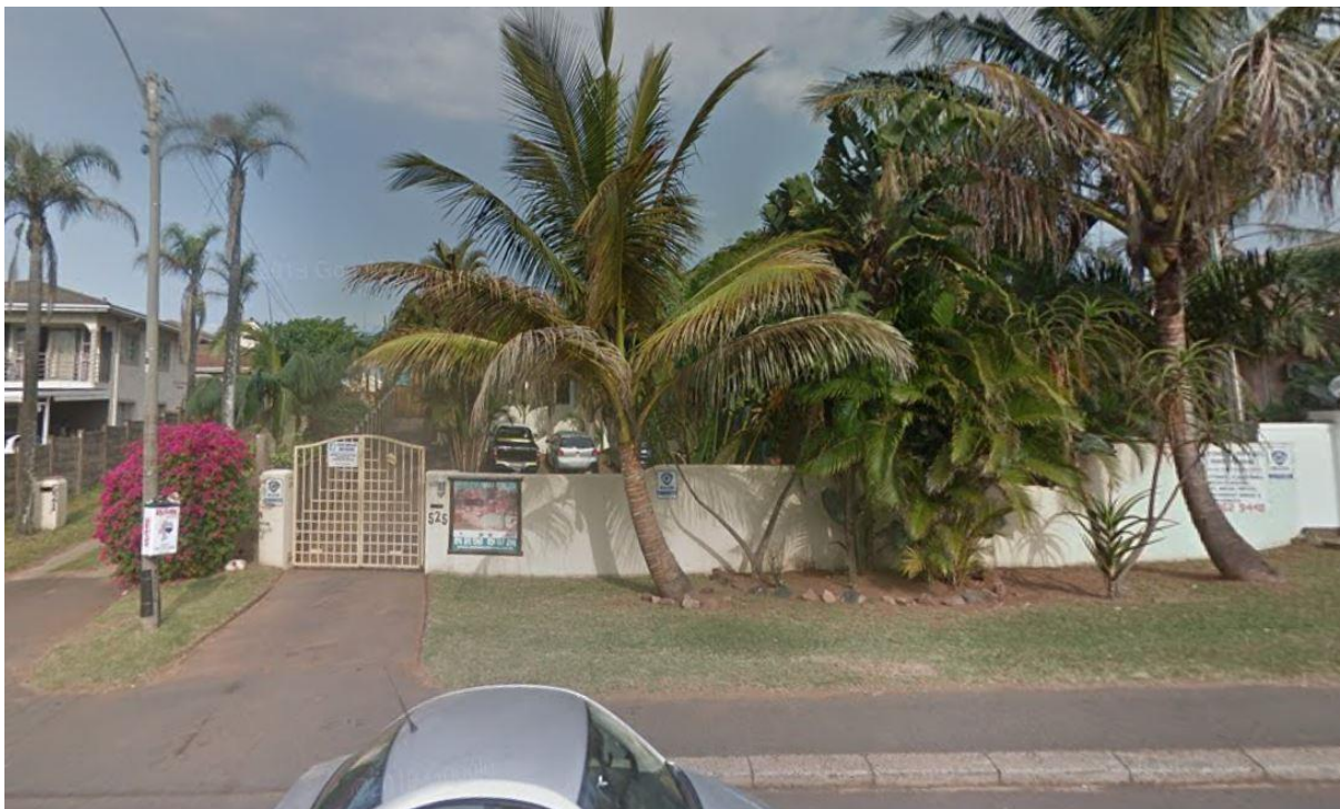
Figure 2. 525 Marine Drive – Aloha Guesthouse