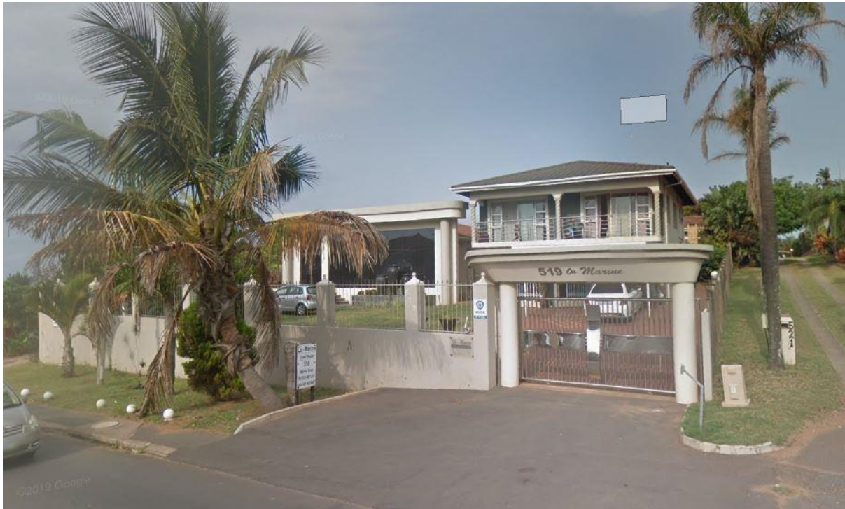
Figure 1. 519 Marine Drive – Le Merine Guesthouse