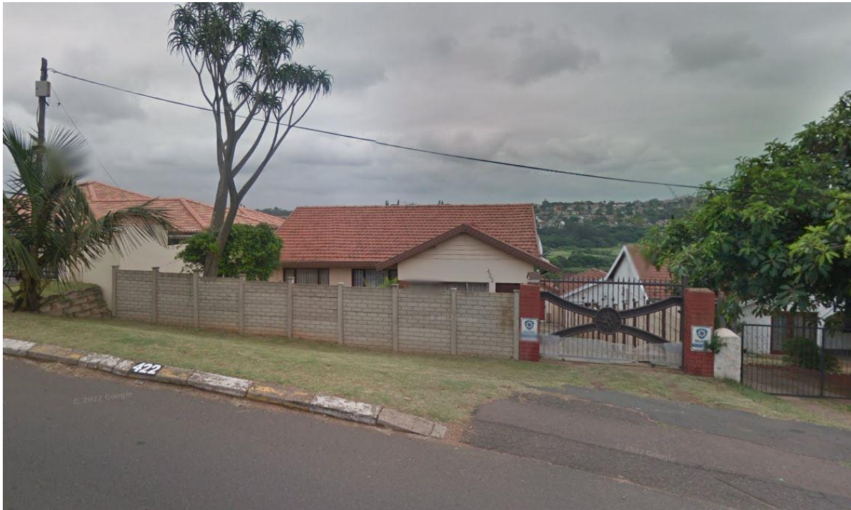
Figure 7. 422 Marine Drive – Existing Dwelling