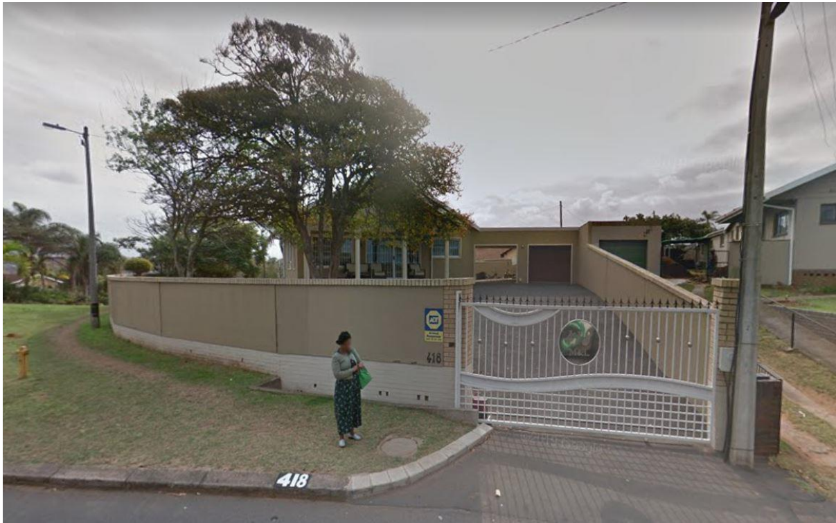
Figure 9. 418 Marine Drive – Existing Dwelling