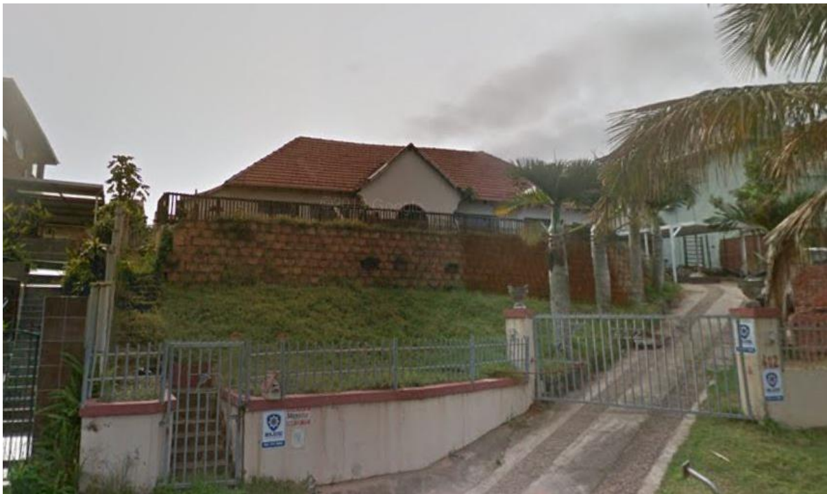
Figure 12. 412 Marine Drive – Existing Dwelling