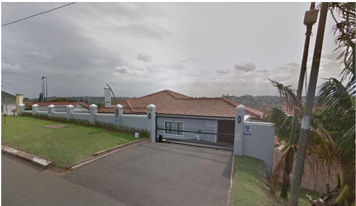
Figure 6. 424 Marine Drive – Martin Mews Guesthouse