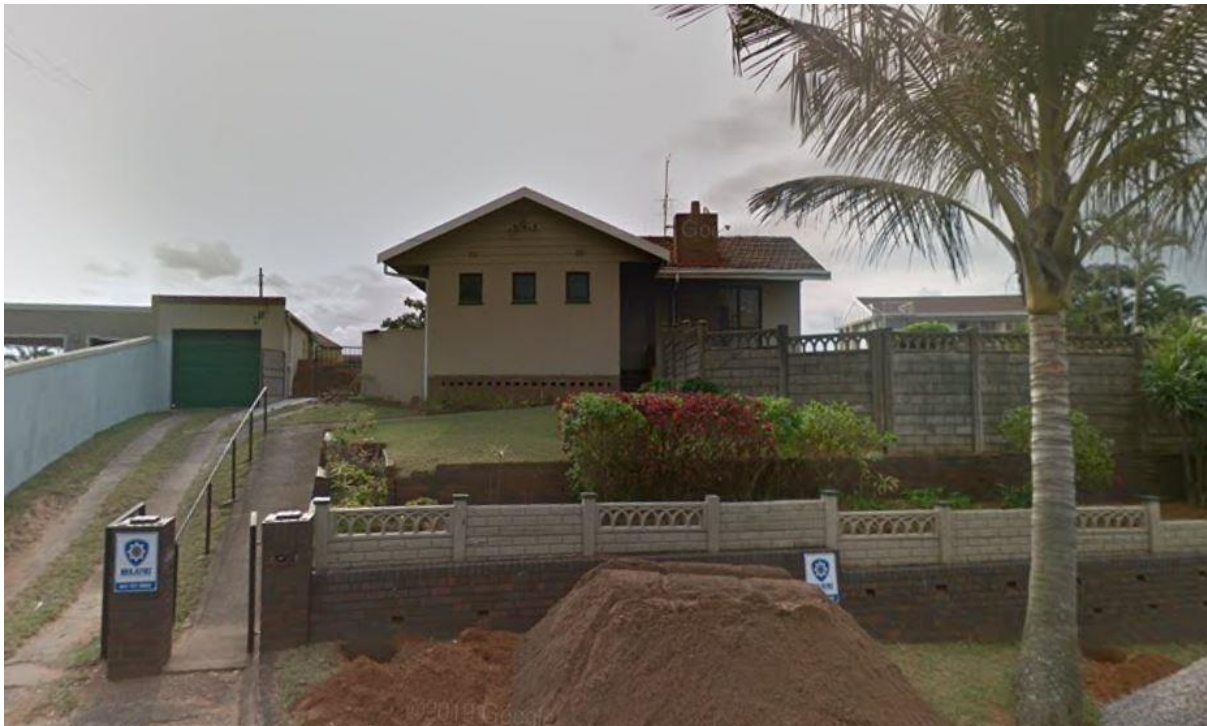
Figure 10. 416 Marine Drive – Existing Dwelling