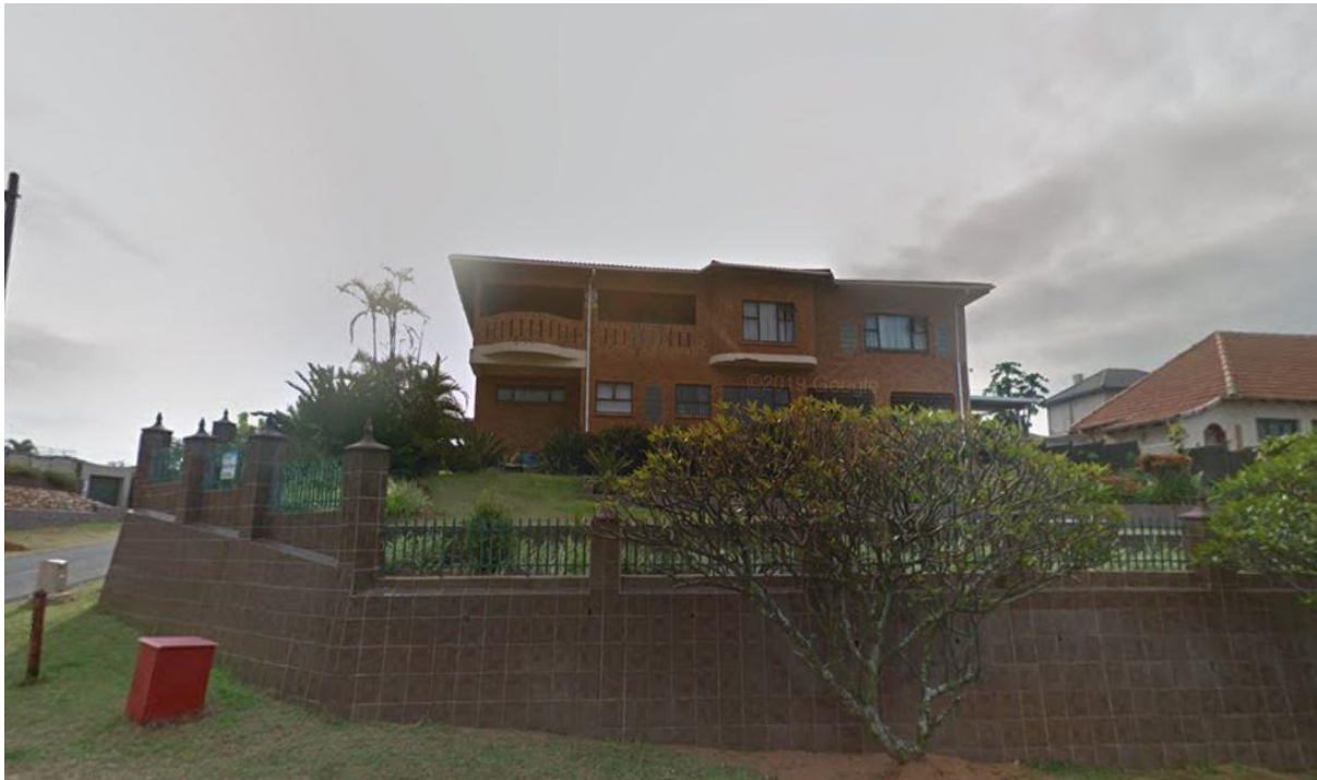
Figure 11. 414 Marine Drive – Existing Dwelling