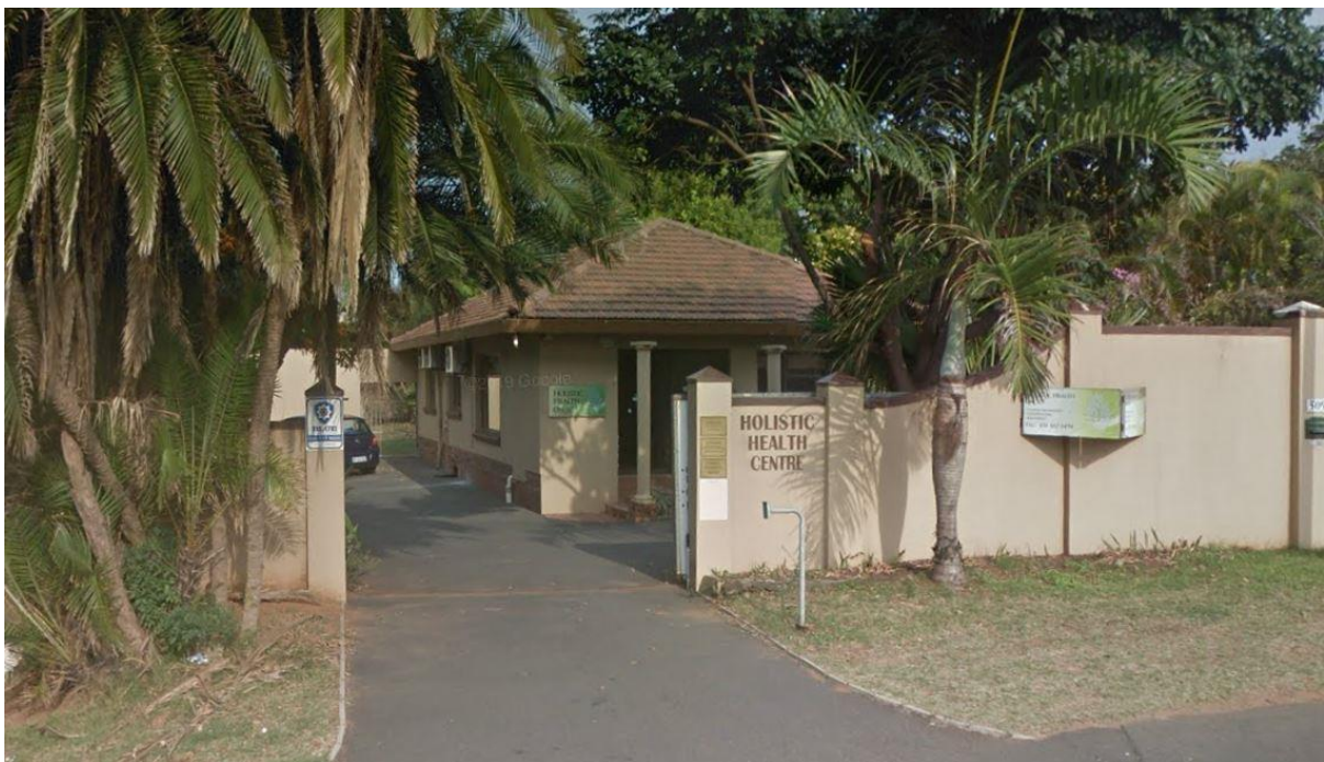
Figure 18. 509 Marine Drive – Existing Dwelling