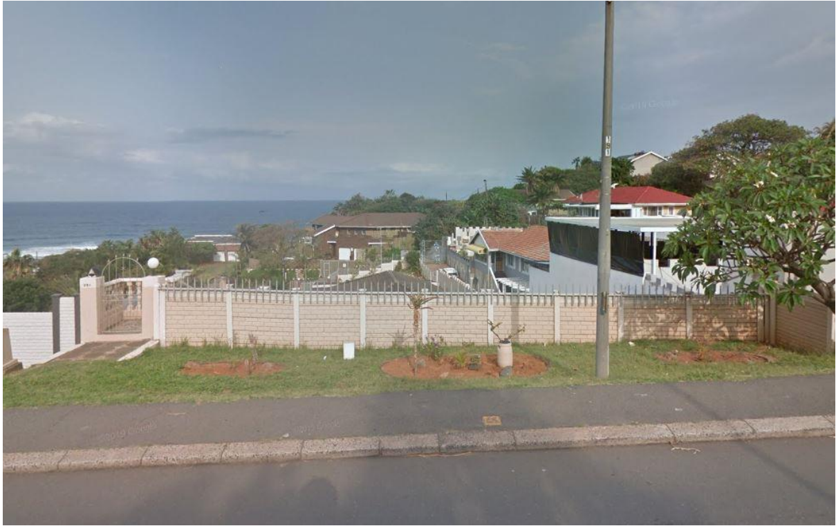
Figure 15. 493 Marine Drive – Existing Dwelling