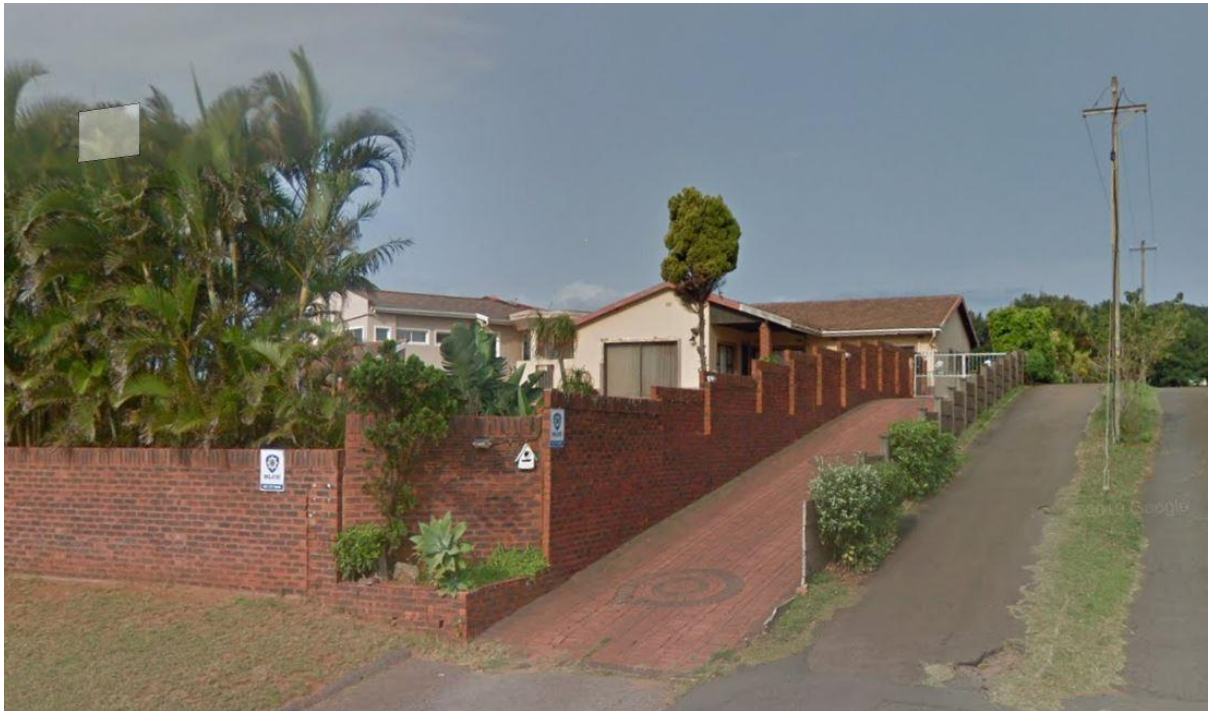
Figure 5. 539 Marine Drive – Existing Dwelling