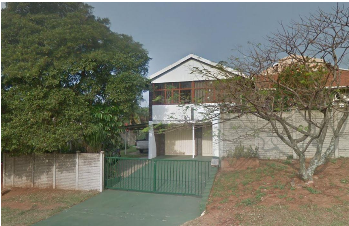
Figure 4. 535 Marine Drive – Existing Dwelling