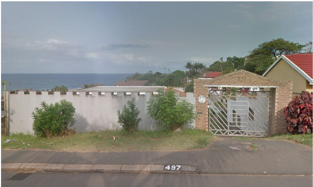
Figure 16. 497 Marine Drive – Existing Dwelling