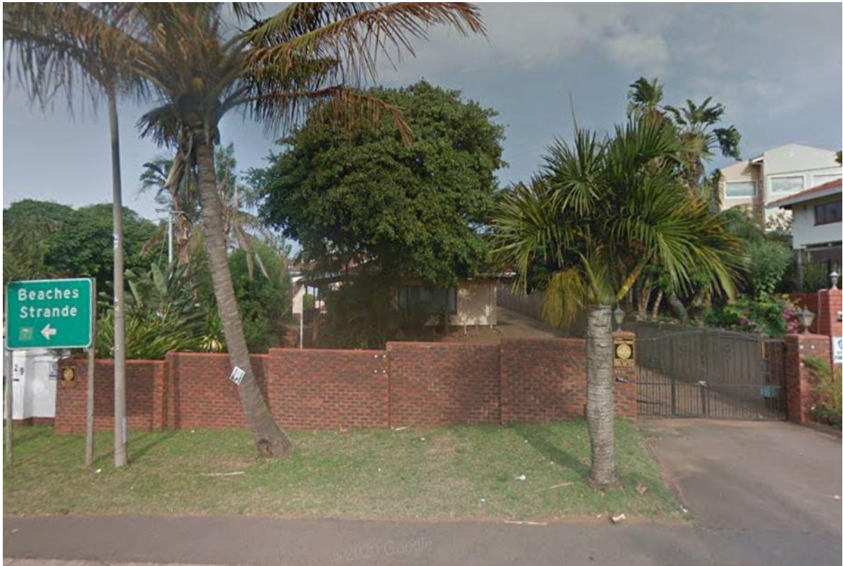
Figure 3. 531 Marine Drive – Existing Dwelling