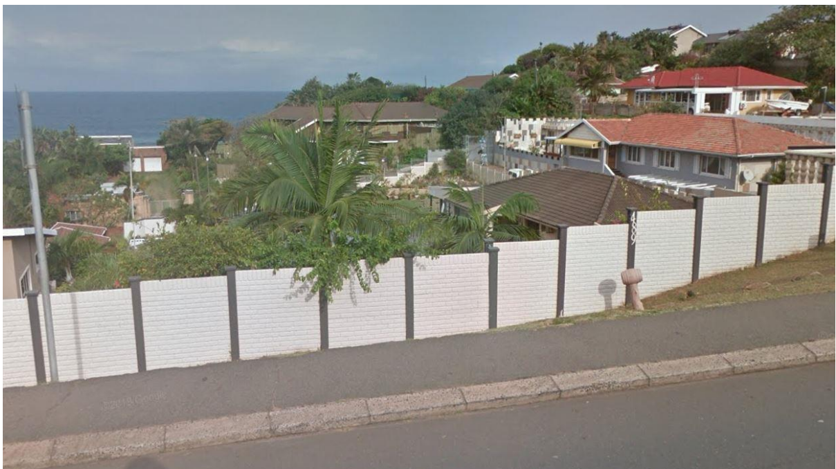
Figure 14. 489 Marine Drive – Existing Dwelling