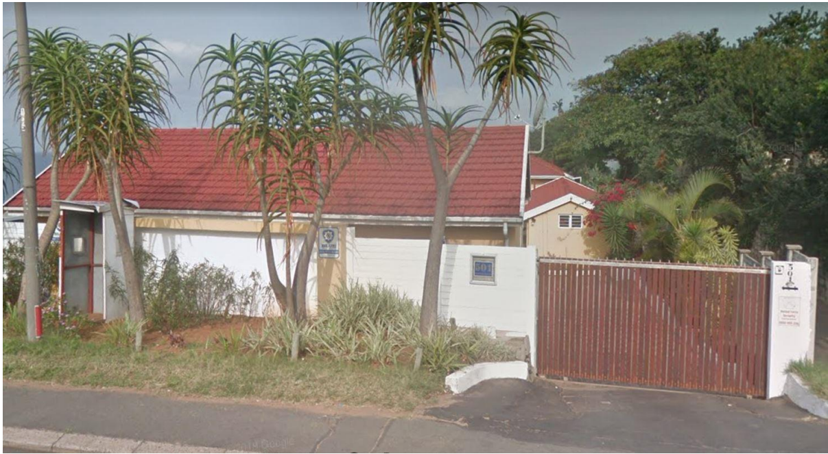
Figure 17. 501 Marine Drive – Existing Dwelling