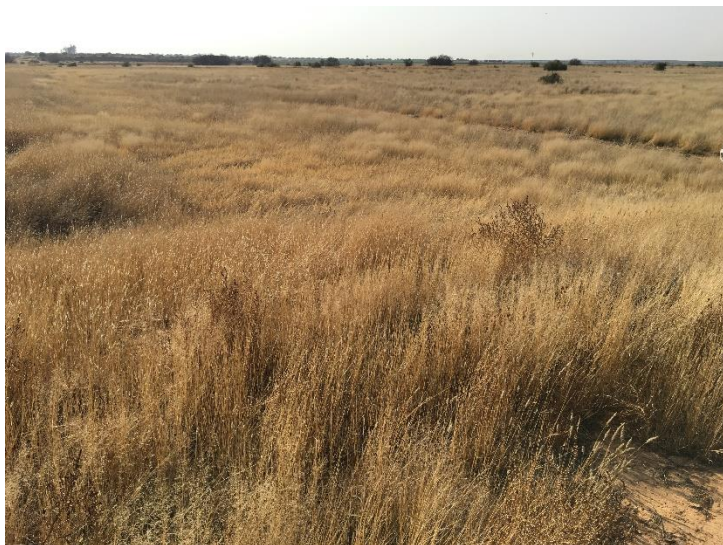
Image of the proposed site from the centre of the site towards the east. The old slimes dams are visible in the background.