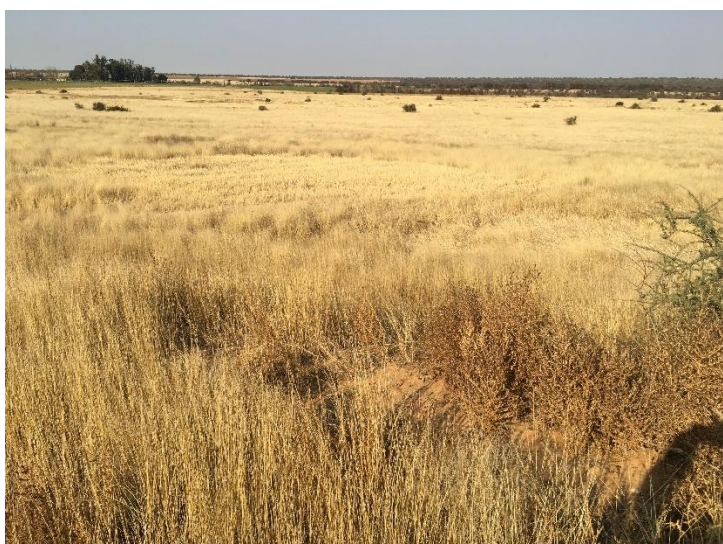
Image of the proposed site from the centre of the site towards the south. The crop production of the neighbour bordering to the south is visible in the image.

Image of the proposed site from the centre of the site towards the east. The old slimes dams are visible in the background.