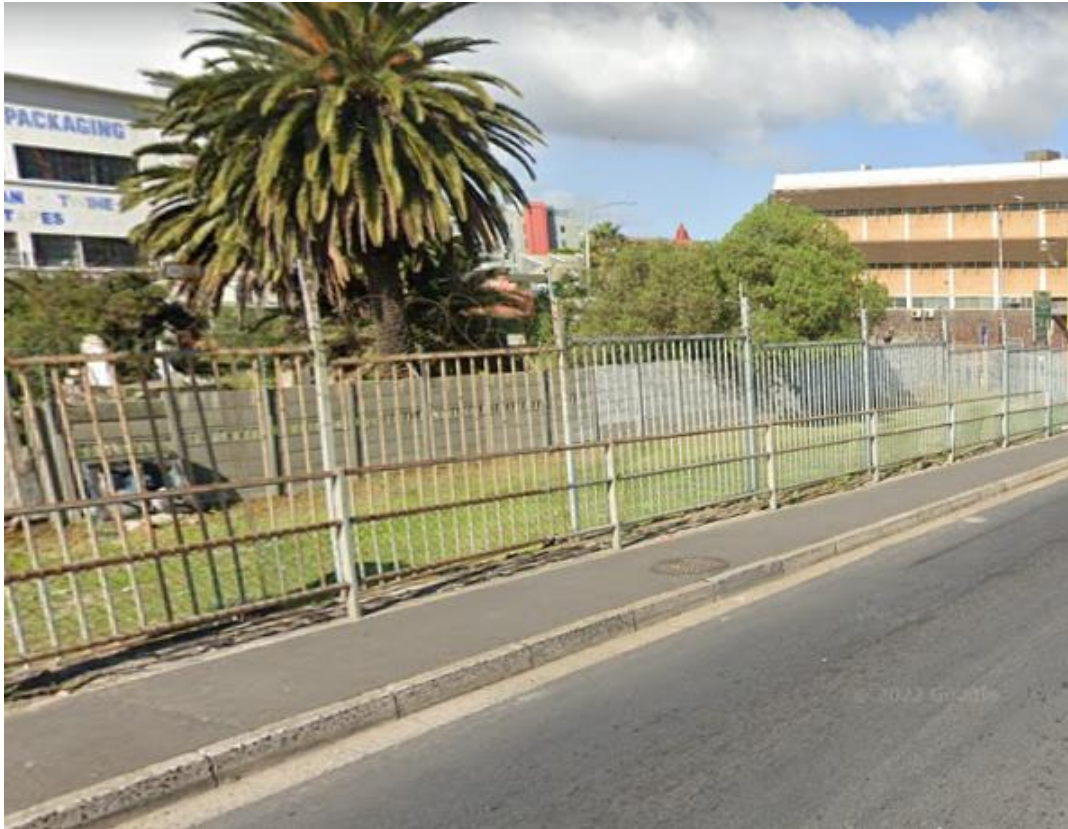
Fig 7. View of the cemetery from the Lower Church Street Bridge showing the western perimeter wall