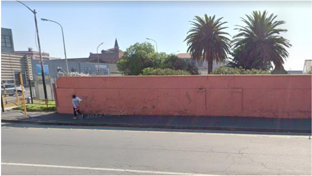
Fig 3. Cemetery wall at the corner of Albert Road and Lower Church Street.