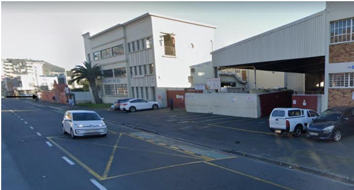
Fig 1 Albert Road Woodstock looking west. The Woodstock cemetery is on the left (arrowed).