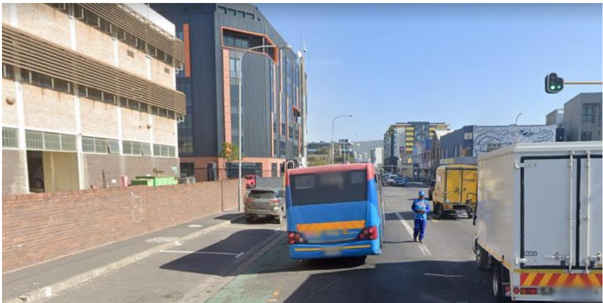
Fig 4. Albert Road looking west towards Cape Town. The cemetery would be on the right of the photograph.