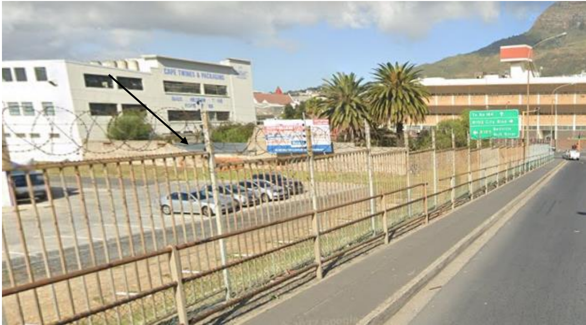
Fig 5. View of cemetery from the Lower Church Street Bridge. This shows the collapsed northern wall (arrowed)