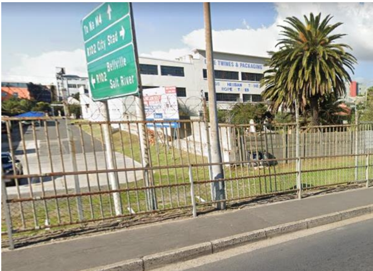
Fig 6. View of the back of the cemetery in the cul de sac showing the collapsed north wall.