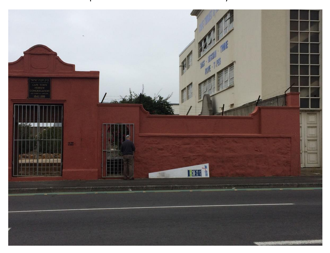
Fig 1. View along Albert Road showing the old wall and street entrance