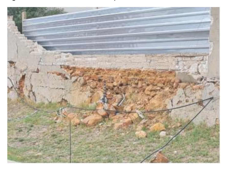
Fig 6. View of the northern wall showing temporary security measures. 2022.