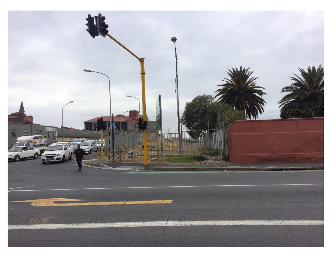
Fig 3. View of the Lower Church Street Bridge and intersection with Albert Road showing heavy traffic