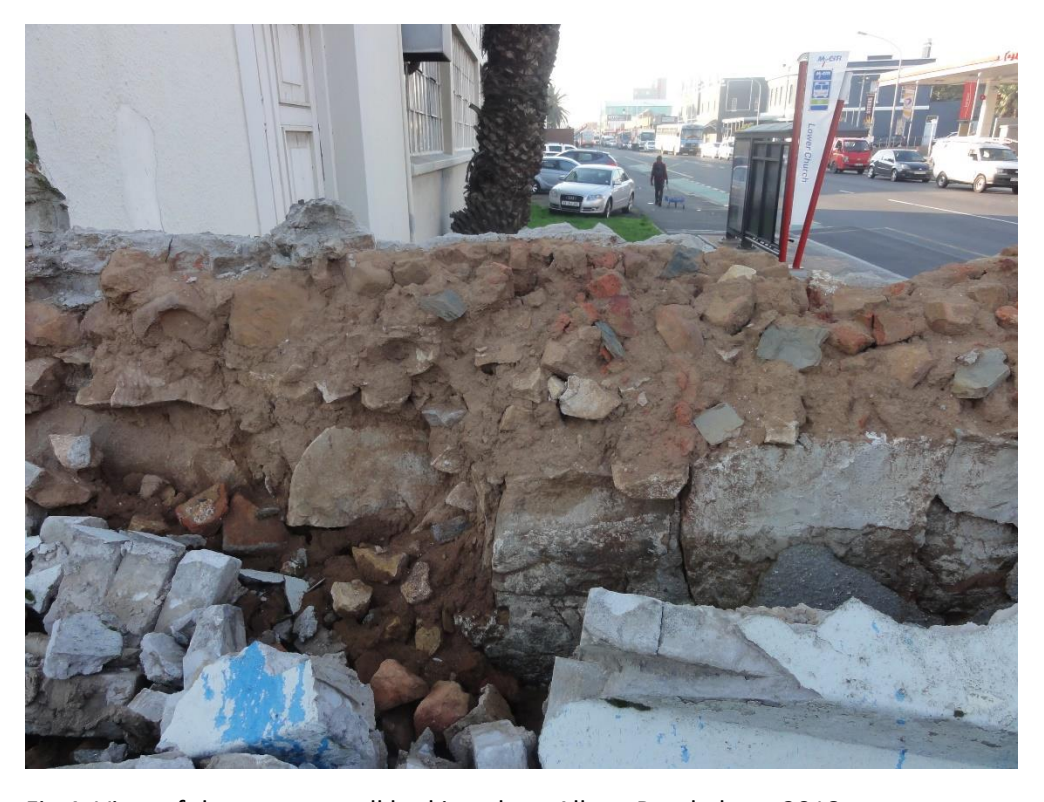
Fig 4. View of the eastern wall looking along Albert Road photo 2018.