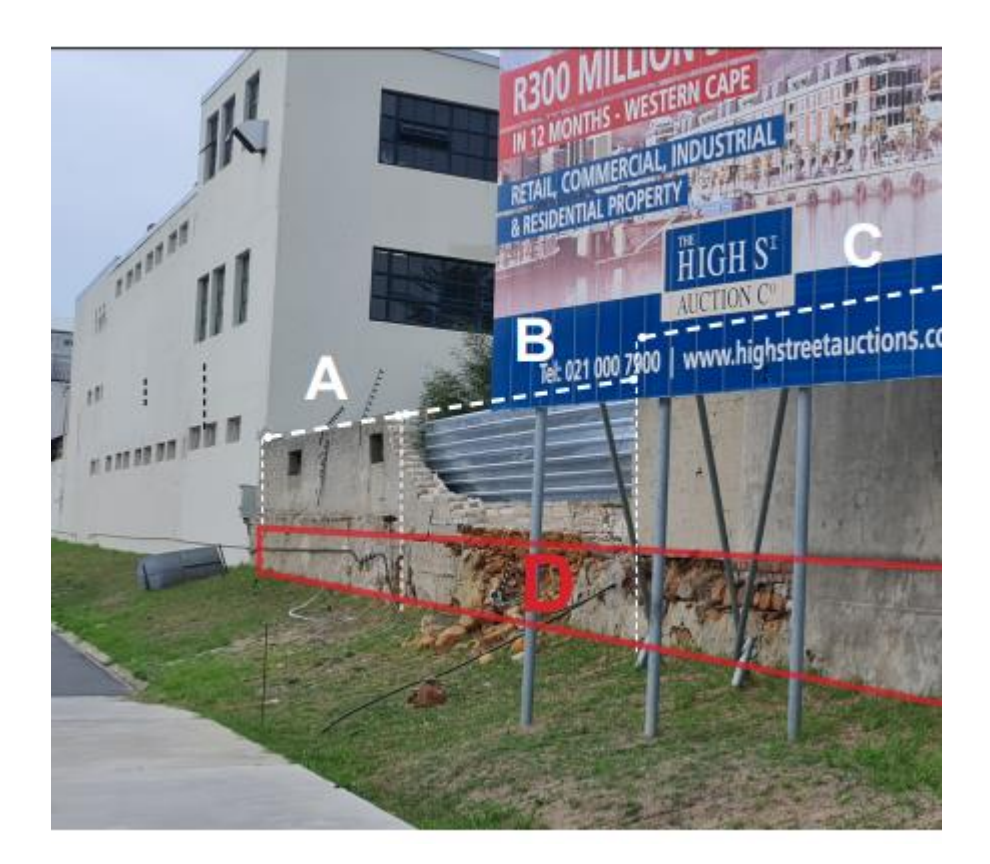
Fig 7. Wide view of the northern wall and building to the east of the cemetery showing mechanisms proposed to restore the wall.