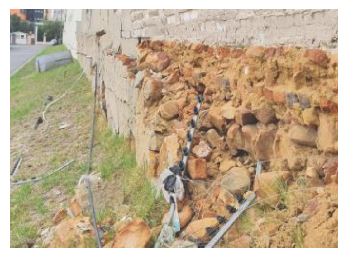
Fig 5. View of the northern wall collapse