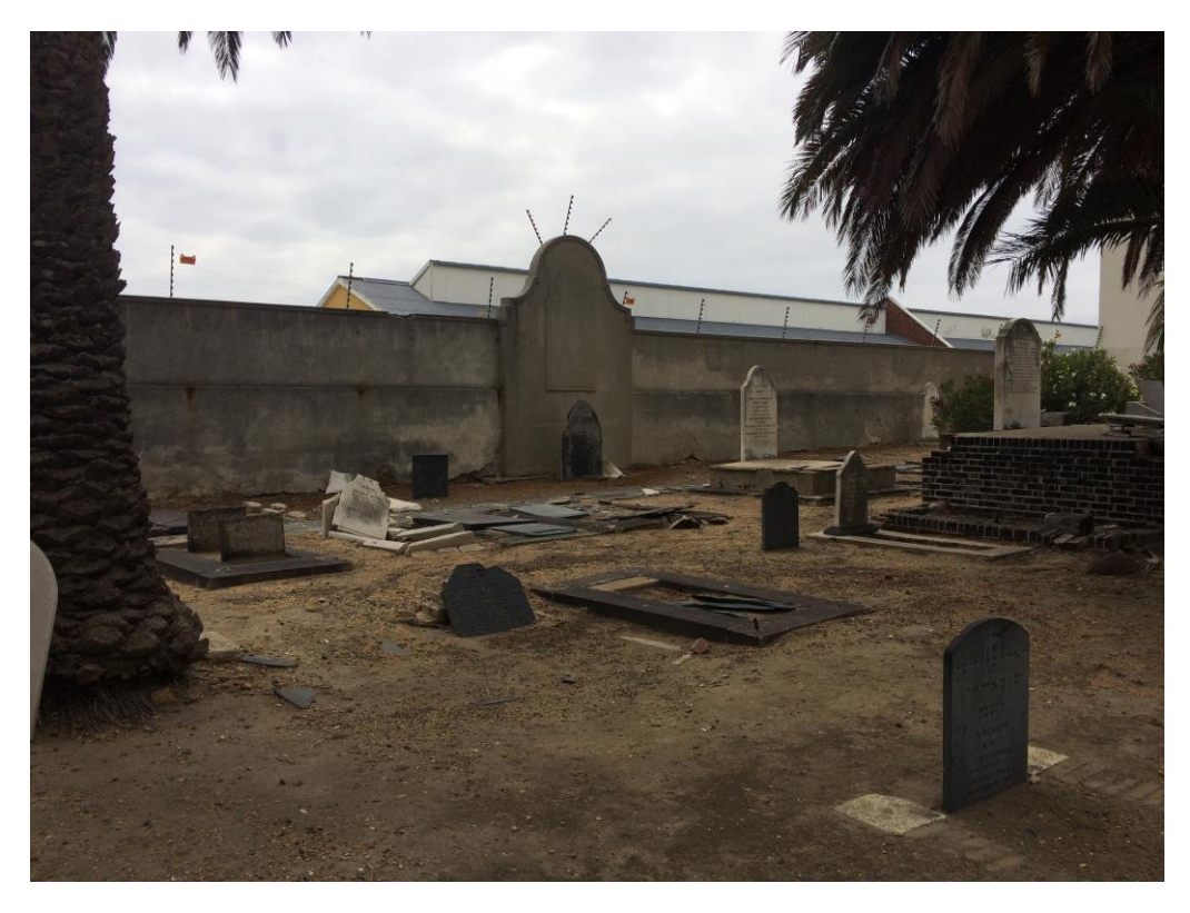
Fig 3. photograph of the interior of the cemetery looking towards the north wall (2022) which has now partially collapsed.