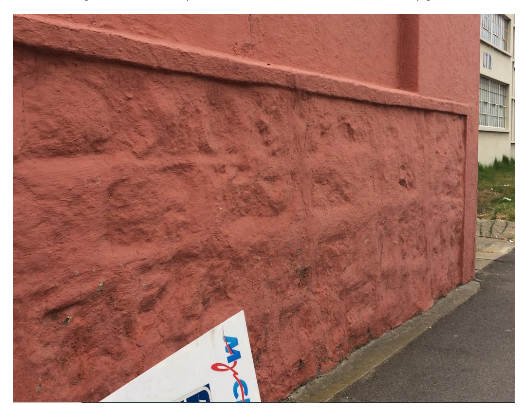
Fig 6. The old stone perimeter wall off Albert Road.