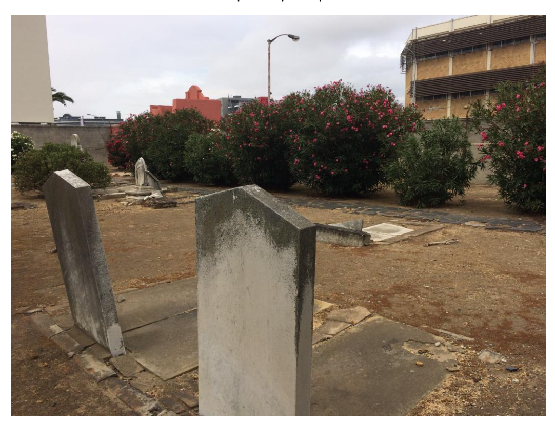
Fig 4. View of the interior of the cemetery looking south-east towards Albert Road. The area is partially screened from the traffic noise by a row of oleanders.