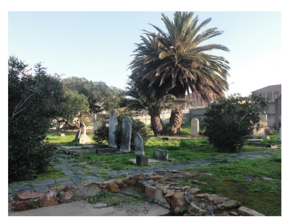
Fig 2. View of the interior of the cemetery looking towards lower Church Street and the bridge. Certain paths are created from old stone. There is a list of those buried at the cemetery although sometimes the gravestones are illegible because of age.