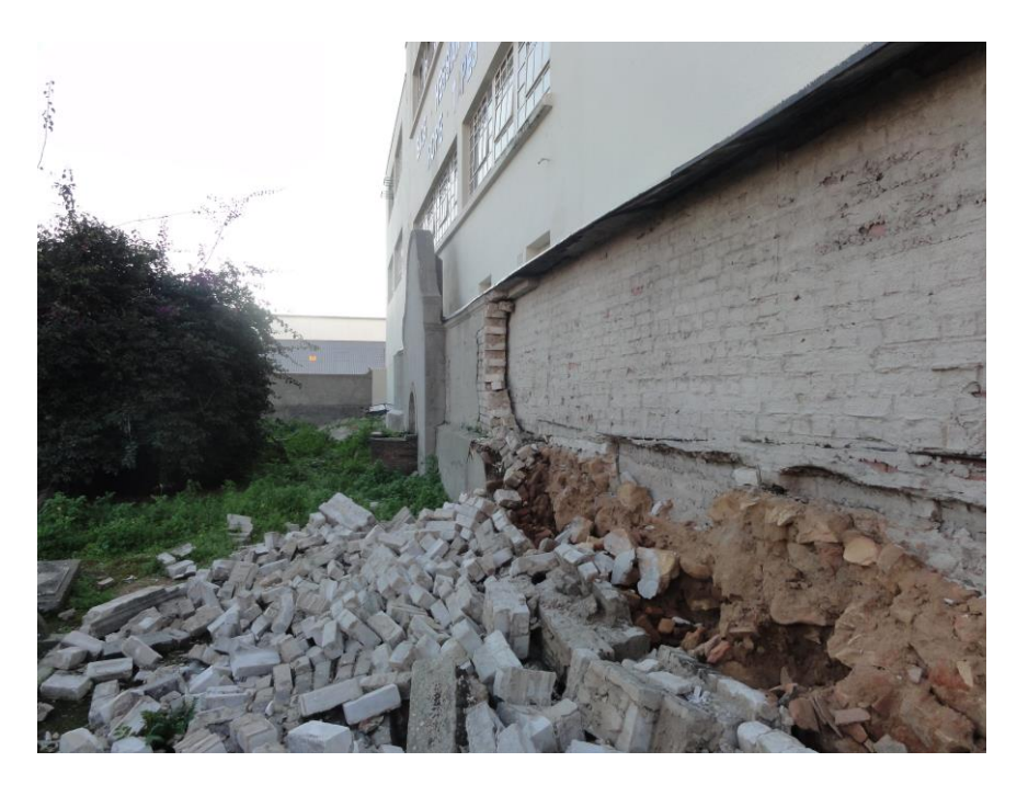
Fig 1. View of the eastern wall looking towards the northern wall. This show the collapse of the cement bricks built on top of the old stone wall. The cement bricks have been cleared.