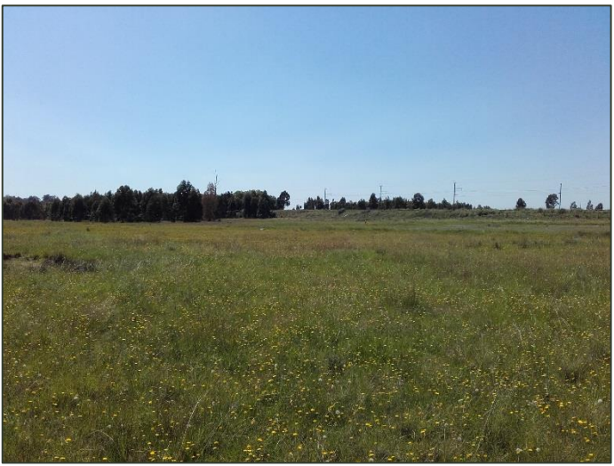
Figure 6: Vegetation type in the centre of the proposed development