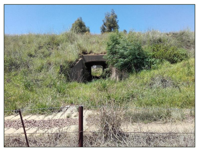
Figure 2: Underground train bridge south-west of the proposed development, proposed for pedestrian access