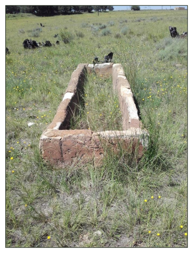
Figure 3: Some old structural remains used for agriculture