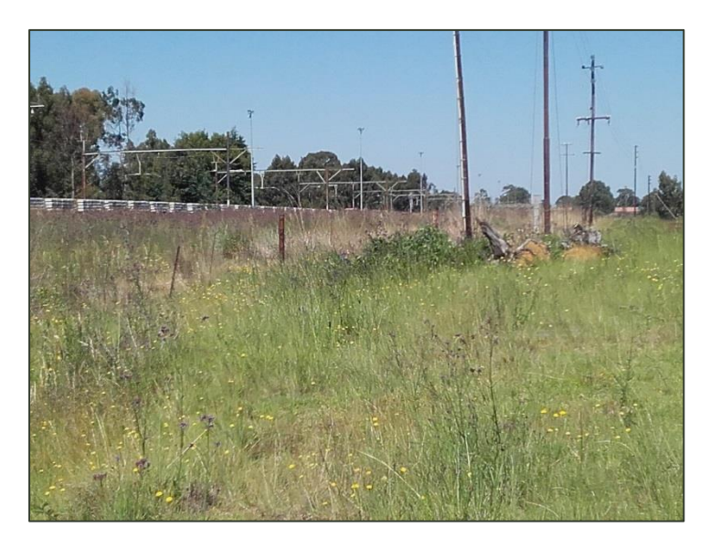
Figure 4: Railway line along the southern boundary of the proposed site