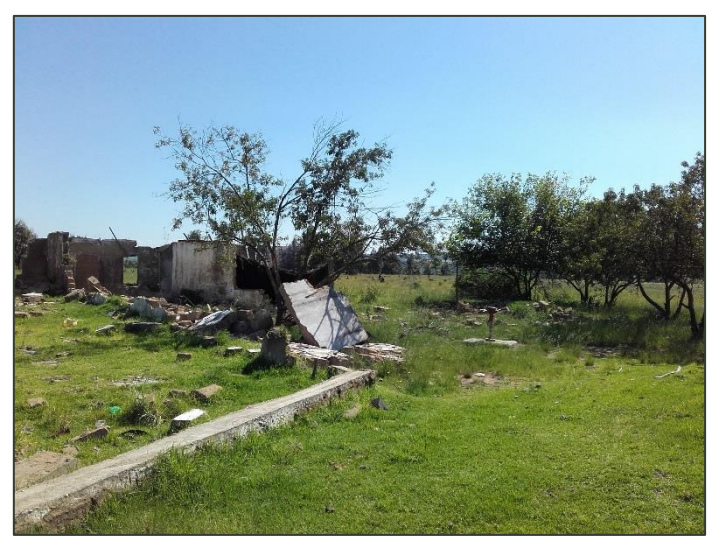
Figure 5: Remains of old agricultural dwellings within the boundaries of the proposed site