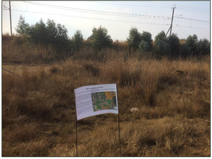
Figure 8: Site notice placed along the southern boundary of the site, close to Pfamoni Investiments (Adjacent Business)