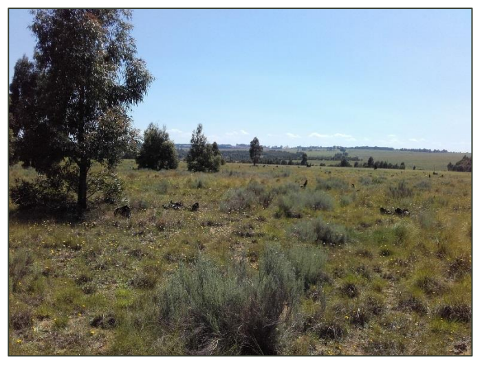
Figure 1: Northern side of the area proposed for development