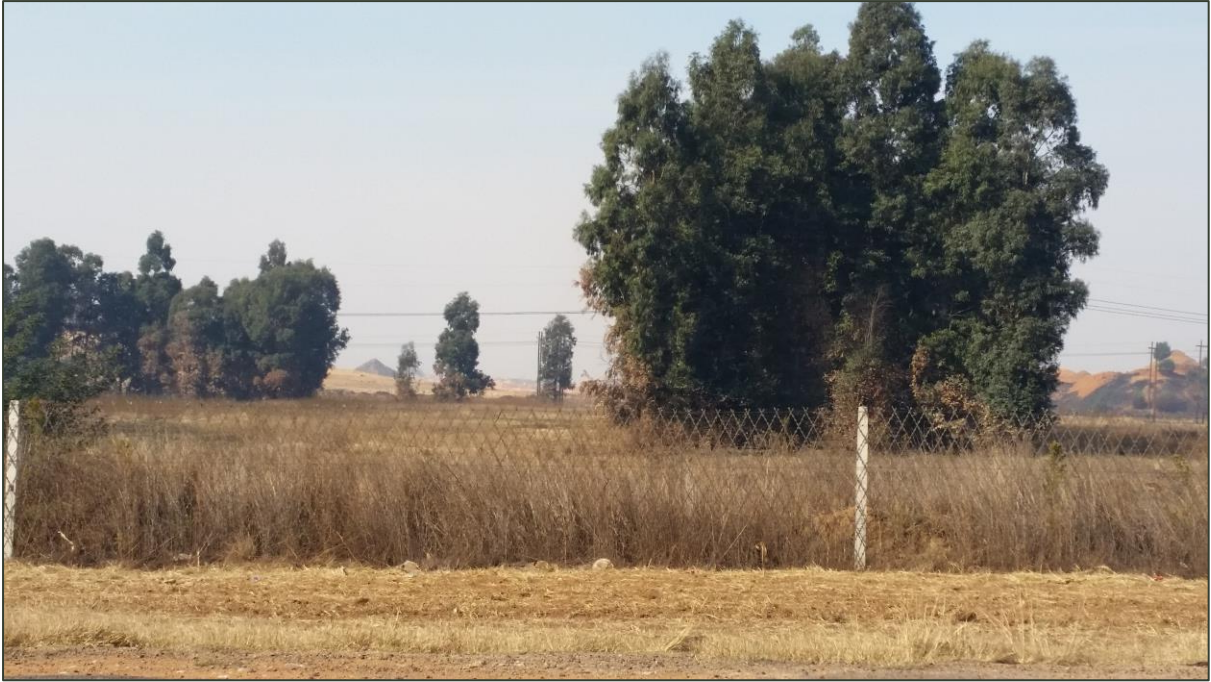
Figure 1: Area where the power line will traverse