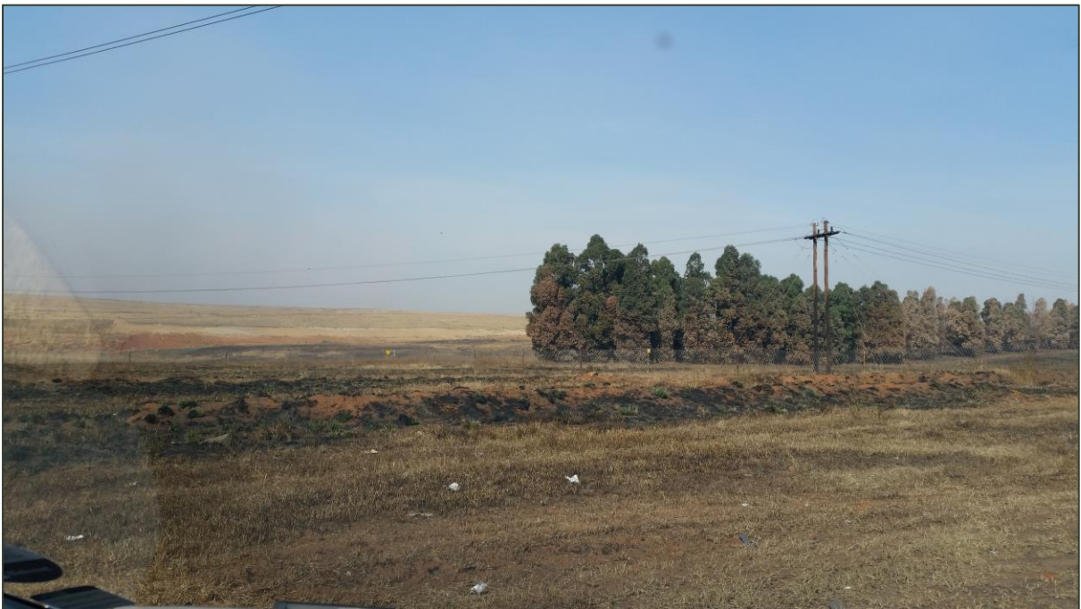
Figure 4: Area where the substation is proposed