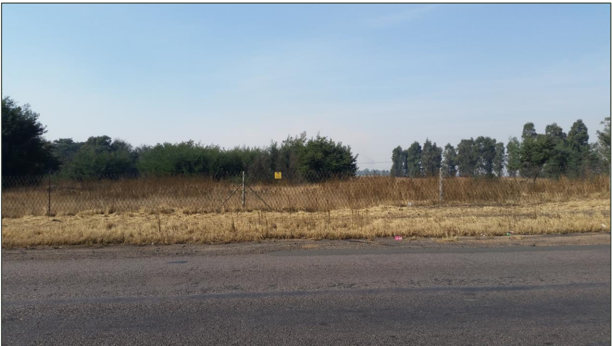
Figure 2: More area that will be traversed by the power line