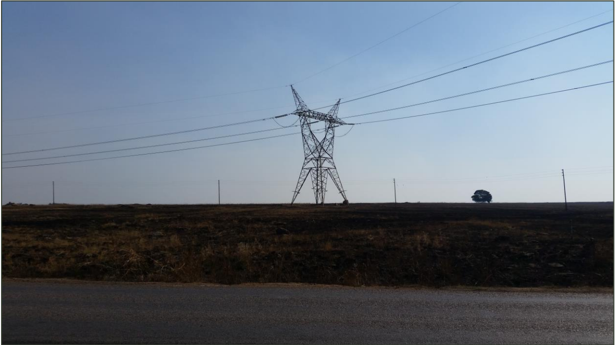
Figure 3: Power line that will have to be crossed by the proposed 400kV power line