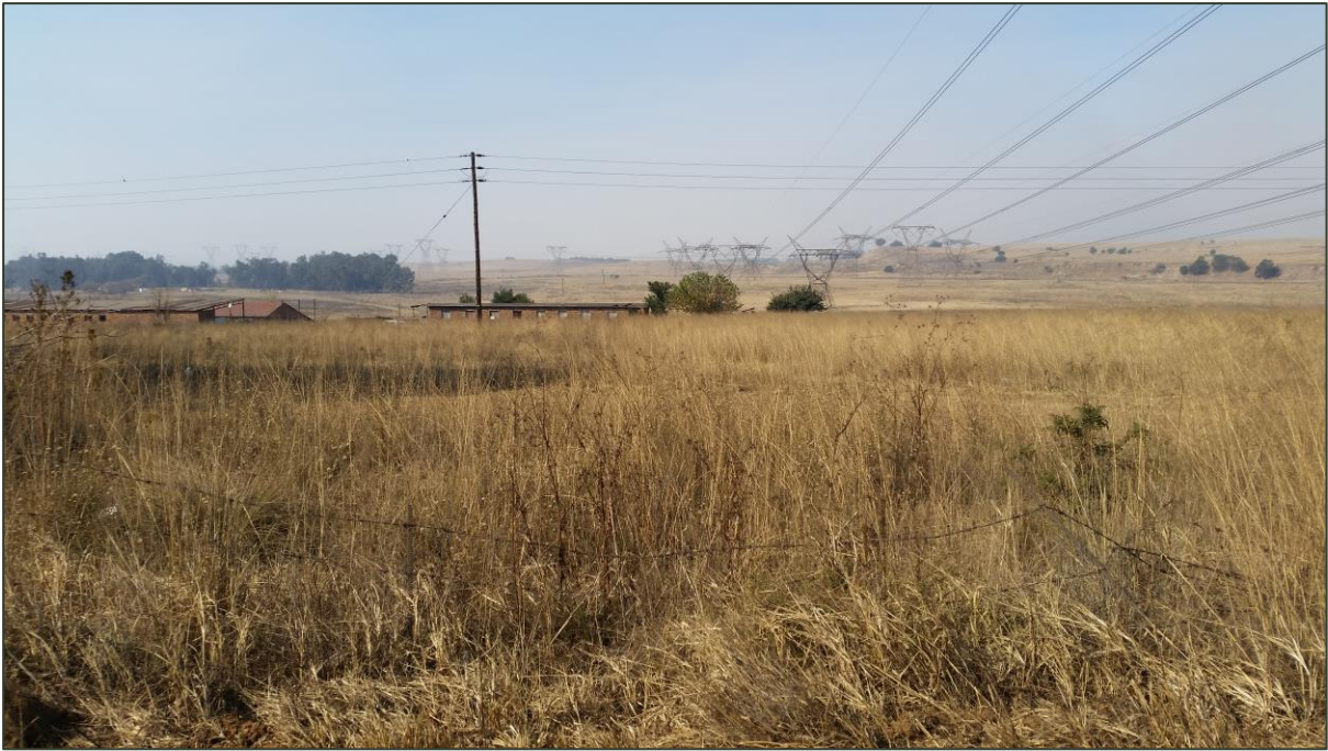
Figure 5: Structures (houses) located approximately 100 metres from the proposed substation area