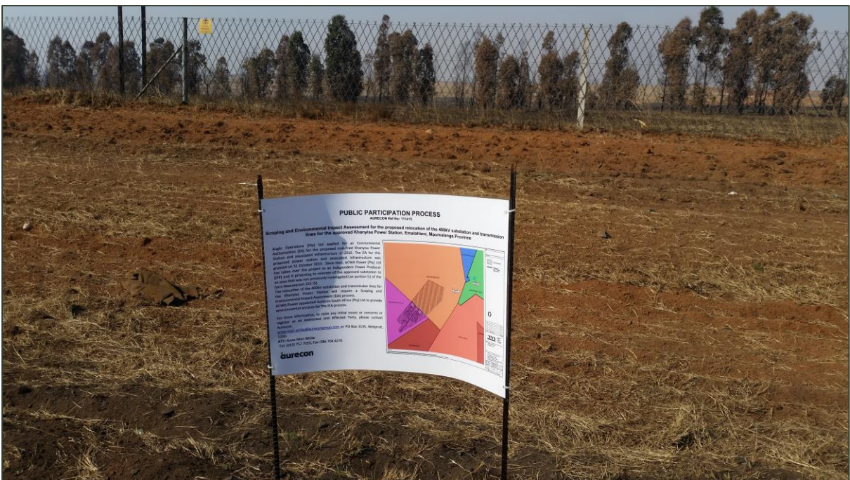
Figure 6: Site notice placed along the area where the power line is proposed