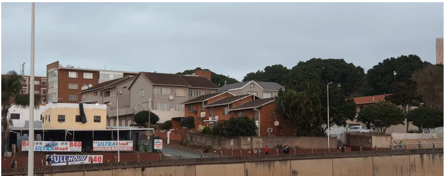
Street elevation view at the intersection of Dinu Zulu (Berea) Road and Sylvan Grove.