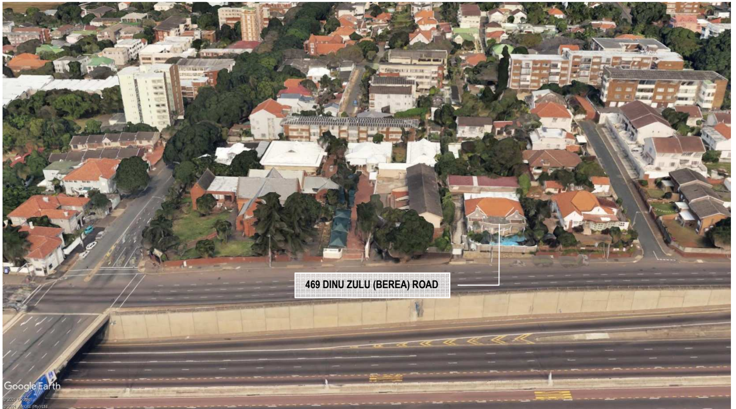
Aerial 3D view showing building heights within the neighbourhood context.