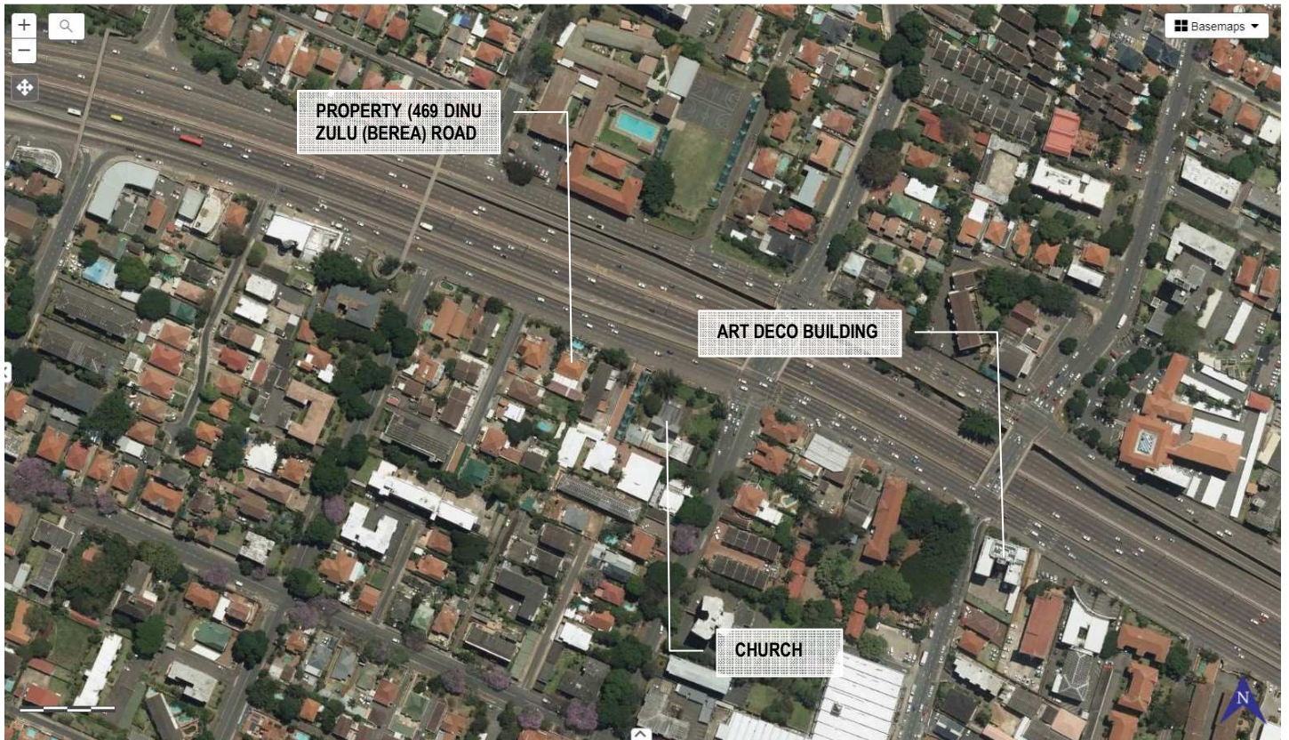
Locality aerial image.