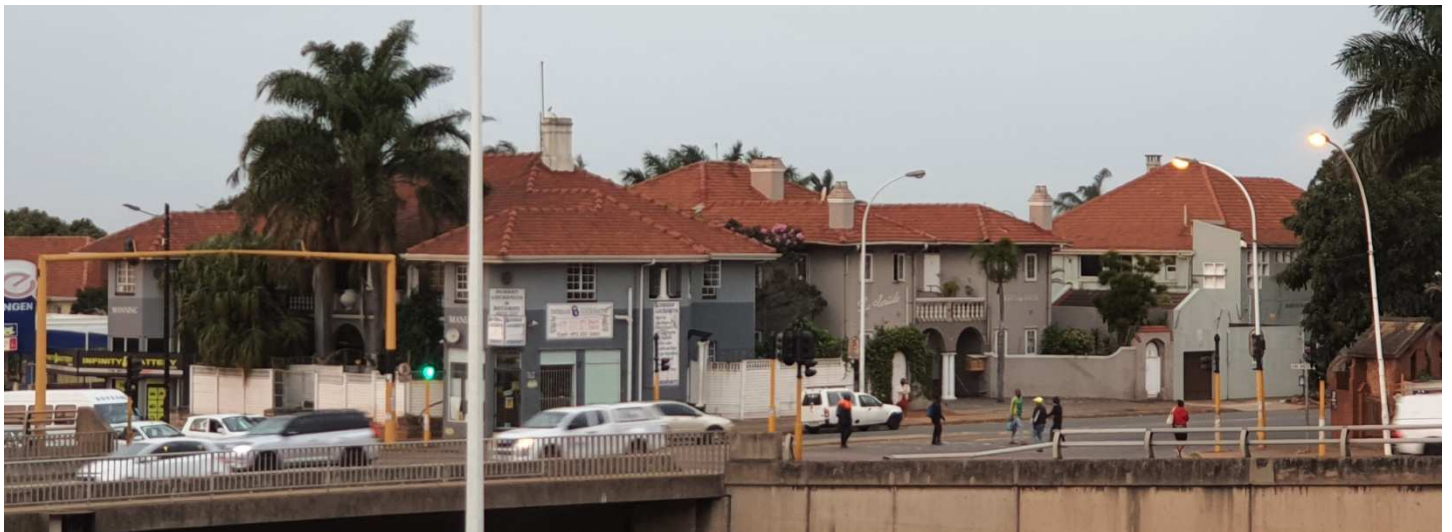
Street elevation view at the intersection of Dinu Zulu (Berea) Road and Lena Ahrens Road.