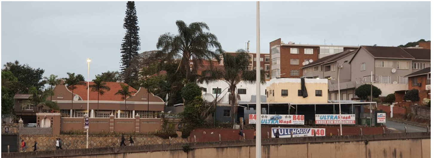
Street elevation view of the adjacent property to the north-west.