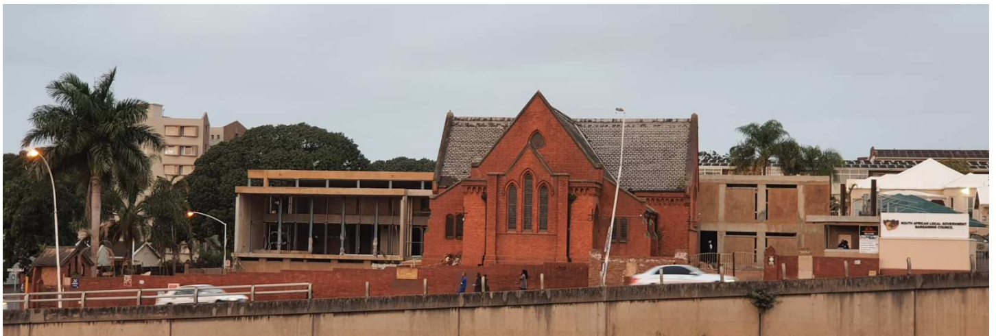
Street elevation view of Church (3 properties down).