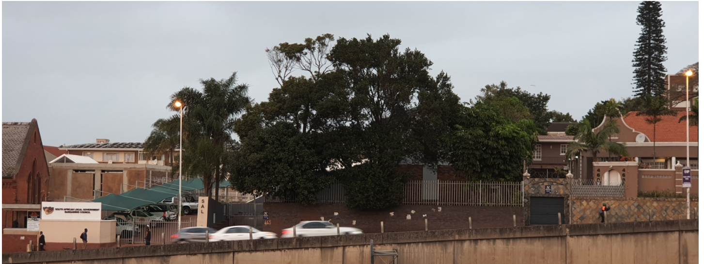
Street elevation view of the adjacent property to the south-east.