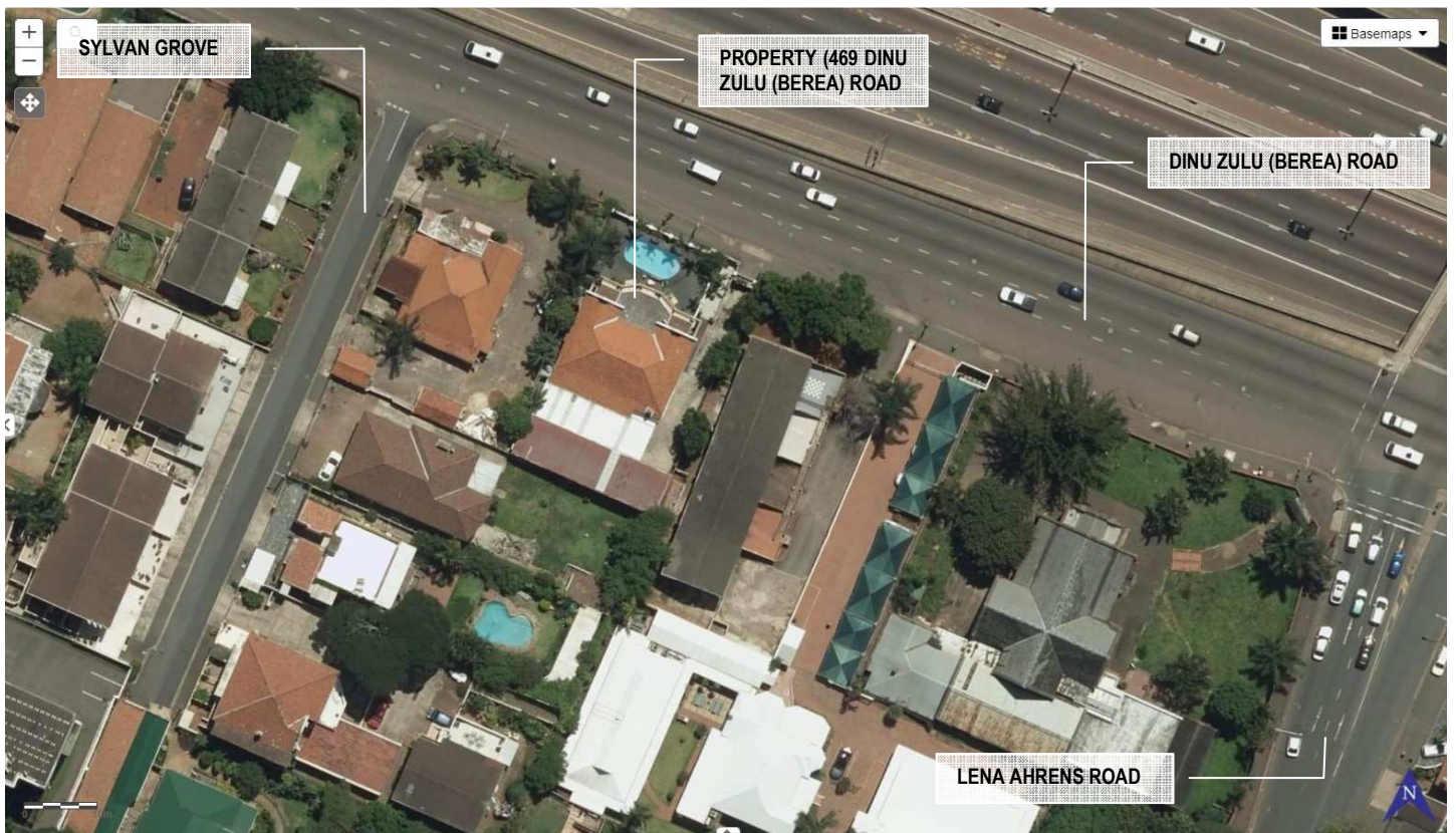
Immediate surrounding aerial image.