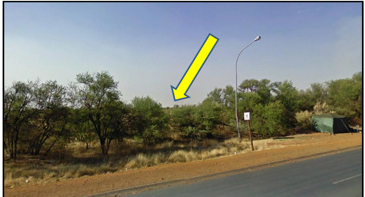
North-easterly view taken from the site boundary. The residential area of Wrenchville lies beyond the open area (arrowed).