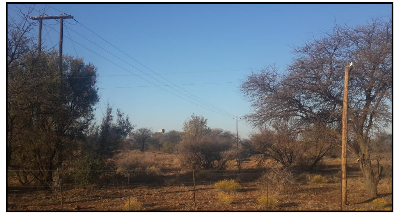
Easterly view taken from the existing access road to the site.

South-westerly view taken from the N14 towards the site (arrowed). Residential area of Wrenchville lies to the right of the N14.