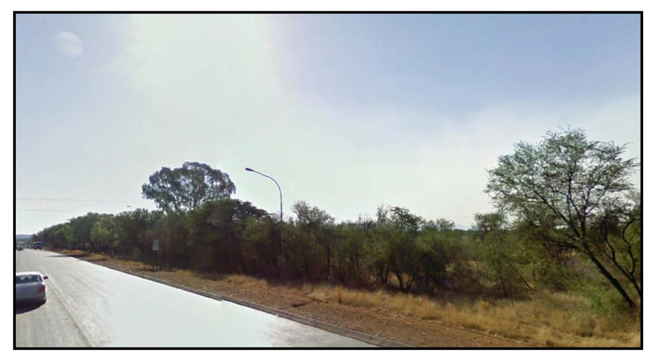
Westerly view taken from the N14. Site boundary visible to the left with the existing access road (arrowed) to the right and the Eldorado hotel beyond that.