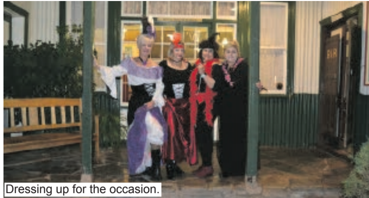
Dressing up for the occasion.