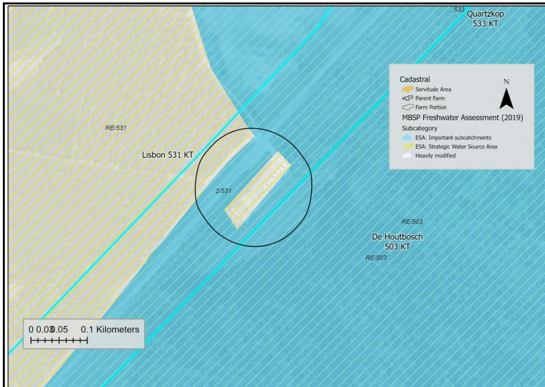
Figure 2: MBSP Freshwater assessment map of the Skywalk development site.

The MTPA thank Zutari for the comprehensive assessment reports.