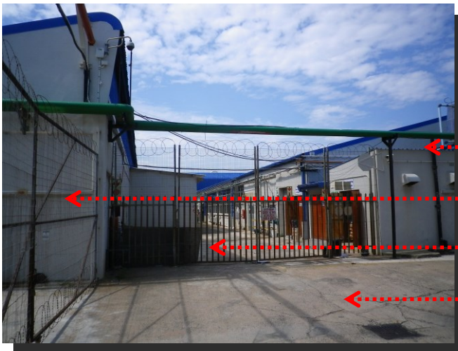
Photo: C9: South Western View: Existing building 7. ← Existing building 4. ← Existing building 7. ← Position for the new building. ← Existing service driveway.