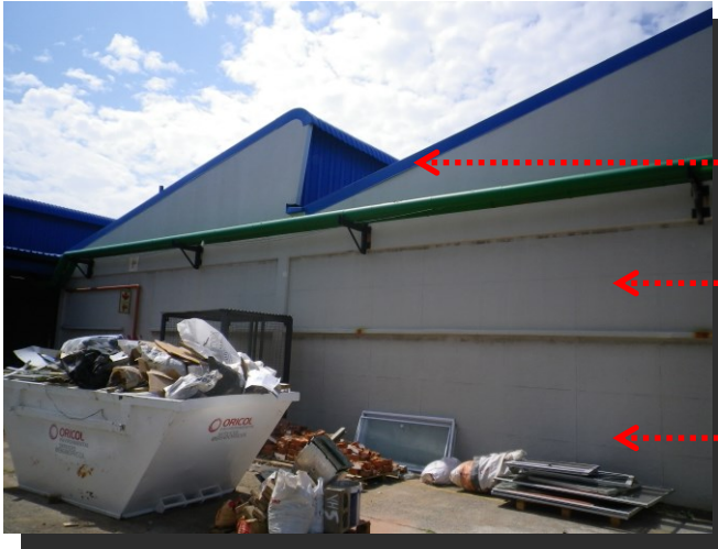
Photo: C8: Sothern View: Existing building 7. ← Saw-tooth roof profile. ← Steel framed windows have been removed. ← Plaster & painted walls.