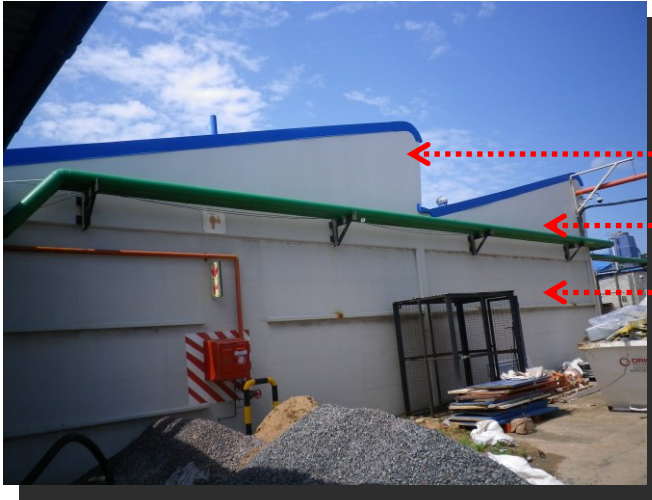
Photo: C7: Western View: Existing building 7. ← Saw-tooth roof profile. ← Plaster & painted walls. ← Steel framed windows have been removed.