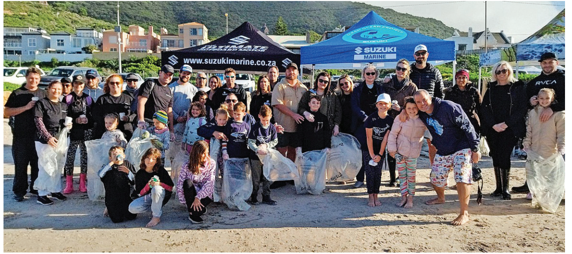
■ The clean-up volunteers prepare to set off from Mariner's Wharf.