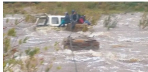
Passasiers van die bakkie sit op 'n pilaar van die ou brug langs die bakkie.

Nuweplaas se inwoners ry deur Prinsekraal, Beukeskraal en dan met 'n ompad verby Langbome om in die dorp te kom. Alhoewel Nuweplaas net sowat 15 km van Wupperthal is, neem dit ongeveer 30 minute om die pad te ry.