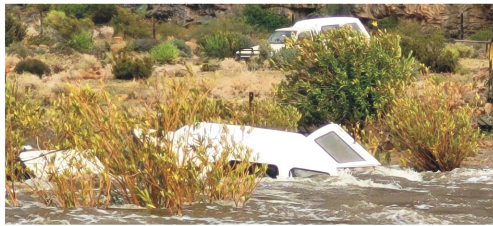
Die bakkie is onder water.