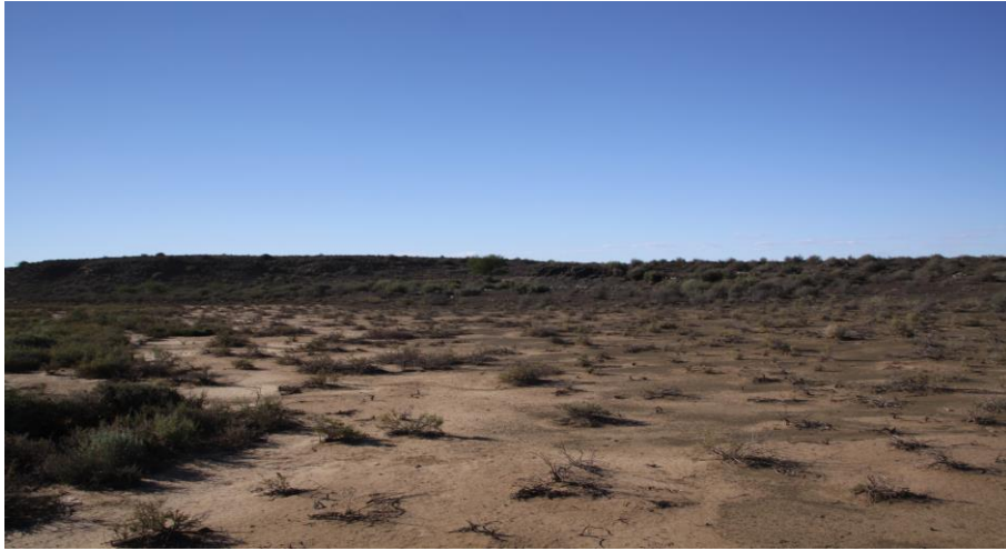
Photo 1 was taken standing in the floodplain (No-go area) facing North, looking towards the site