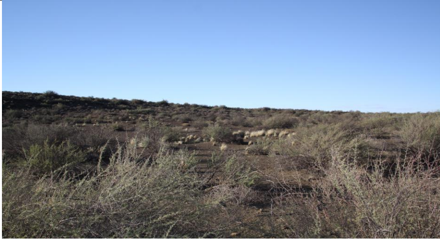
Photo 9 was taken standing on the SE corner, facing NW