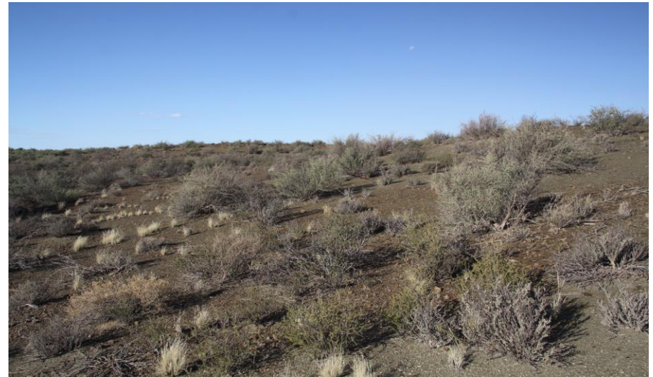
Photo 4 was taken standing on the SW corner of the proposed site facing SE