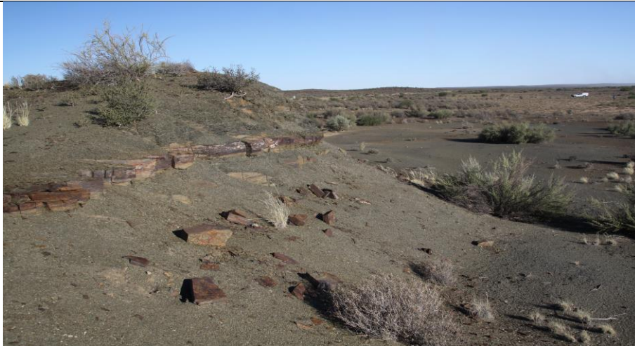
Photo 7 was taken standing on the SW corner, standing on the hill looking towards the proposed laydown area