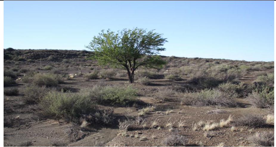
Photo 6 was taken standing on the SW corner of the proposed site facing NW. Notice the invasive alien tree that needs to be taken out