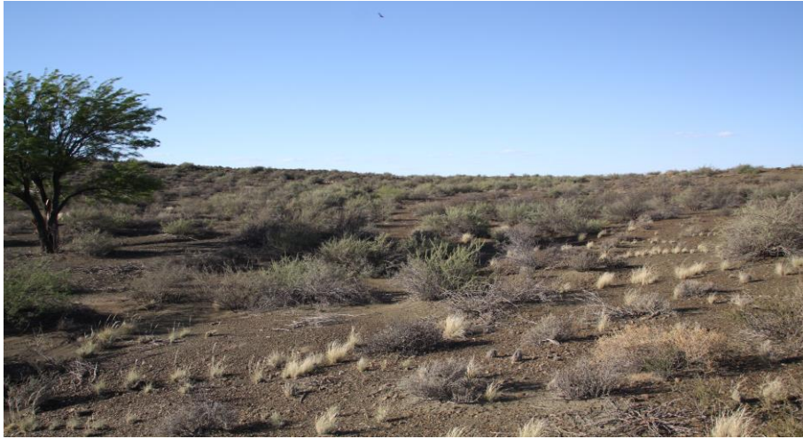
Photo 5 was taken standing on the SW corner of the proposed site facing NE. Notice the invasive alien tree that needs to be taken out