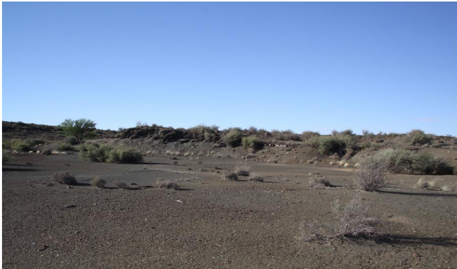
Photo 3 was taken standing in the Laydown area (Previously disturbed land)