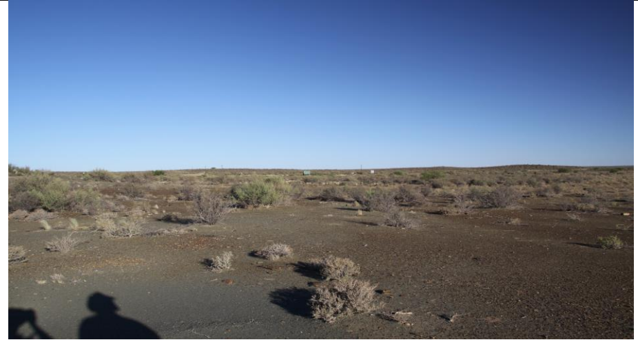
Photo 10 shows the proposed laydown area and the proposed route of the access road, where it will meet the main road