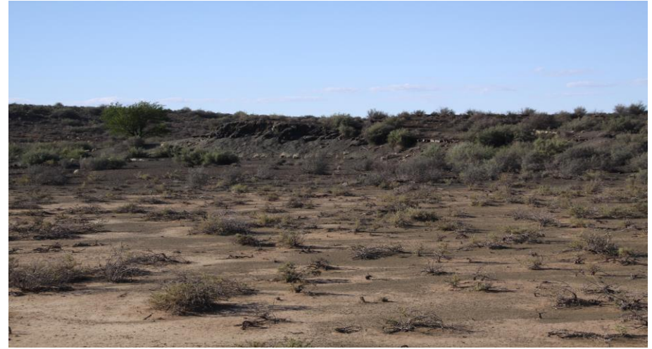
Photo 2 was taken standing in the floodplain facing East, towards the Laydown area