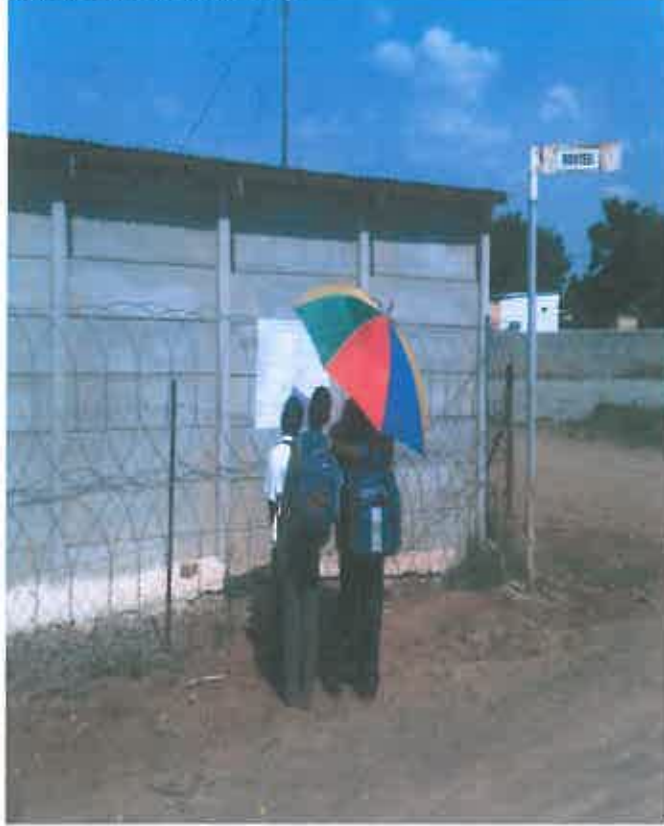
Lapologang Village (Corner D2565 and Montedi roads)