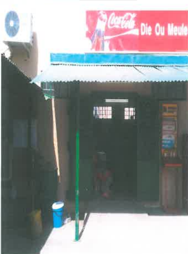
Die Ou Meule Cafe and Liquor Store