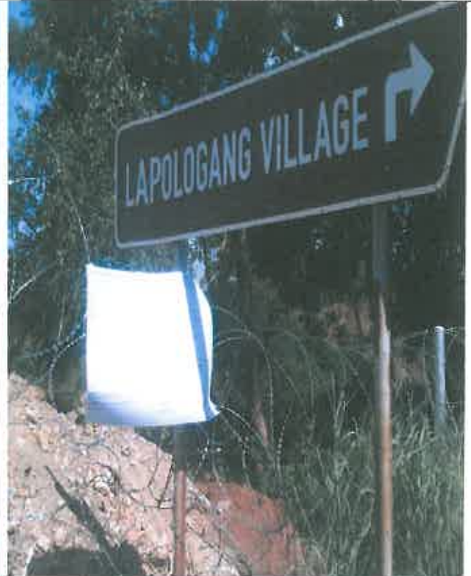
Tharisa Mine: Western Side, Junction to Lapologang