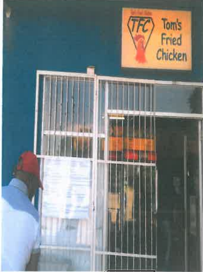
Tom's Fried Chicken, Standard Bank Centre, Marikana Town