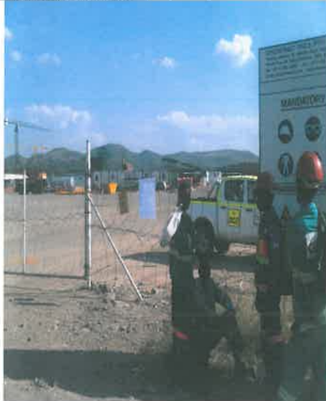
Tharisa Mine Main Gate: Eastern Side