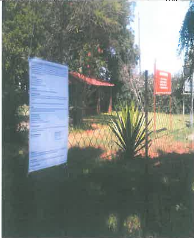
Piet Retief Primary School