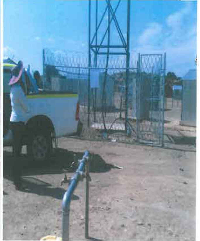
Silver City Water Collection Point (West of Sterkstroom River)