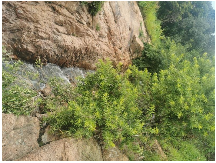
The Bryanston Spruit