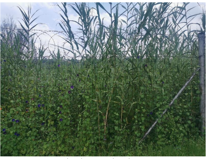
Hydrophytes within the site