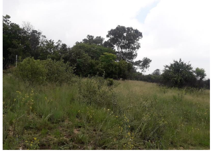
Mixture of low laying and tall vegetation