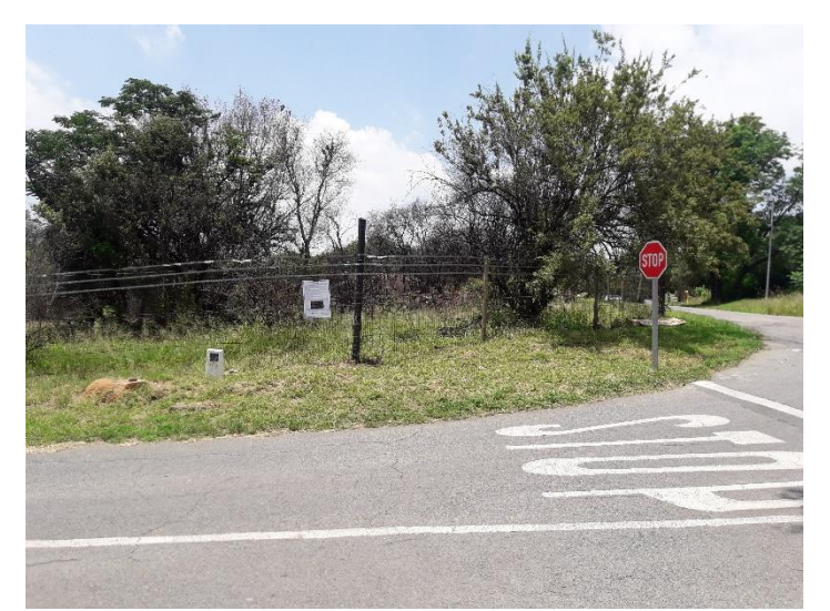
View of the site from Spruce Street