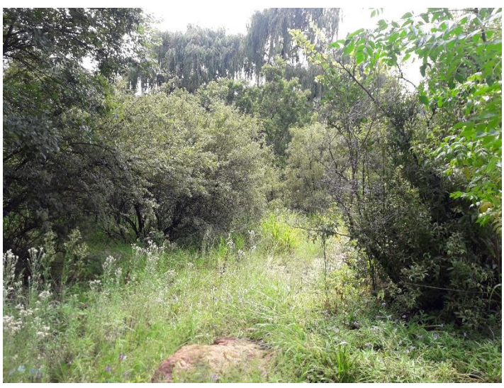
Thick vegetation on site