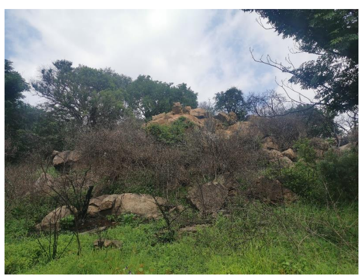
The massive rock outcrop