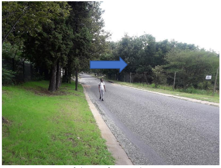
View of the site from Cork Avenue