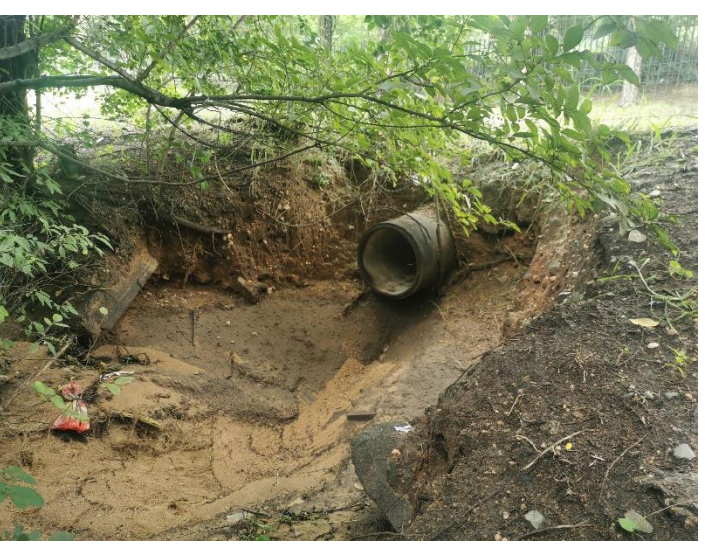
Stormwater pipe discharges into the site