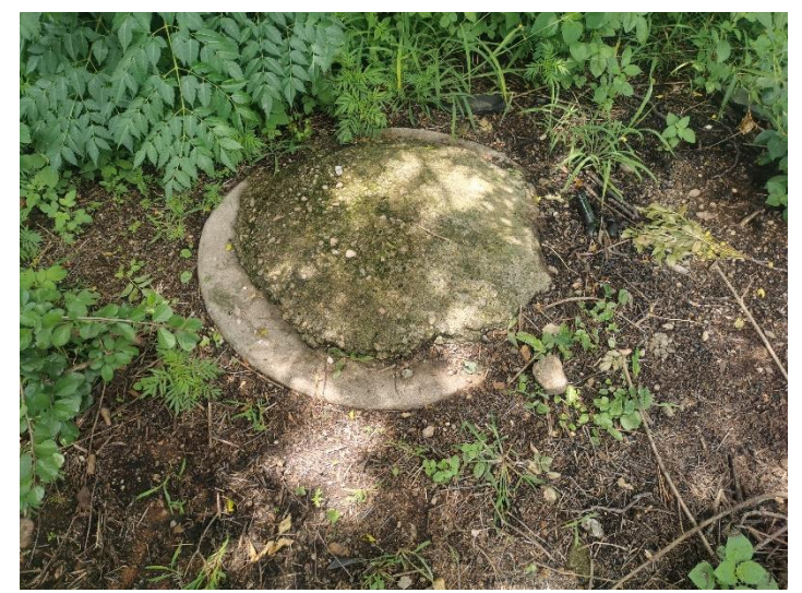
Manhole observed on site