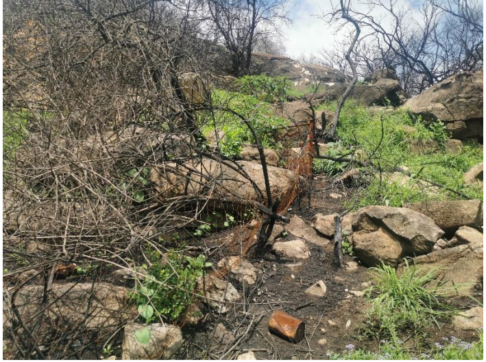
Dilapidated fence along the massive rock outcrop