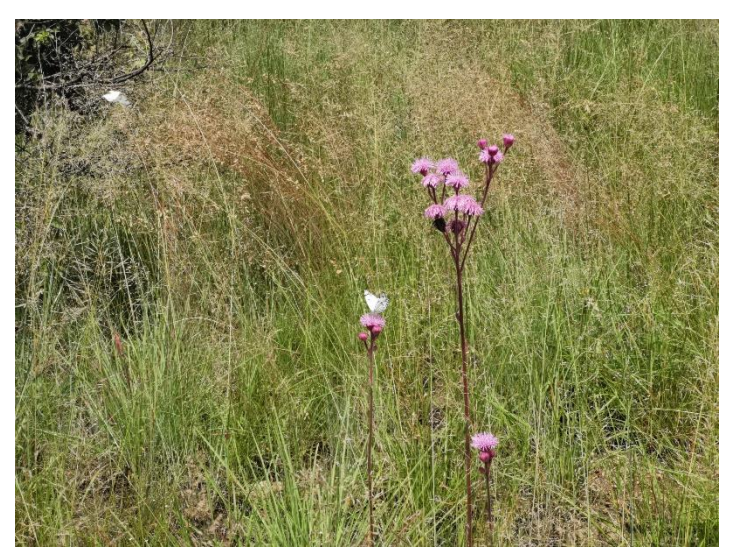
Butterfly pollinating on some flowers