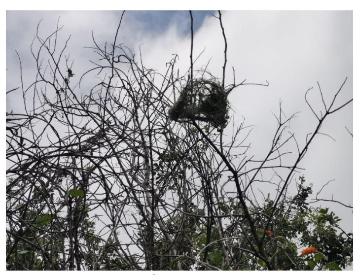
Bird nest on site