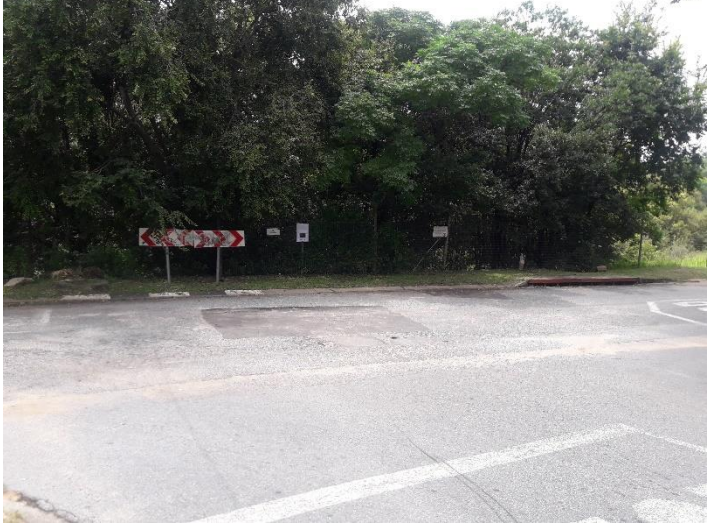
View of the site from intersection of Cork Avenue and Poplar Street