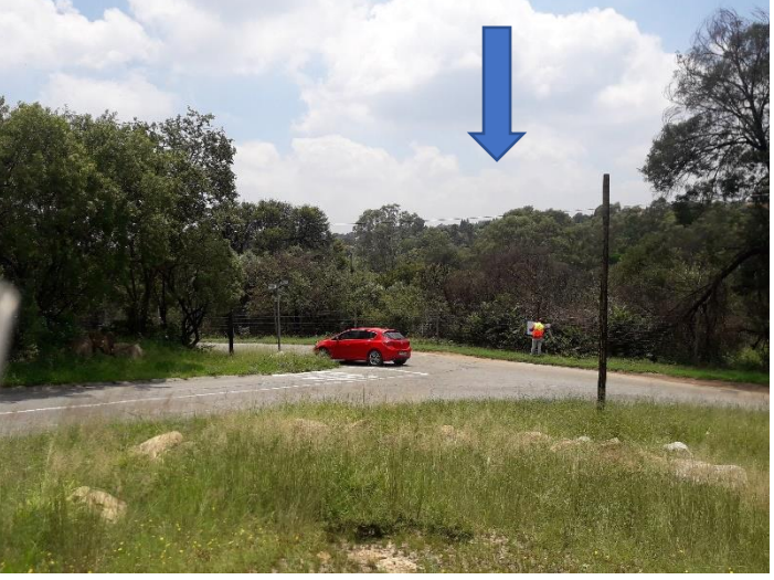
View of the site from Poplar Street