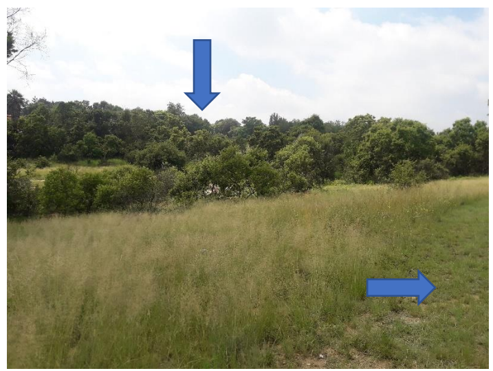
General conditions of the site, footpaths and pristine environment