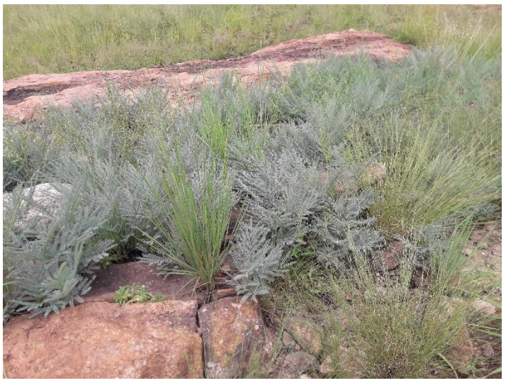
Prominent rock outcrops at portions of the site