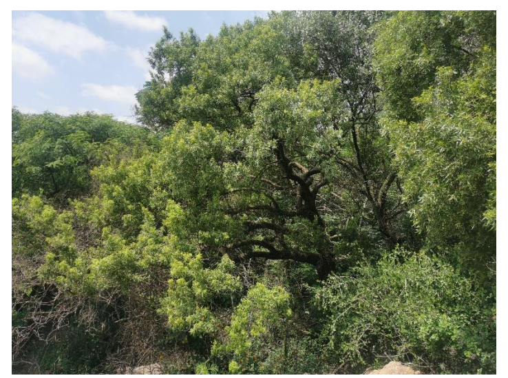
View of the site vegetatin from the the top of rock outcrop