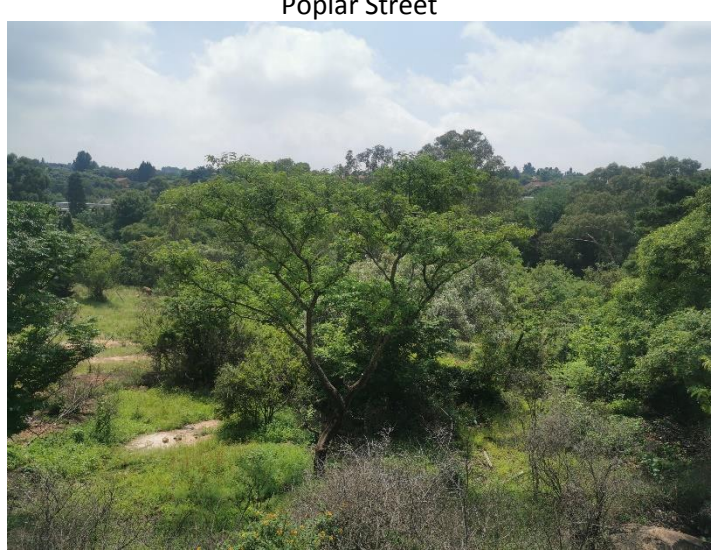
View of the site from the the rock outcrop