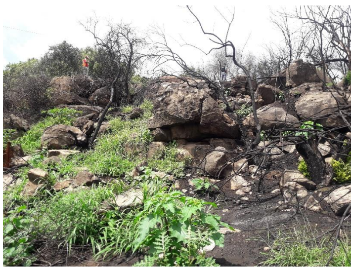
Massive rock outcrop and boulders towards the northwestern edge