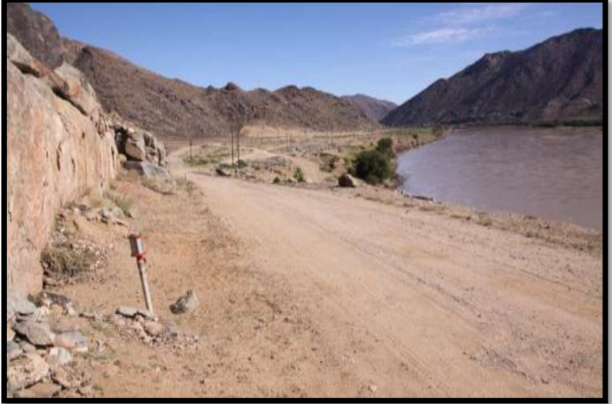
Henkries pre-sedimentation facility and pump station