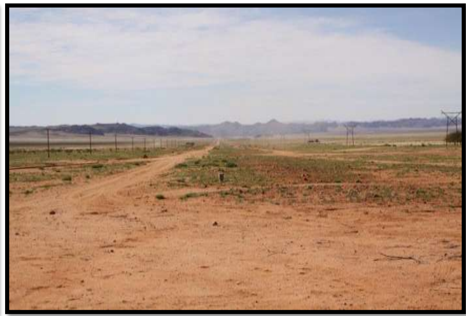
View of N7 between Eenriet and Okiep (N-S)

Between Doornwater and Eenriet Reservoir (N-S)