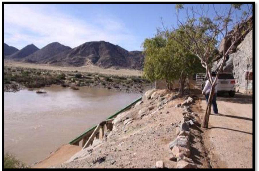
Open channel between pump station and Henkries WTW (E-W)