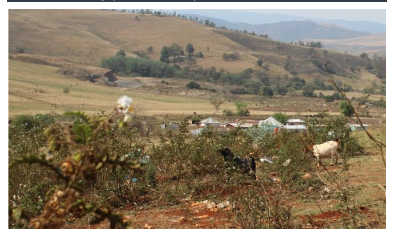
Figure 13: Goats feeding on plants immediately outside the landfill entrance