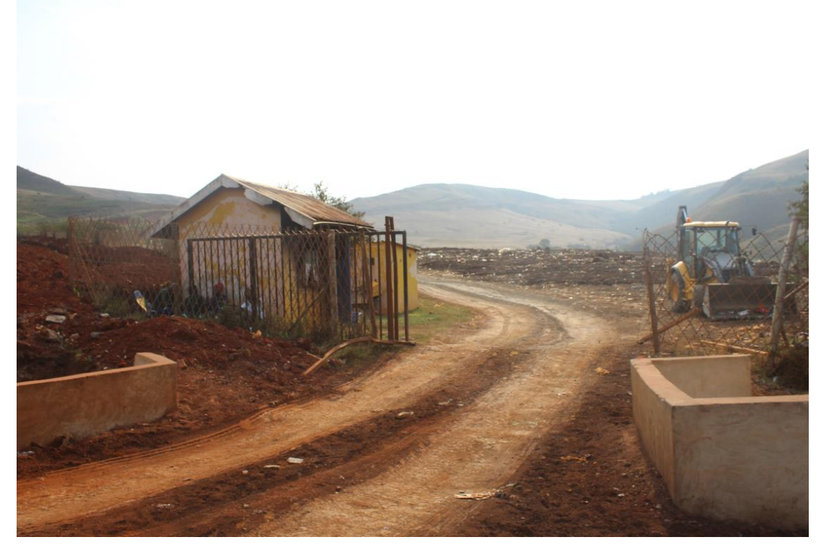
Figure 3: Site entrance with the guardhouse in the forefront