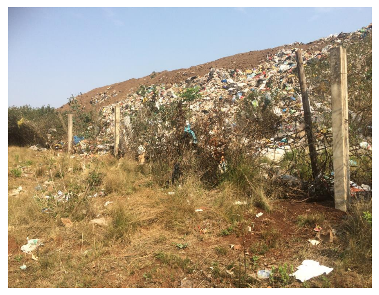
Figure 15: Close up of the waste body viewed from the northern boundaries of the landfill. Note the poor state of the fence