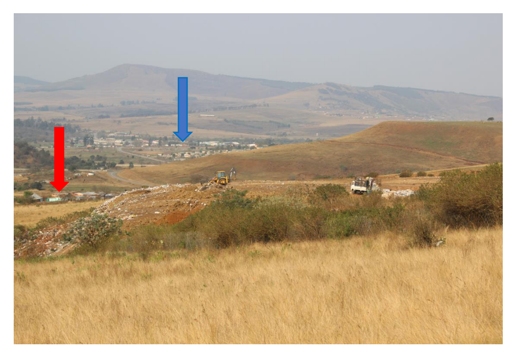
Figure 17: View towards the east towards showing the landfill in the foreground, Mankofu Village in the middle (red arrow) and uMzimkhulu CBD in the background (blue arrow)