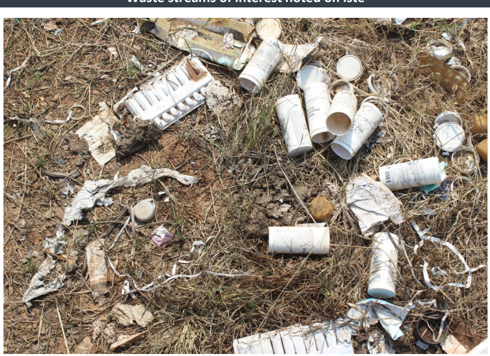
Waste streams of interest noted on iste