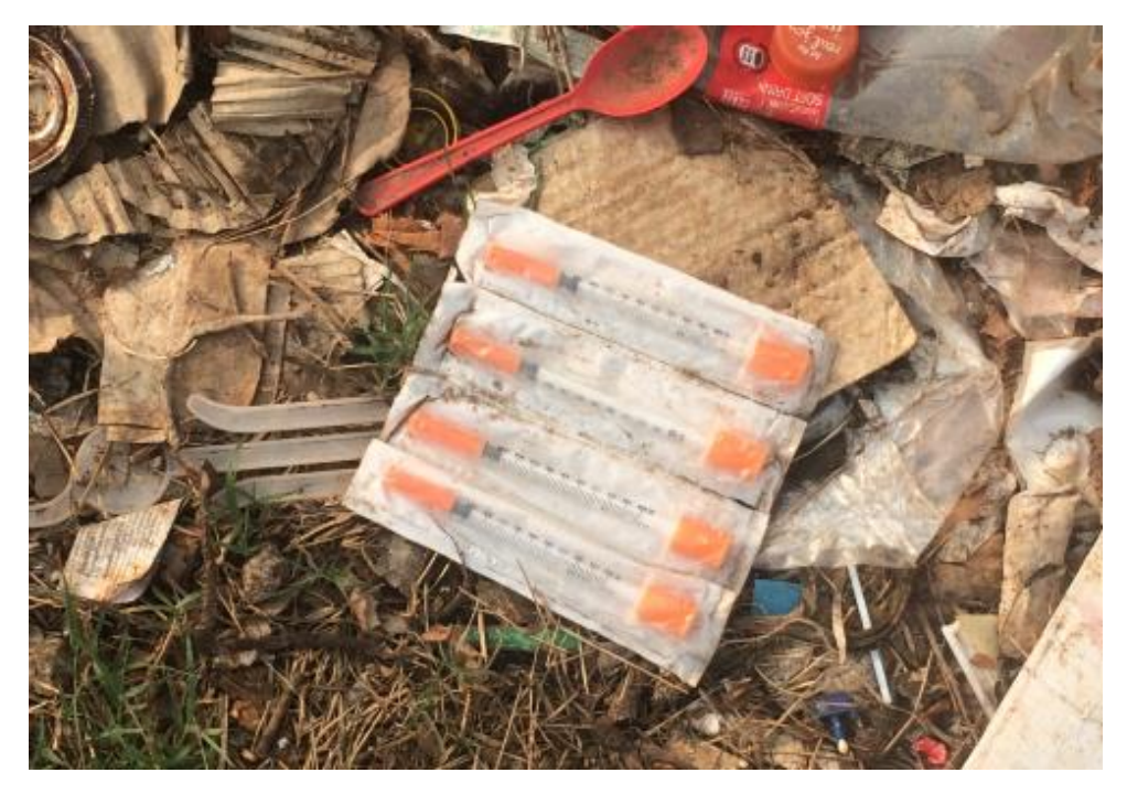
Figure 11: Insulin Syringes