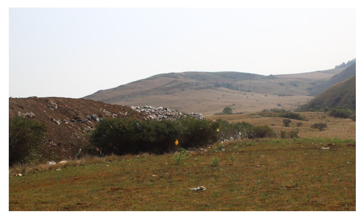
Figure 14: View towards the north west showing windblown litter in the foreground and the waste body in the background