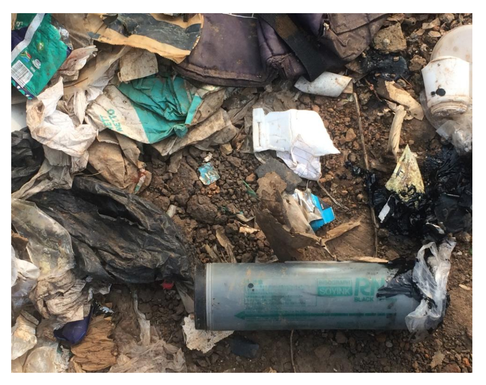
Figure 12: Ink container spilling excess ink on the ground