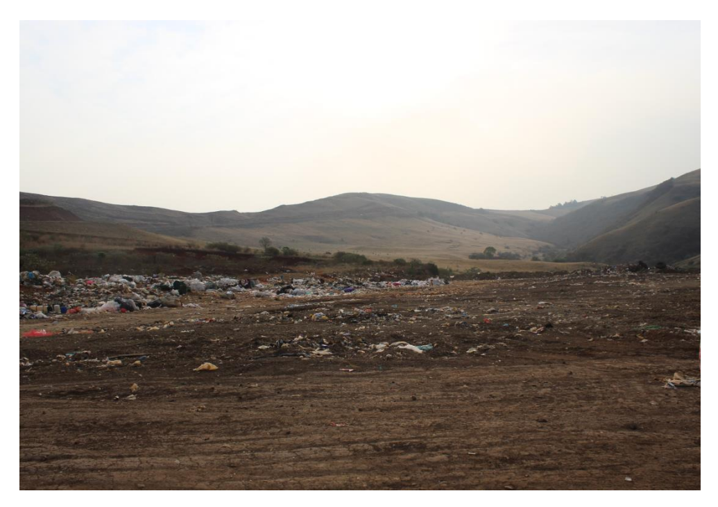
Figure 7: View towards the north west showing the waste on site showing uncompacted waste on the left and compacted waste on the right