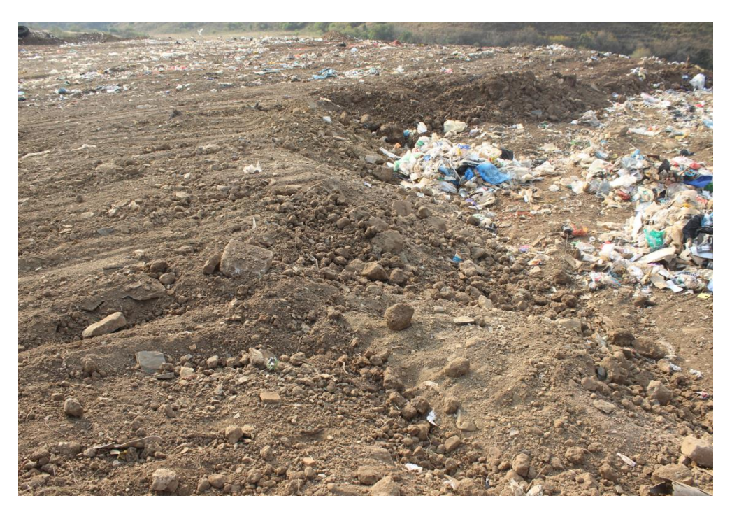
Figure 8: Waste capping efforts