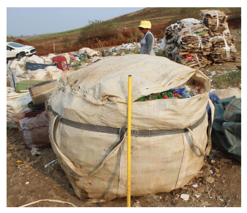
Figure 9: Examples of recyclables reclaimed from the landfill. Note the large bag filled with plastic bottles in the foreground and the carboard boxes in the background