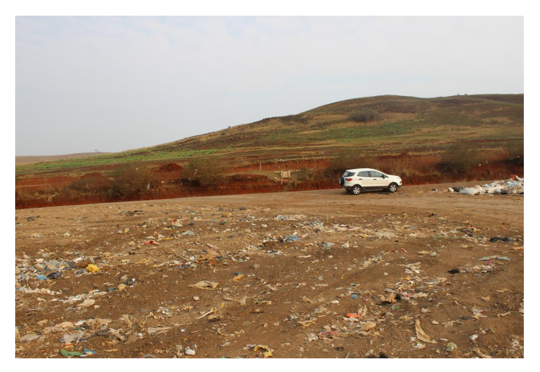
Figure 6: View towards the south showing the compacted waste in the foreground and the fence and the P601 in the background