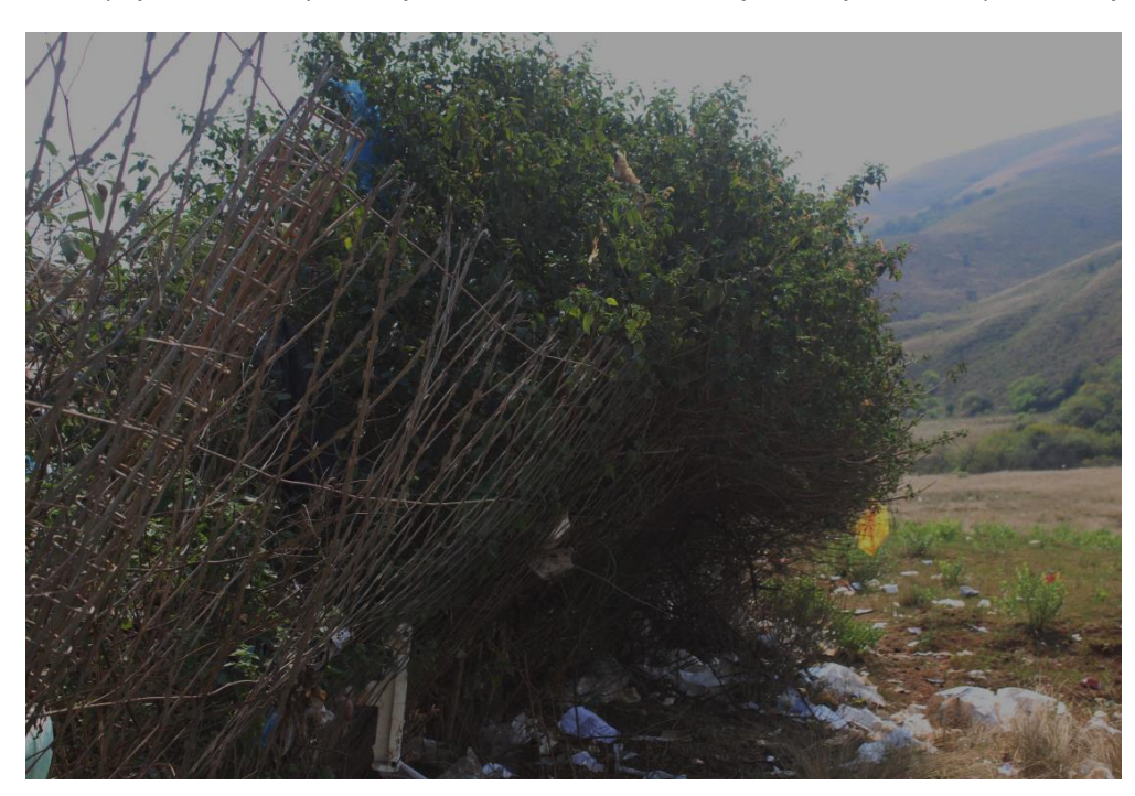
Figure 16: Slanted fence due to the weight of the waste body pushing against shrubs to the fence