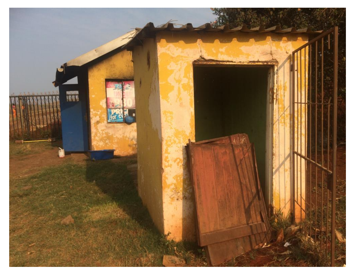
Figure 4: Site toilet in the foreground and the guardhouse in the background