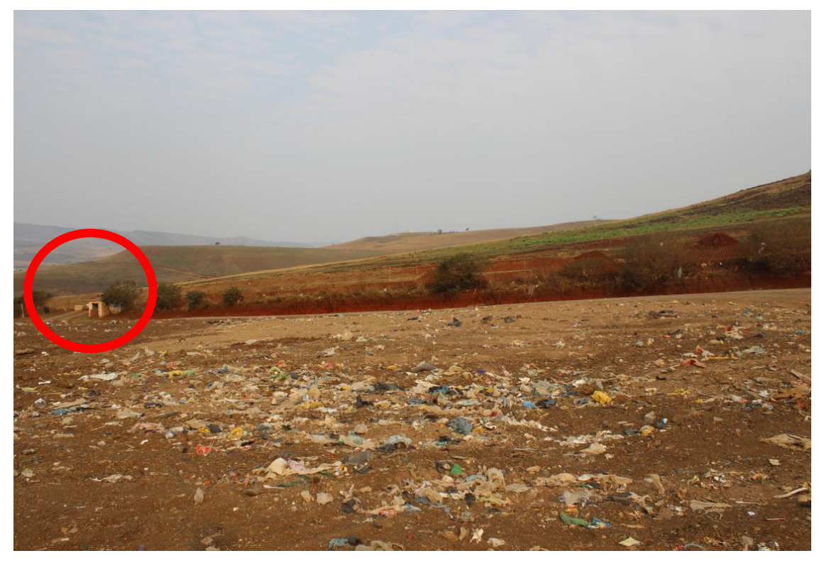
Figure 5: View towards the south east showing the site entrance (red circle)