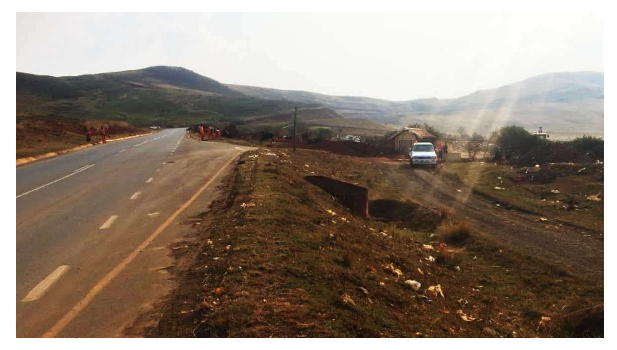
Figure 2: View towards the west showing the entrance to the site in relation to the P601 road to Franklin